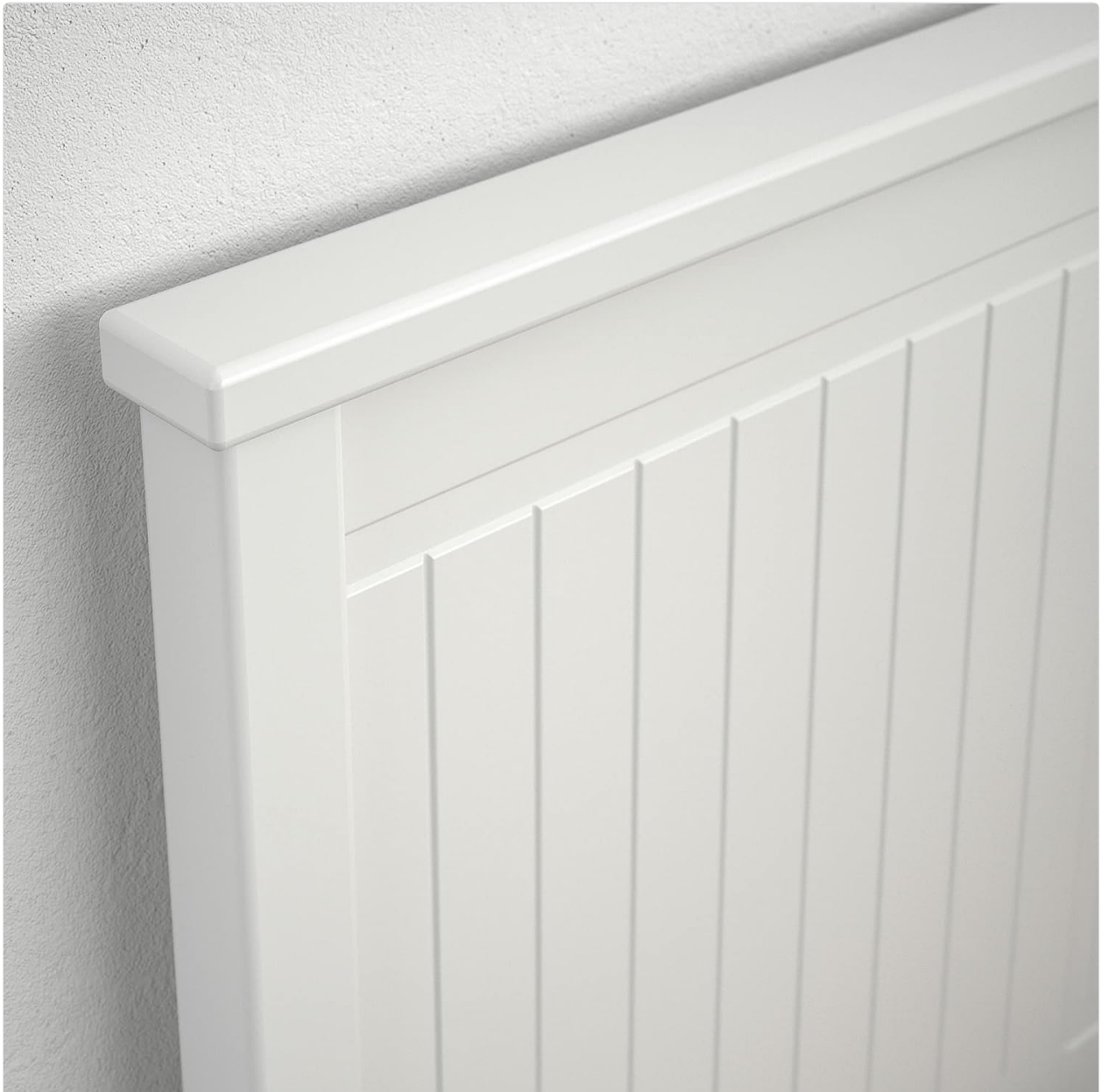
Image 5.1: A close-up view of the vertical paneling detail on the back and side of the HEMNES daybed, illustrating the finished