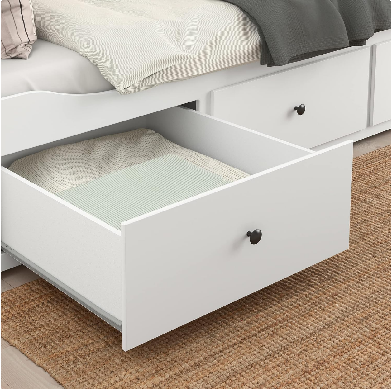
Image 6.2: A close-up view of one of the HEMNES daybed's drawers pulled open, revealing the ample storage capacity for items like blankets or pillows.