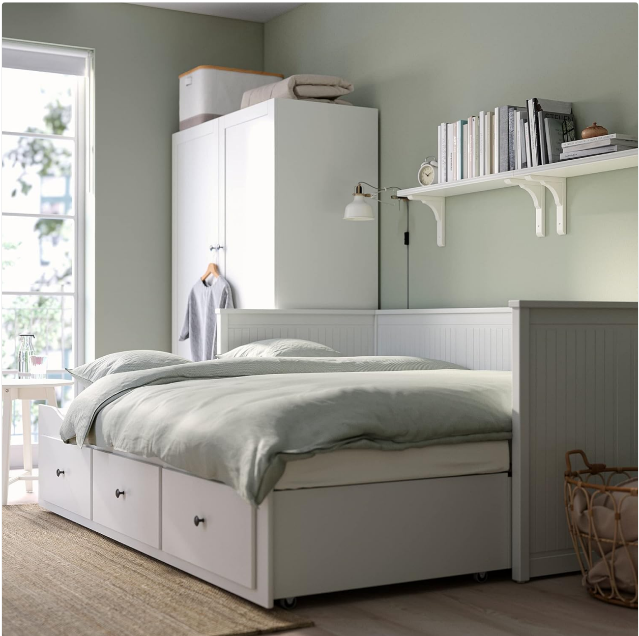
Image 6.1: The HEMNES daybed fully extended, demonstrating its transformation into a spacious double bed, complete with bedding.