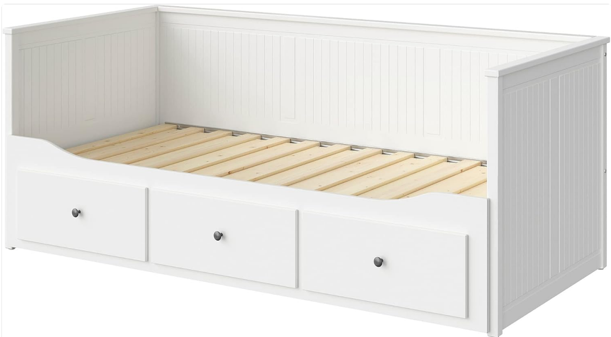
Image 1.1: The IKEA HEMNES daybed frame in white, showcasing its three integrated storage drawers and slatted bed base.

The IKEA HEMNES daybed frame with 3 drawers is a versatile furniture piece designed to function as both a comfortable sofa and a practical bed. It features three integrated drawers for convenient storage, making it ideal for optimizing space in various living environments. This manual provides essential information for assembly, operation, maintenance, and safety to ensure proper use and longevity of your daybed.