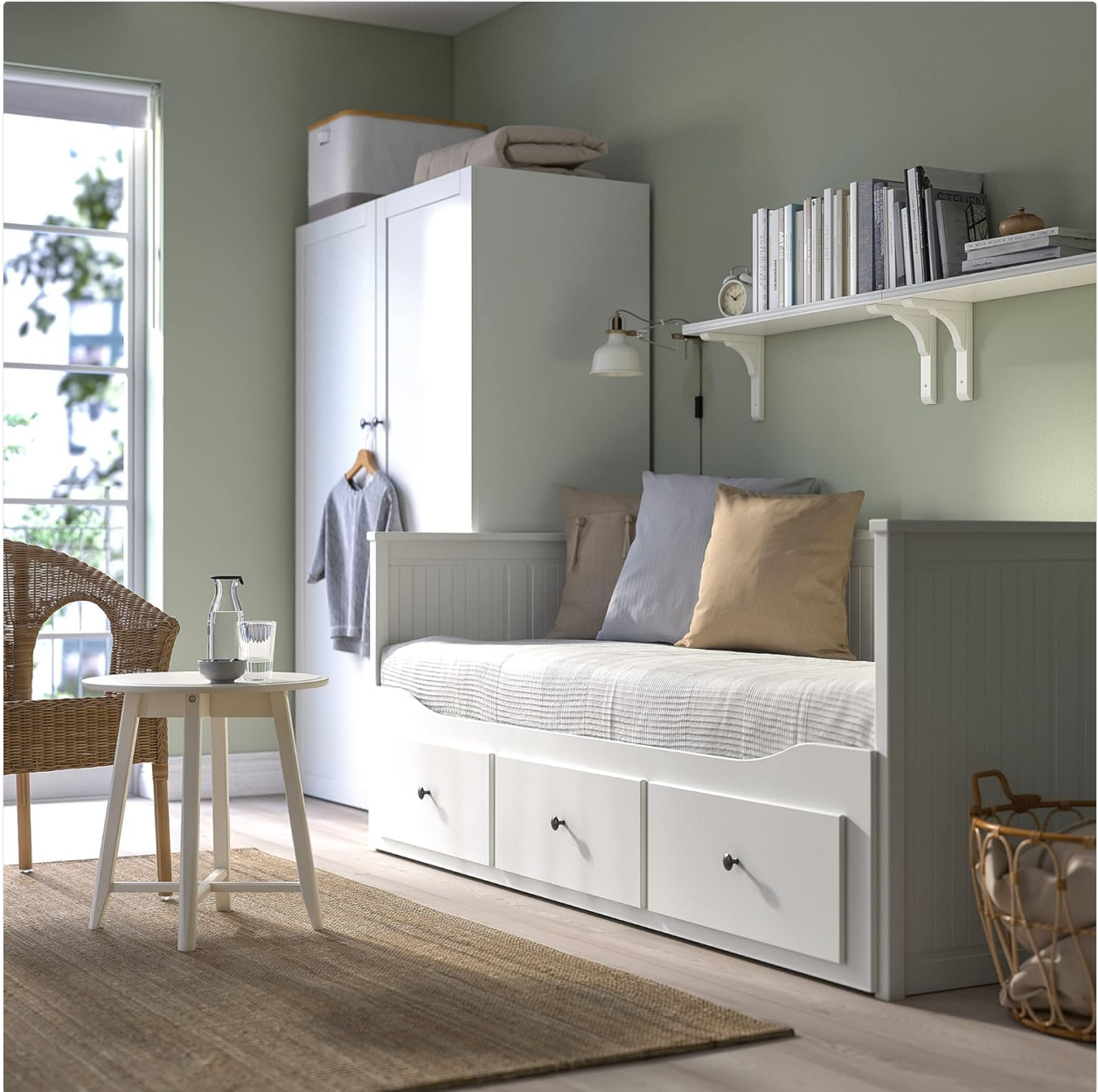
Image 2.1: The HEMNES daybed configured as a sofa, demonstrating its versatility for daytime use with cushions and pillows.