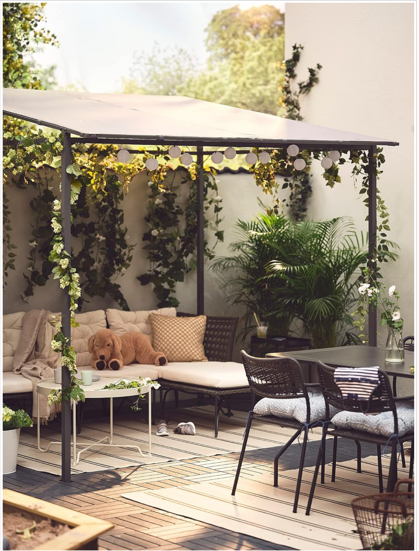
Figure 4: The gazebo providing shade over a patio seating area.