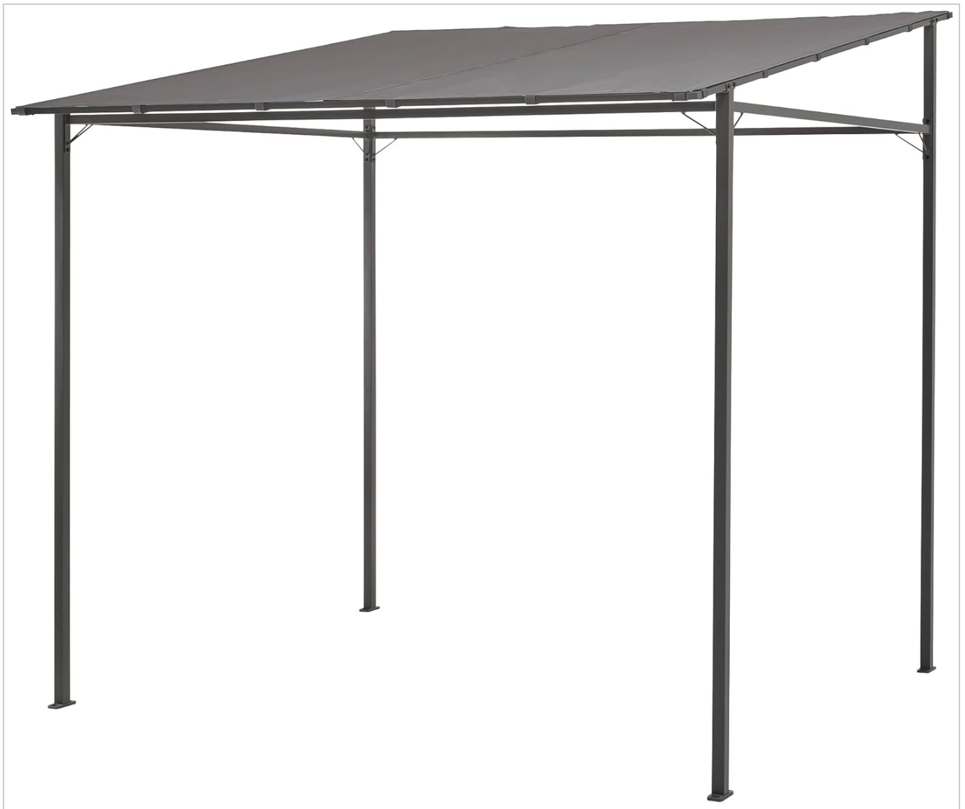
Figure 1: The IKEA GUNNÖN Gazebo in its standard freestanding configuration.