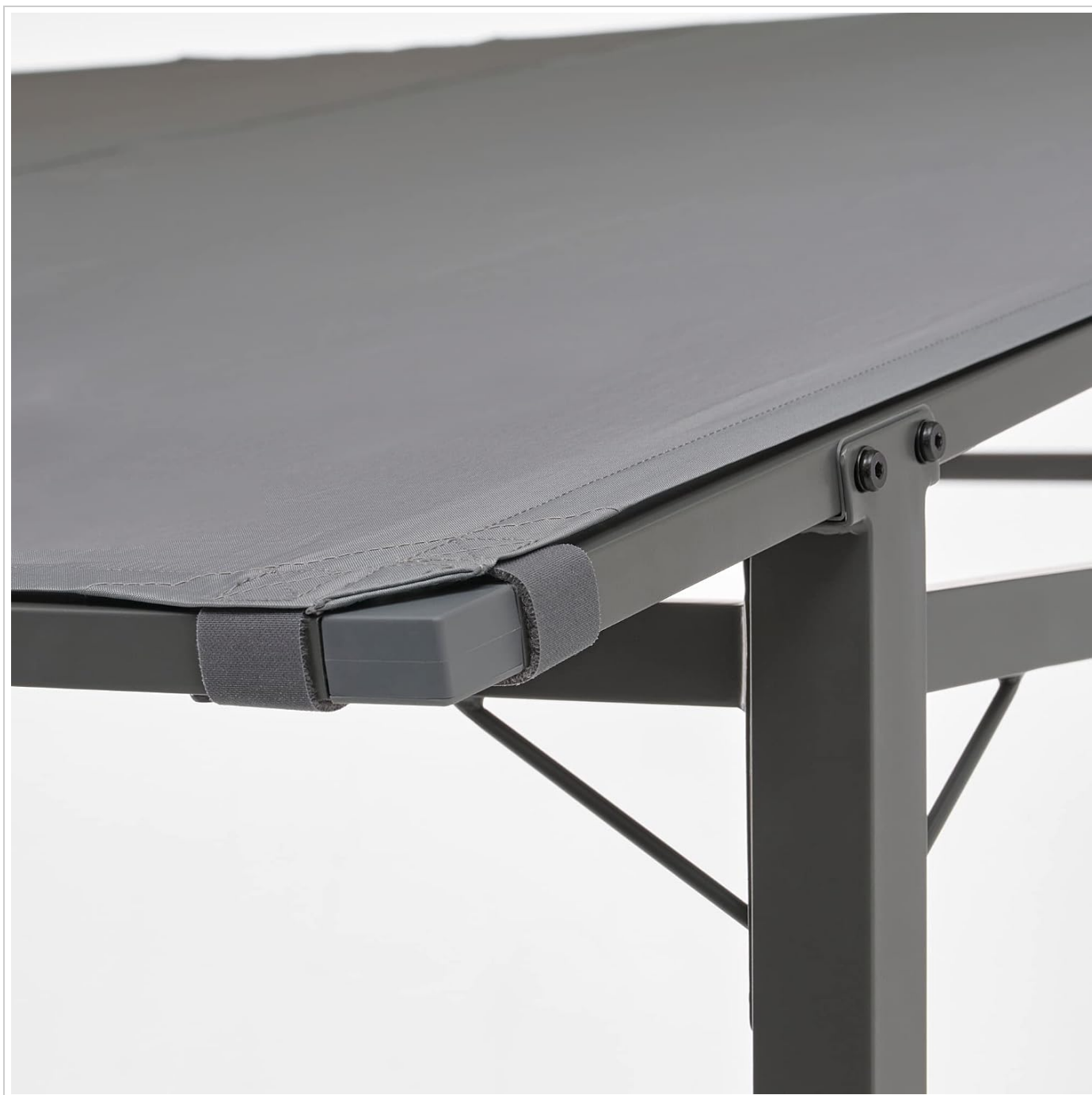
Figure 3: Detail of the canopy corner pocket securely fitted over the frame.