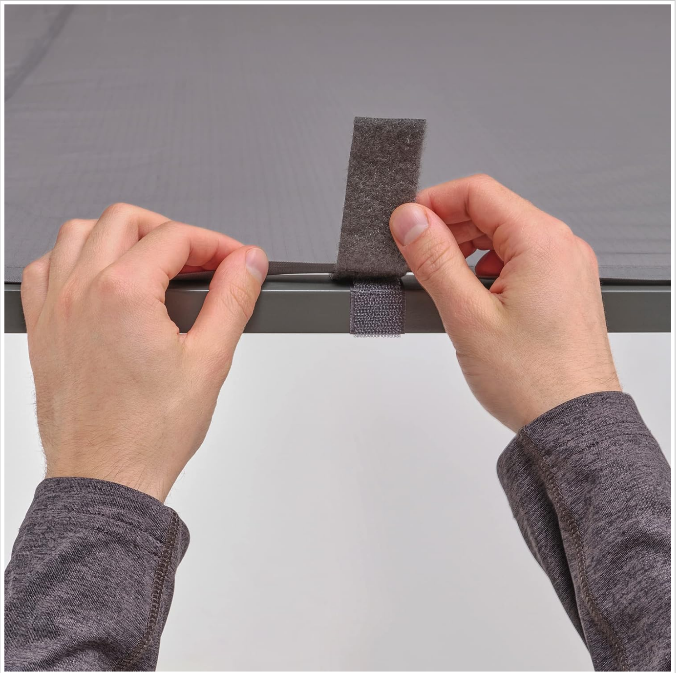
Figure 2: Attaching the canopy fabric to the frame using a velcro strap.