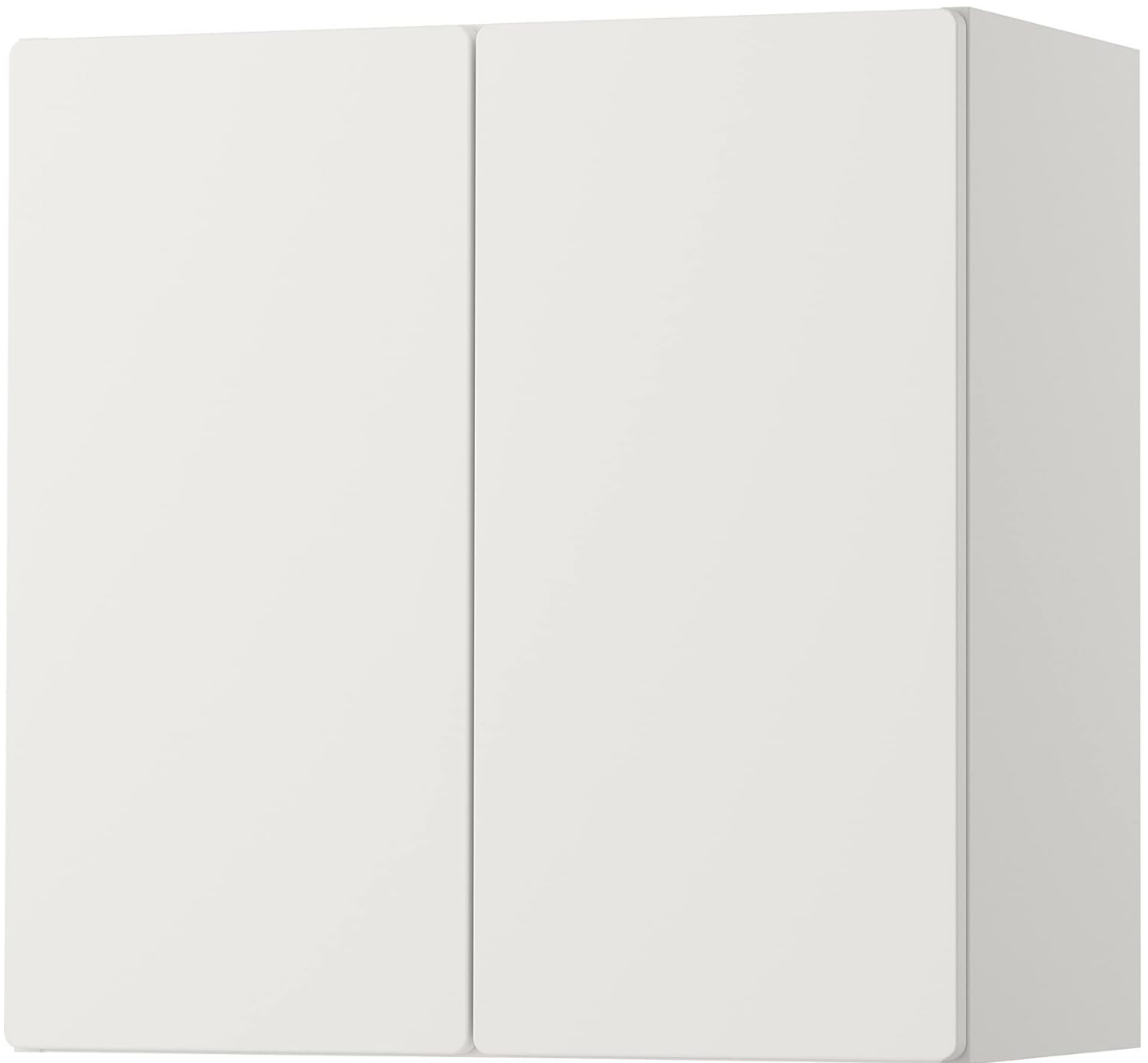
Figure 1: Front view of the IKEA SMÅSTAD Wall Cabinet.