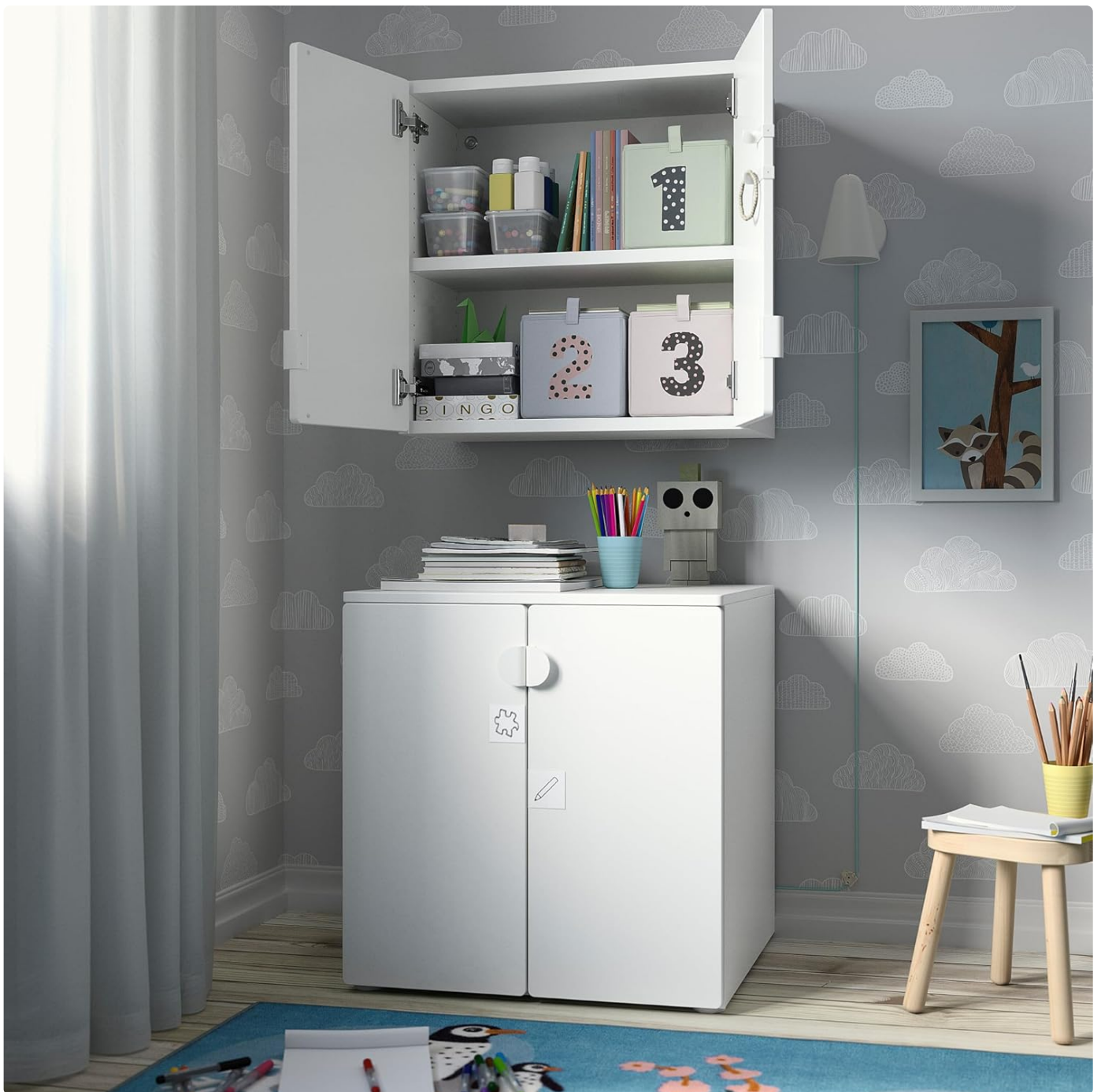
Figure 4: The SMÅSTAD cabinet used for organized storage in a child's room.