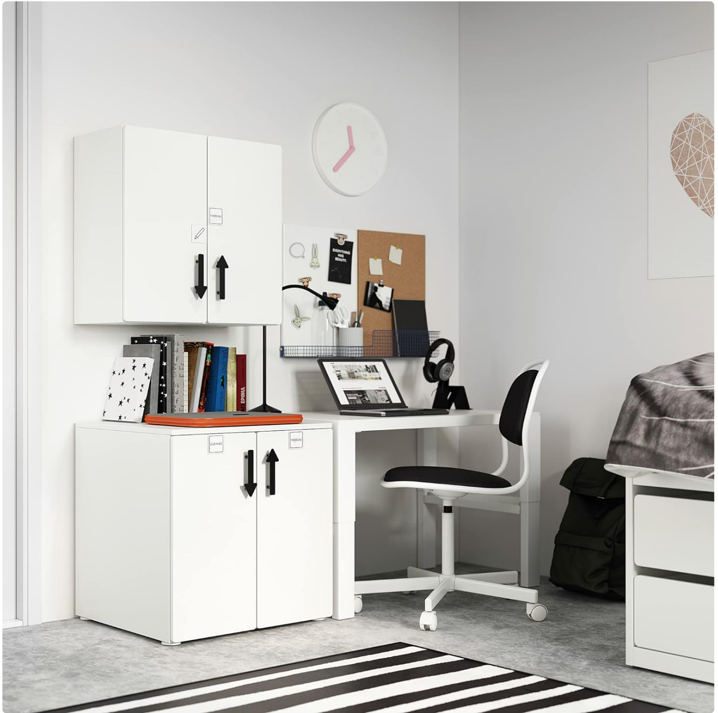
Figure 2: The SMÅSTAD cabinet integrated into a room setup, demonstrating its wall-mounted application.