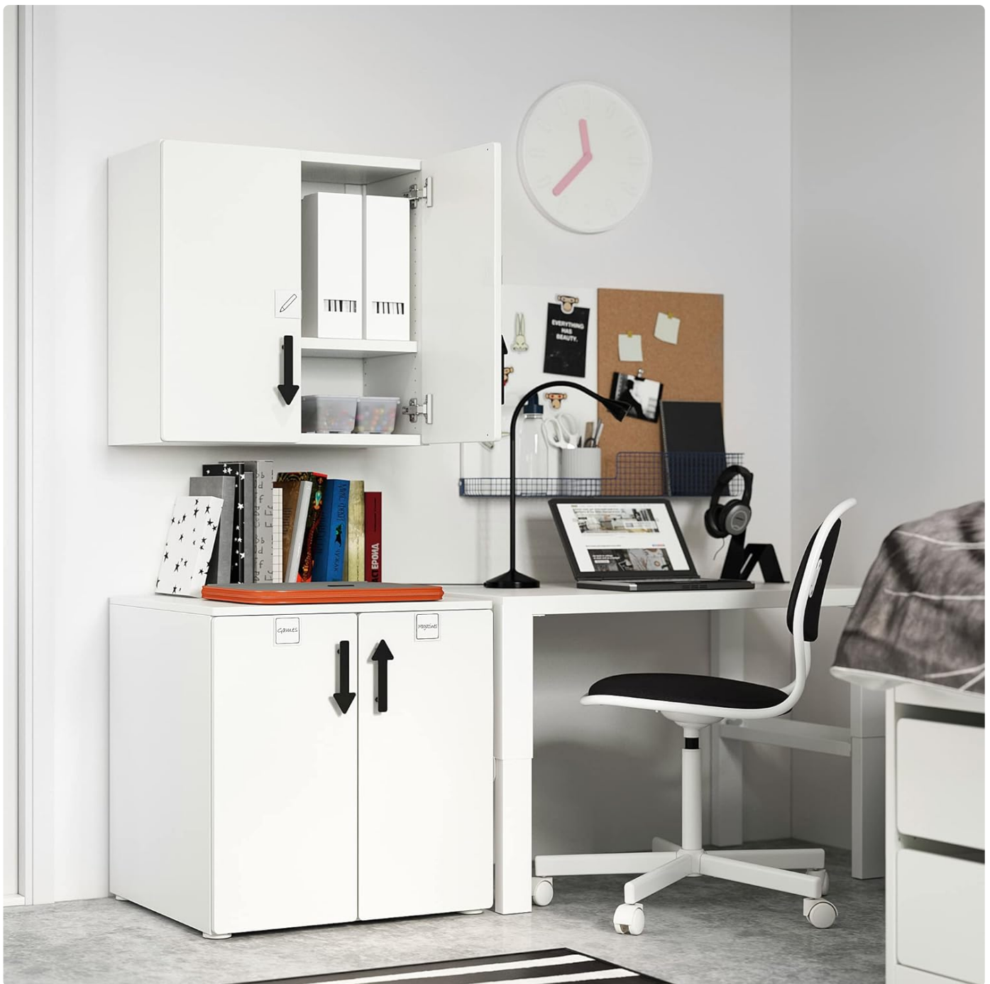
Figure 3: Interior view of the SMÅSTAD cabinet, showcasing its storage capacity.