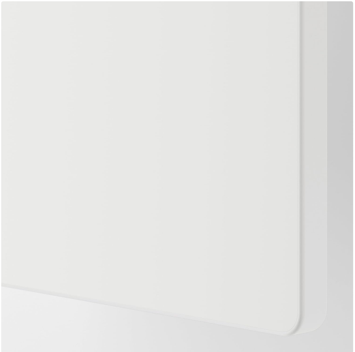
Figure 5: Close-up view of the cabinet's finish, highlighting its smooth surface.