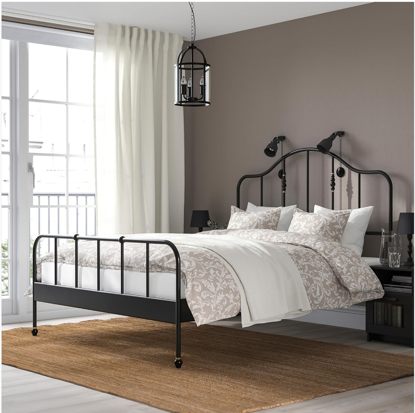
The IKEA SAGSTUA bed frame, showcasing its classic design and sturdy construction, integrated into a modern bedroom setting.