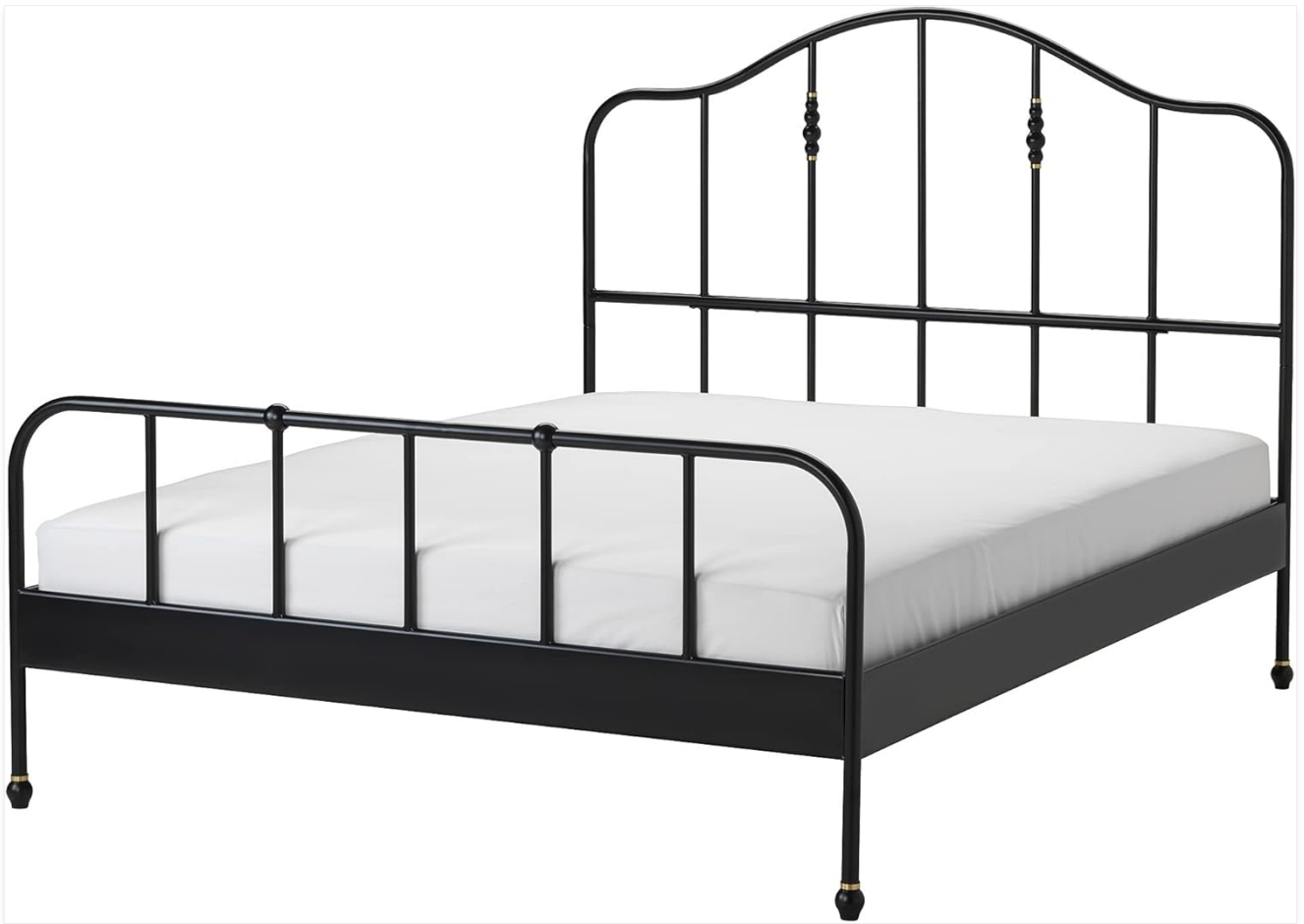
The SAGSTUA bed frame with a mattress in place, demonstrating its intended use.