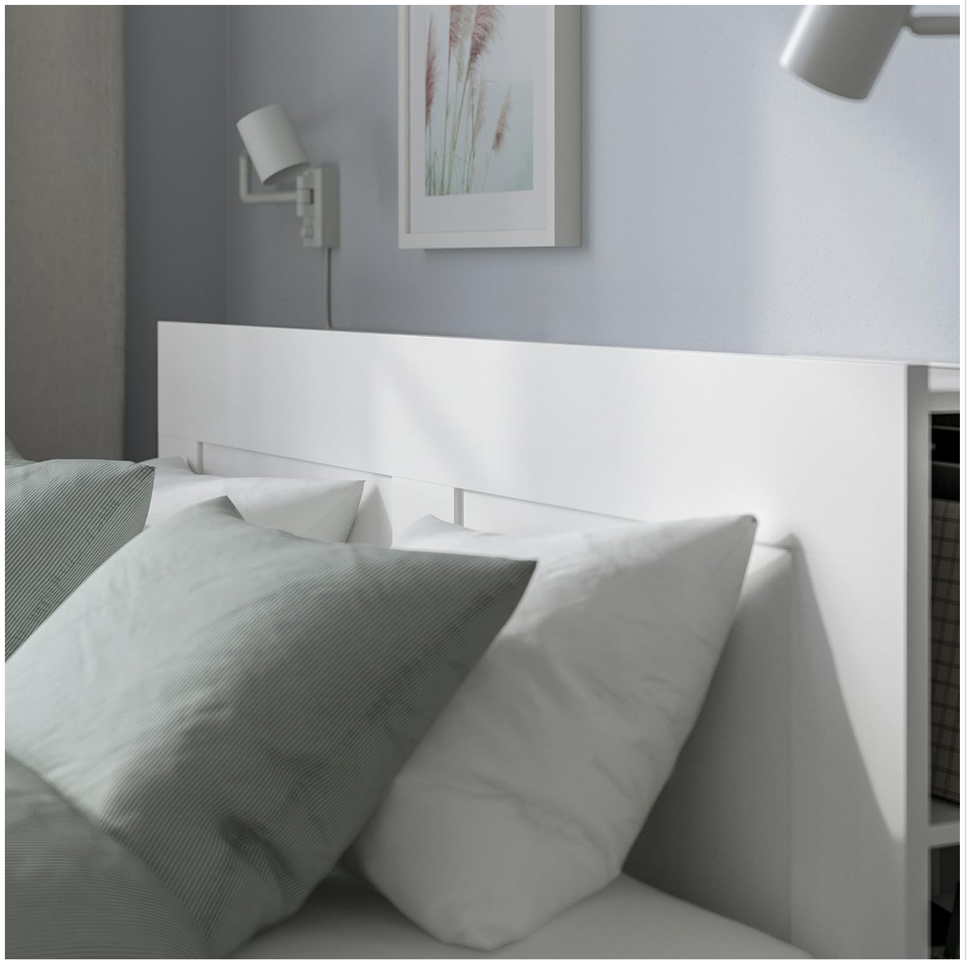
Figure 4: A detailed view of the integrated headboard storage, showing shelves filled with books and small decorative items. This highlights the convenience of having storage within easy reach from the bed.