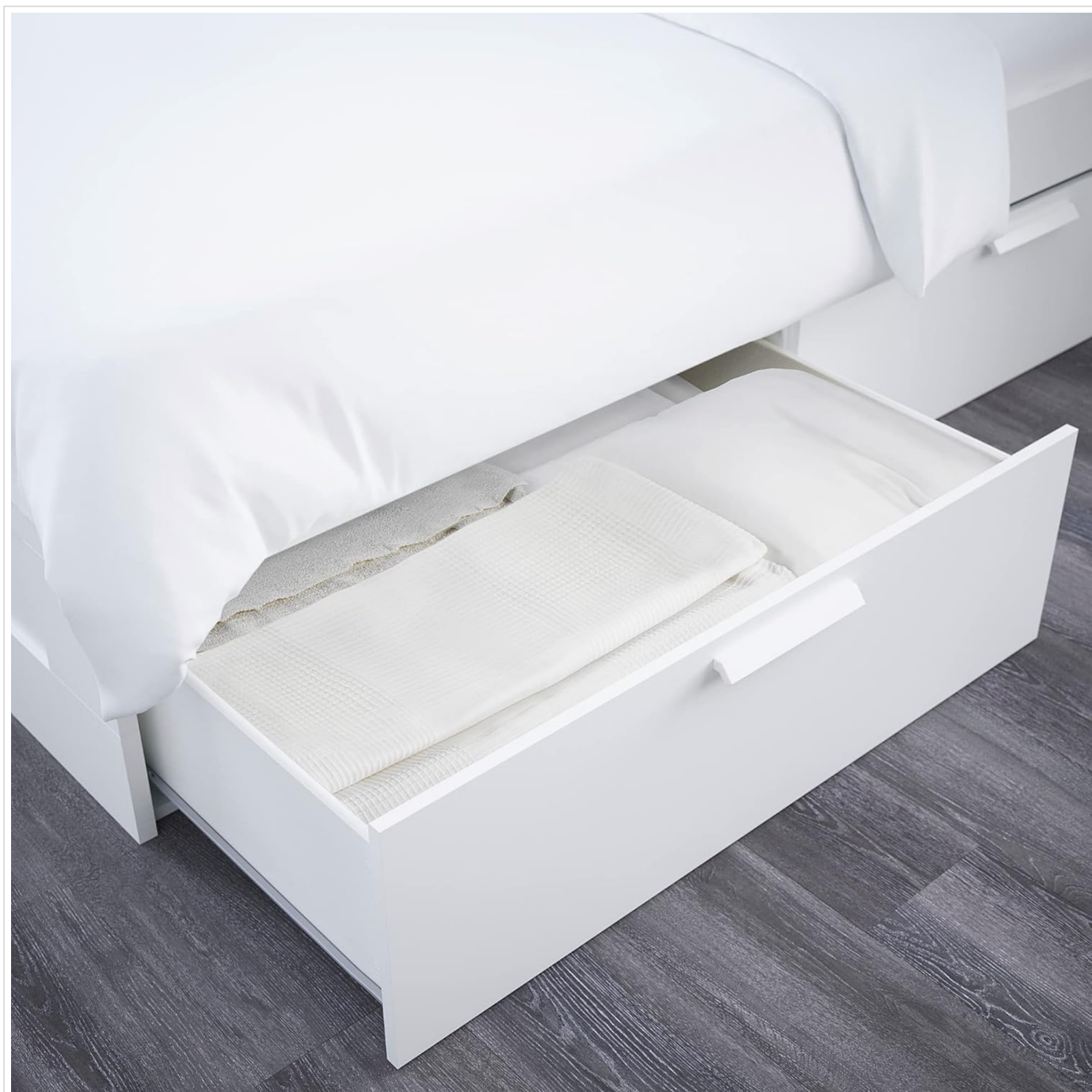
Figure 3: A close-up image of one of the large under-bed drawers pulled out, revealing ample space for storing bedding, blankets, or other bedroom essentials. The drawer is white and matches the bed frame.