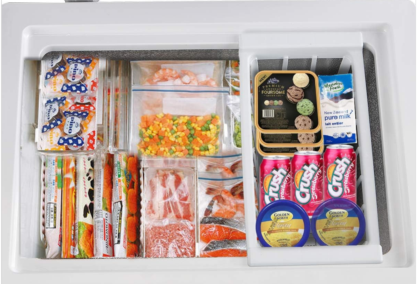
Image: Top-down view of the freezer interior showing various frozen food items neatly organized, with a removable basket on the right holding smaller items like ice cream and canned drinks.

Utilize the removable storage basket for smaller, frequently accessed items to maintain organization and easy access to contents.