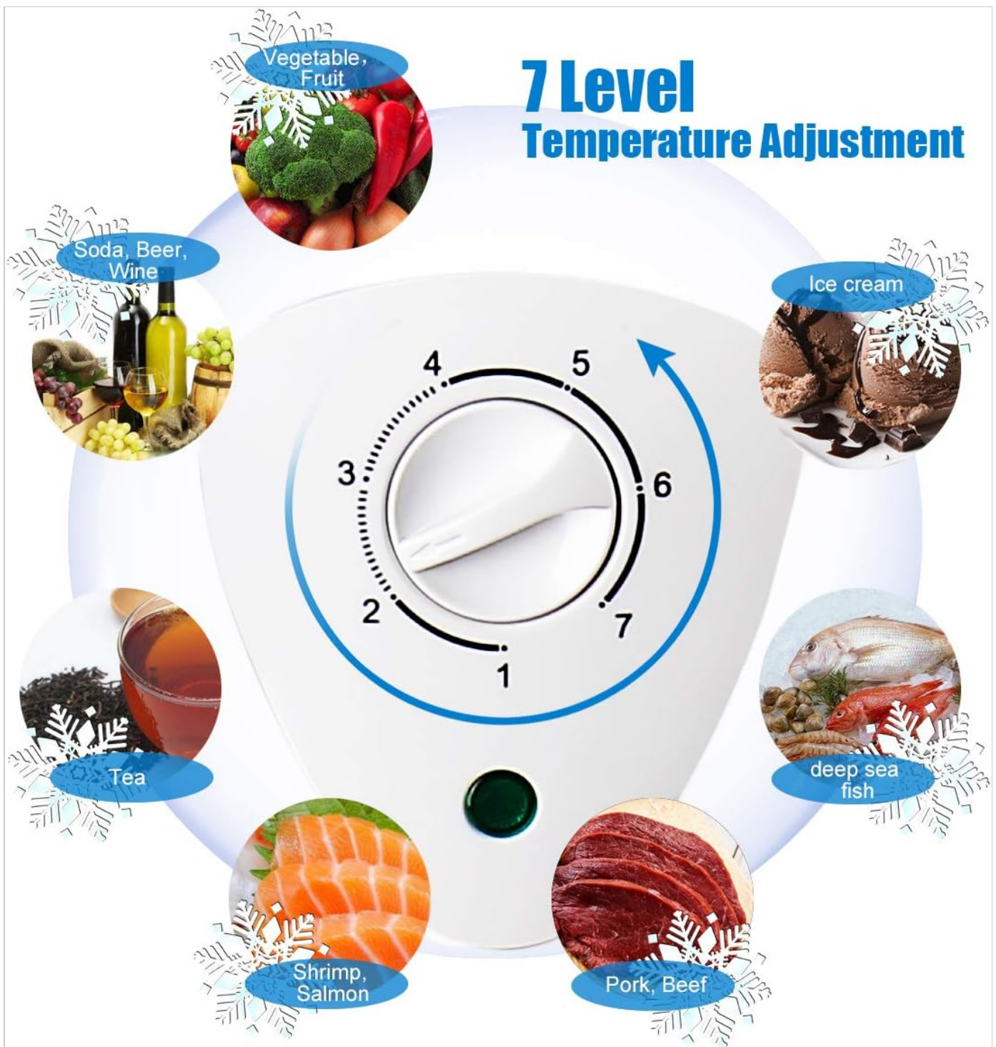
Image: Close-up of the temperature control dial with settings 1 through 7. Surrounding images suggest optimal settings for various items: vegetables/fruit, soda/beer/wine, tea (refrigeration), ice cream, deep sea fish, shrimp/salmon, pork/beef (freezing).