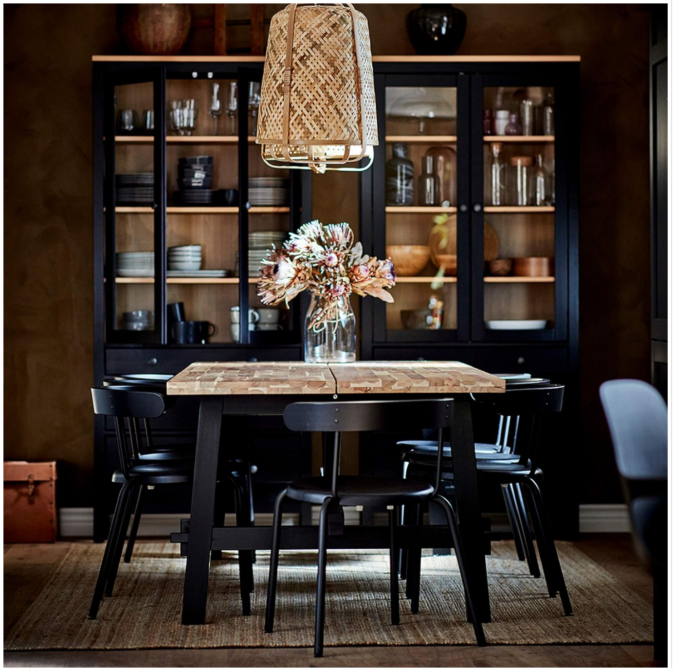
Image: The SKOGSTA Dining Table with black chairs, demonstrating its use in a dining setting.