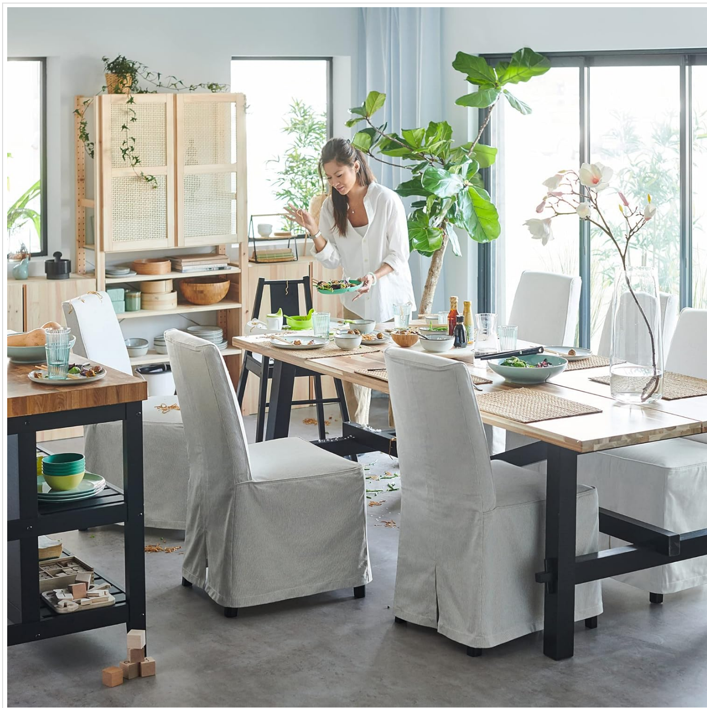
Image: The IKEA SKOGSTA Dining Table, showcasing its natural wood top and dark legs, set up in a dining area.