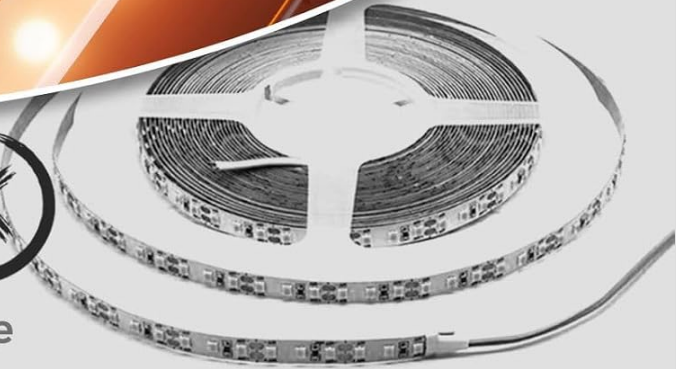
Image: Detailed view of the durable LED light strip and its components.

Others: Soft Light Strip Short life span and vulnerable