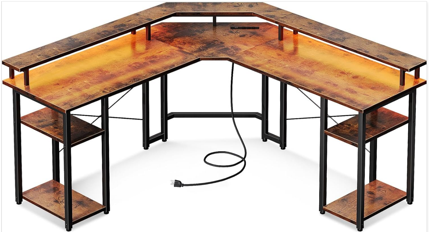
Image: The Coleshome L Shaped Gaming Desk, showcasing its overall structure and integrated power cord.

This manual provides comprehensive instructions for the assembly, operation, and maintenance of your Coleshome L Shaped Gaming Desk. Designed for both gaming and home office environments, this desk offers ample space, integrated power solutions, and customizable LED lighting to enhance your workspace.