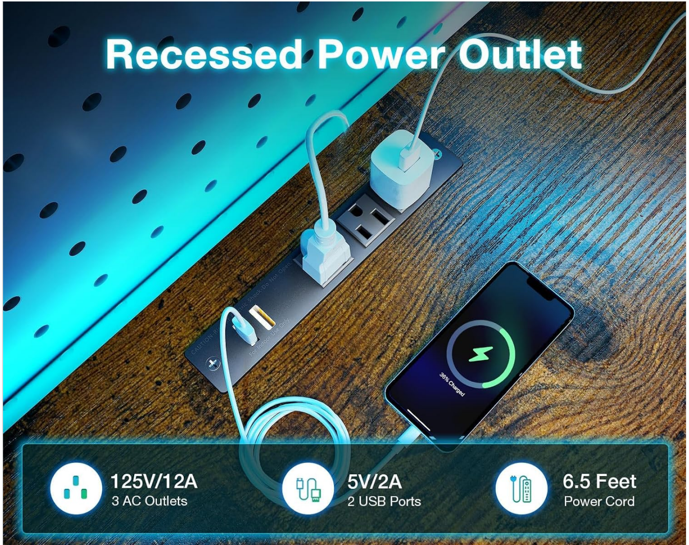
Image: Close-up of the recessed power outlet with 3 AC outlets and 2 USB ports.