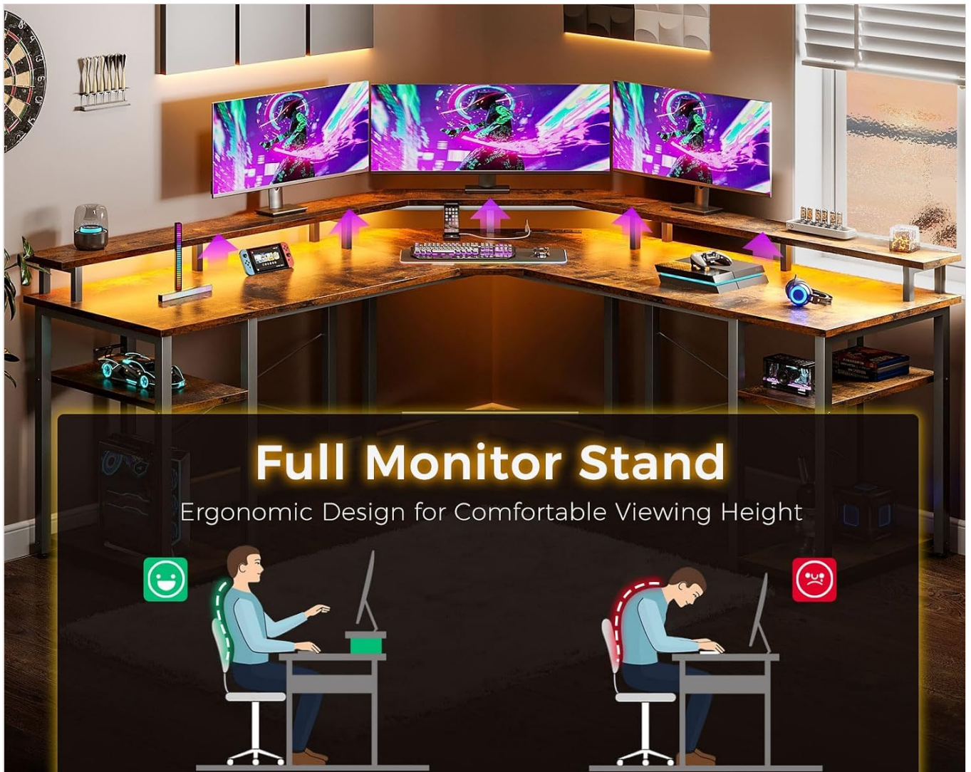
Image: The desk featuring its full monitor stand for elevated display.