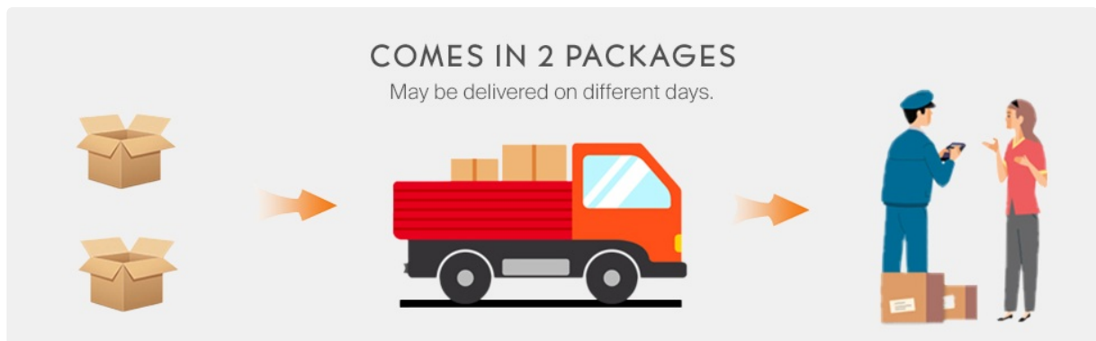
Figure 2.1: The fireplace system is delivered in two separate packages.