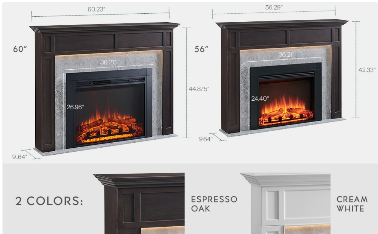
Figure 3.4: Dimensional comparison of 60-inch and 56-inch models.