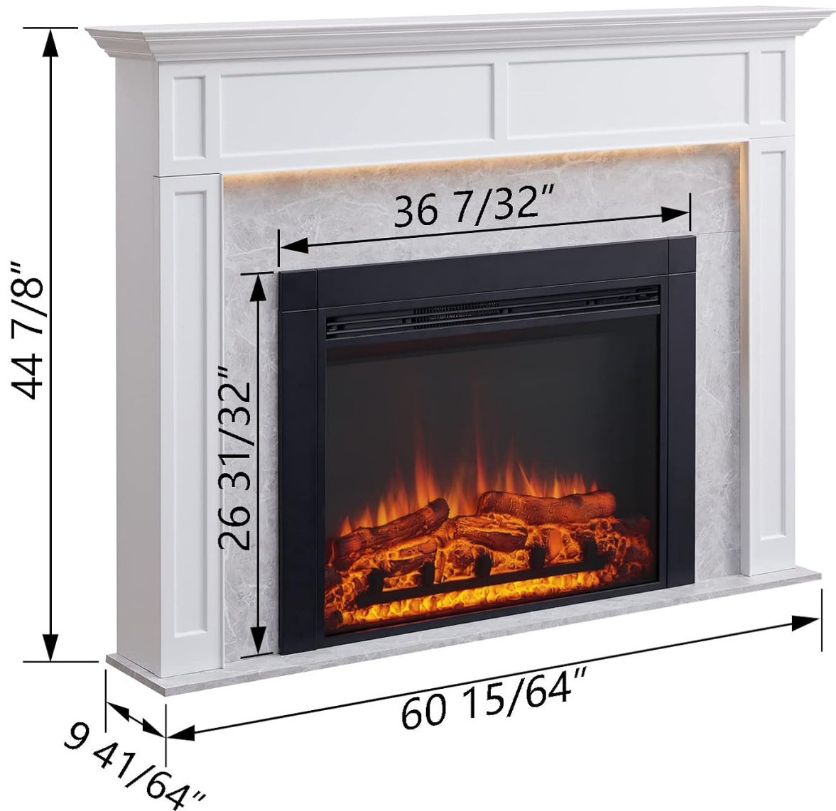
Figure 3.3: Detailed dimensions of the 60-inch mantel and 36-inch insert.