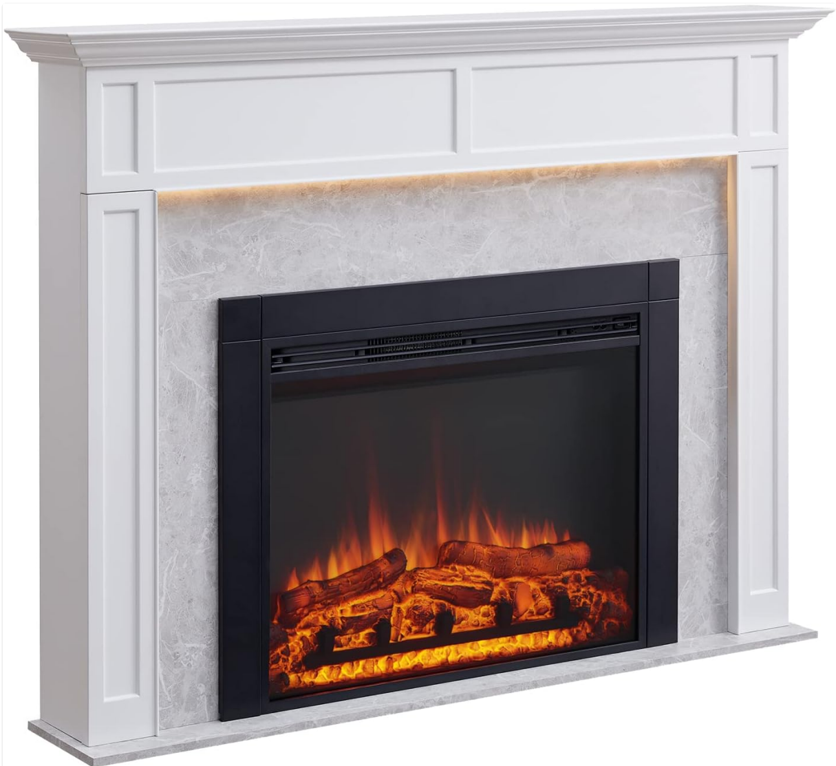
Figure 0.1: LegendFlame Ashley Electric Fireplace with Jaden Insert.