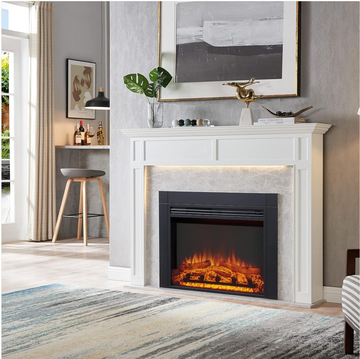
Figure 3.1: The assembled LegendFlame Ashley Electric Fireplace in a room.