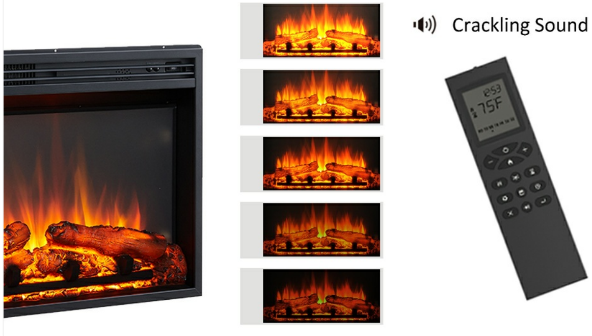
Figure 4.4: LED flame effect and quiet fan operation for heating.