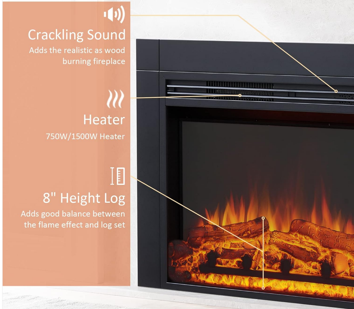
Figure 3.2: Detailed view of the mantel's design and features.