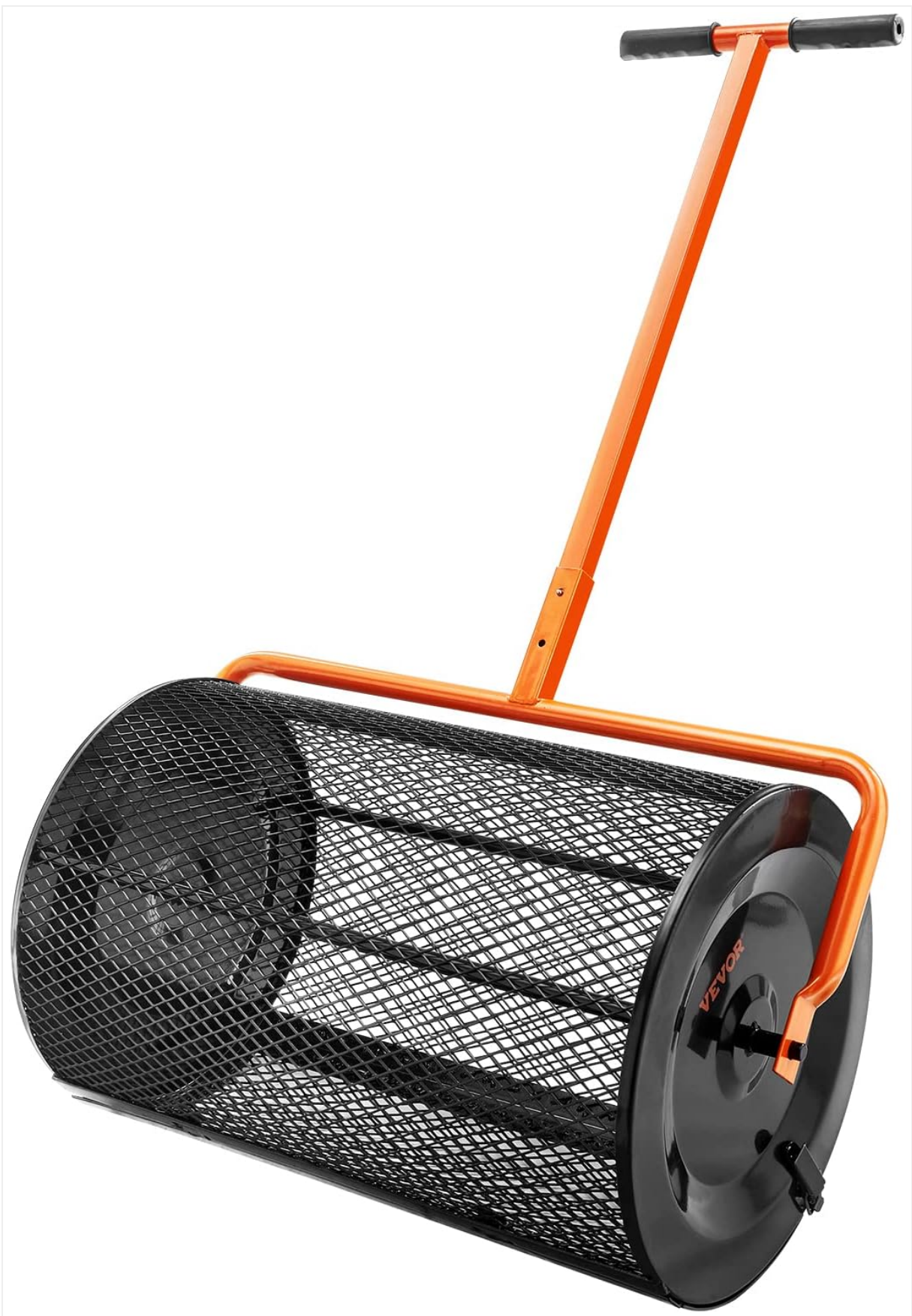
Image: The VEVOR Compost Spreader, featuring a black mesh drum and an orange handle.