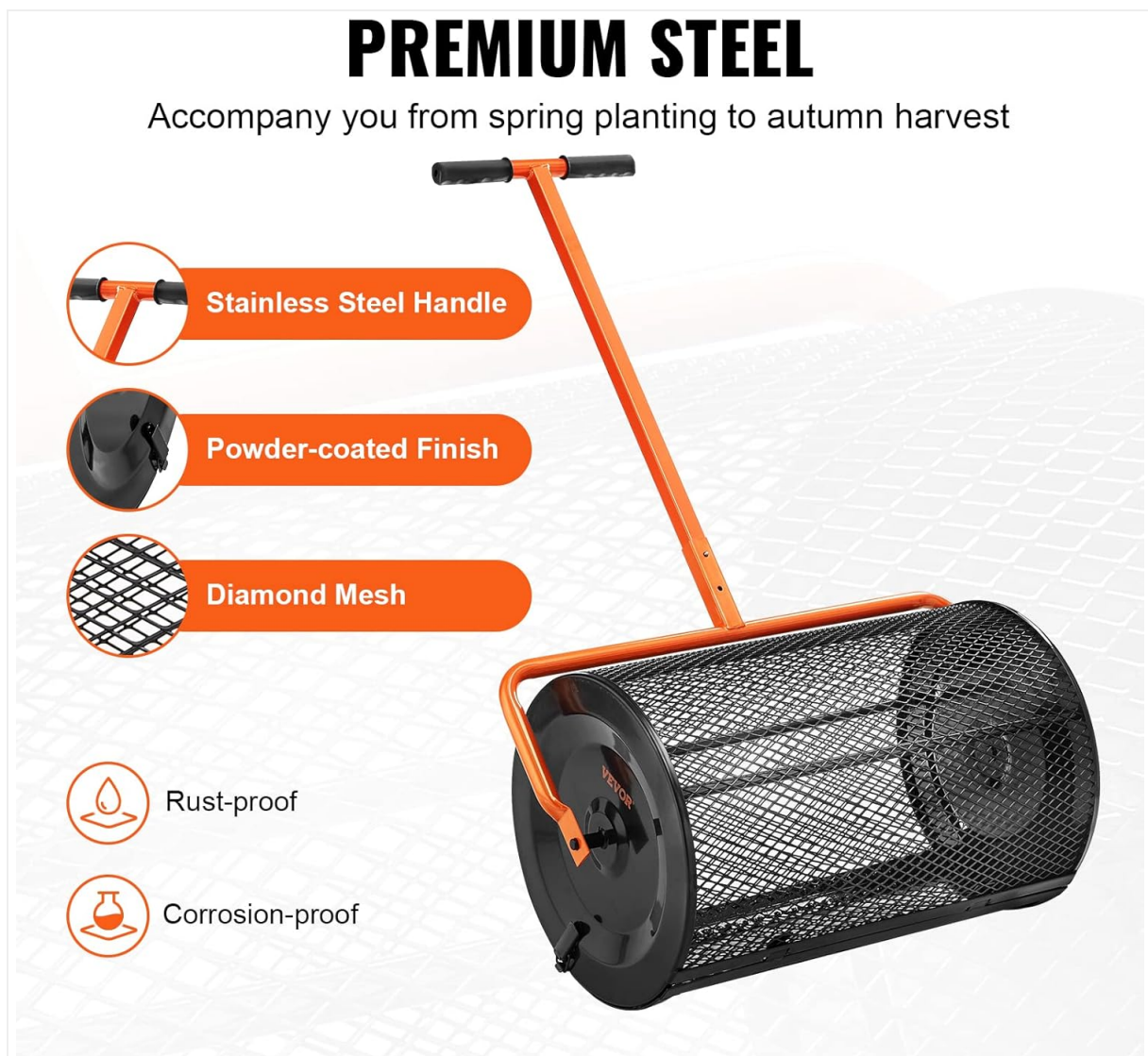
Image: Detailed view highlighting the stainless steel handle, powder-coated finish, and diamond mesh construction of the spreader.