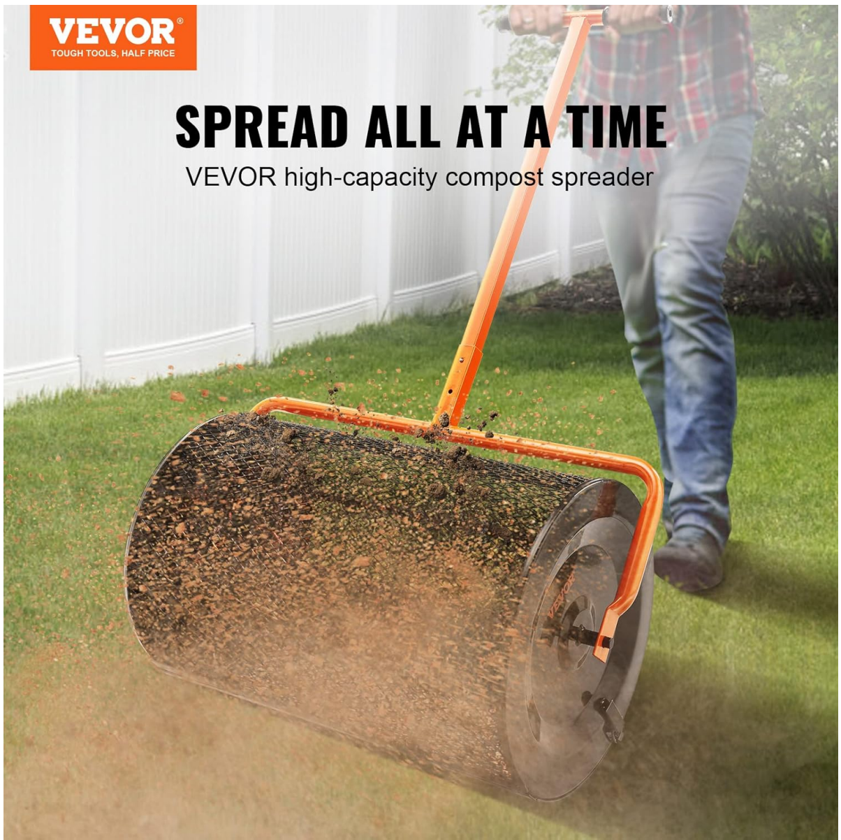
Image: The VEVOR Compost Spreader being used to spread material across a lawn, demonstrating even coverage.