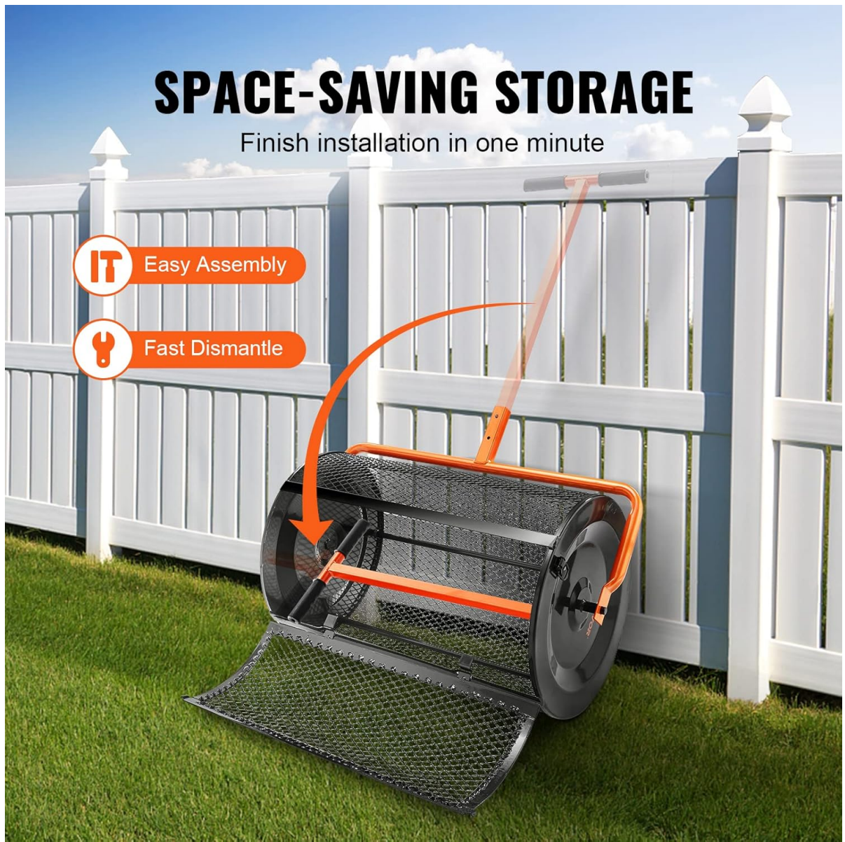
Image: The spreader demonstrating its easy assembly and fast dismantle features for convenient storage.