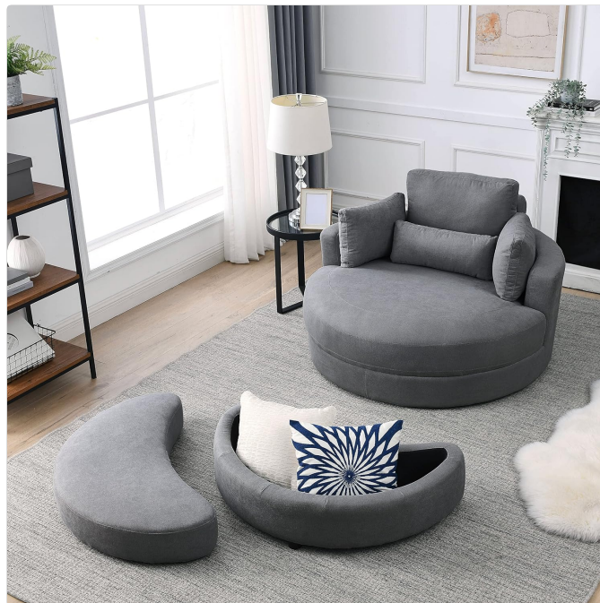
Image 1: The HomSof Swivel Accent Barrel Chair with its crescent-shaped storage ottoman, shown in a living room setting. The chair is dark grey and includes several pillows for comfort.