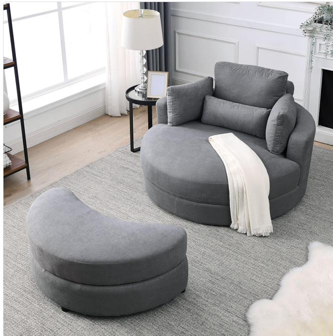
Image 2: The HomSof Swivel Accent Barrel Chair and its crescent-shaped storage ottoman displayed separately, highlighting their individual forms and the chair's spacious design.