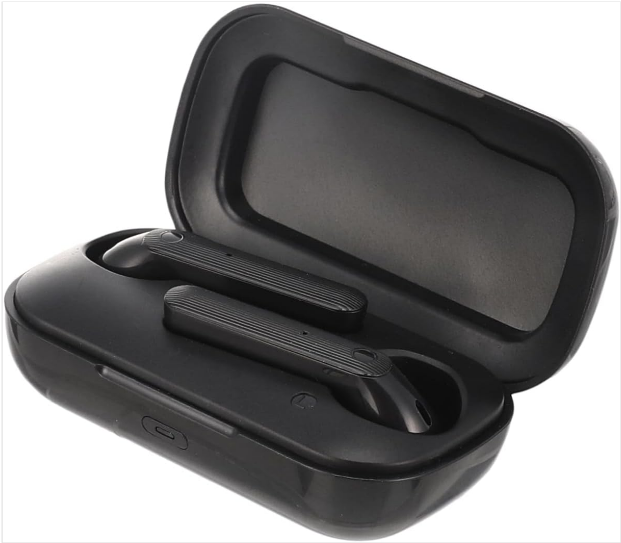
Image: The REMAX TWS-18 True Wireless Stereo Earbuds resting inside their open charging case. The earbuds are black with a sleek, in-ear design, and the charging case is also black, indicating its open state.