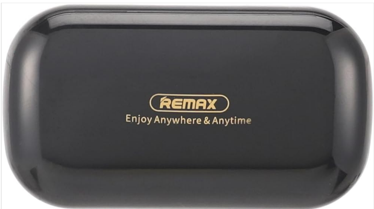
Image: The closed charging case for the REMAX TWS-18 earbuds, featuring the "REMAX" logo and the slogan "Enjoy Anywhere & Anytime" in gold lettering on its black surface.