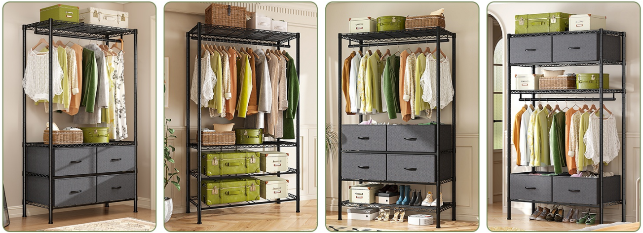
Image: Illustration of customizable storage space, showing how shelves can be adjusted to create different hanging and drawer areas.