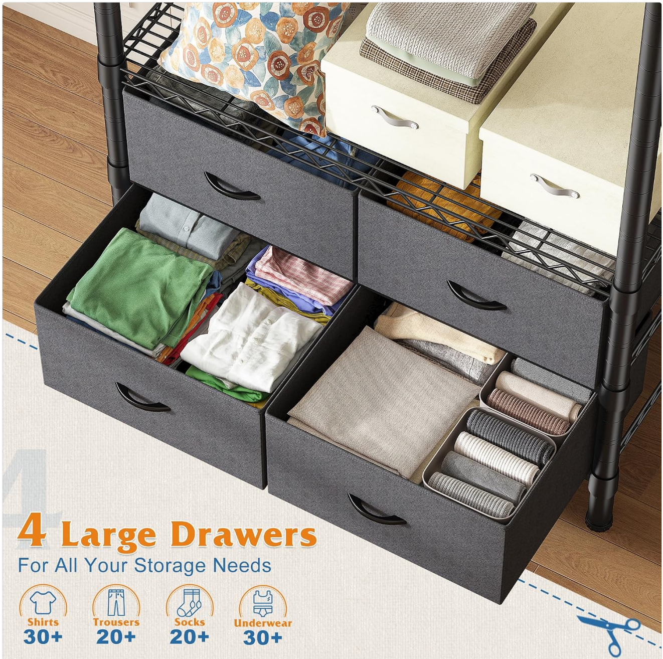
Image: Close-up view of the four large drawers, illustrating their capacity for organizing shirts, trousers, socks, and underwear.