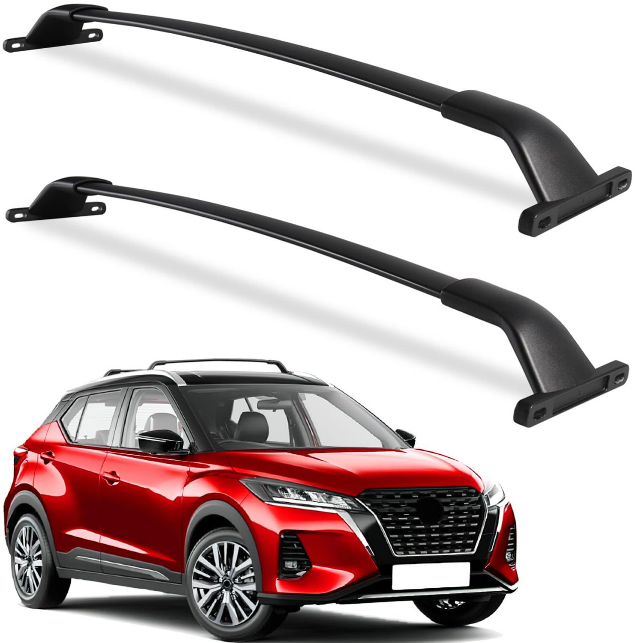
Image: Wonderdriver Heavy Duty Roof Rack Cross Bars installed on a red Nissan Kicks.