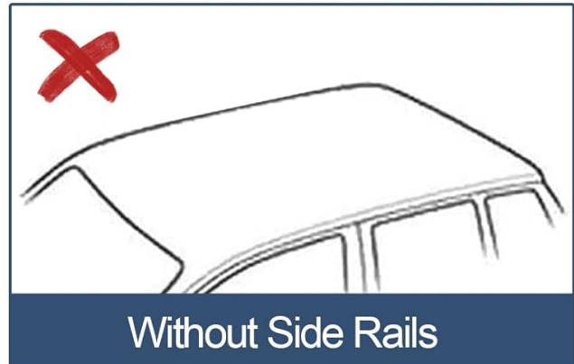
Image: Visual guide illustrating vehicle compatibility with flush roof rails.