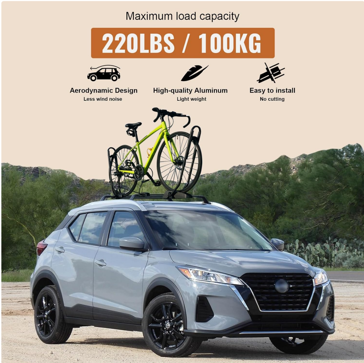
Image: Nissan Kicks with a bicycle mounted on the roof rack, highlighting the 220lb load capacity.