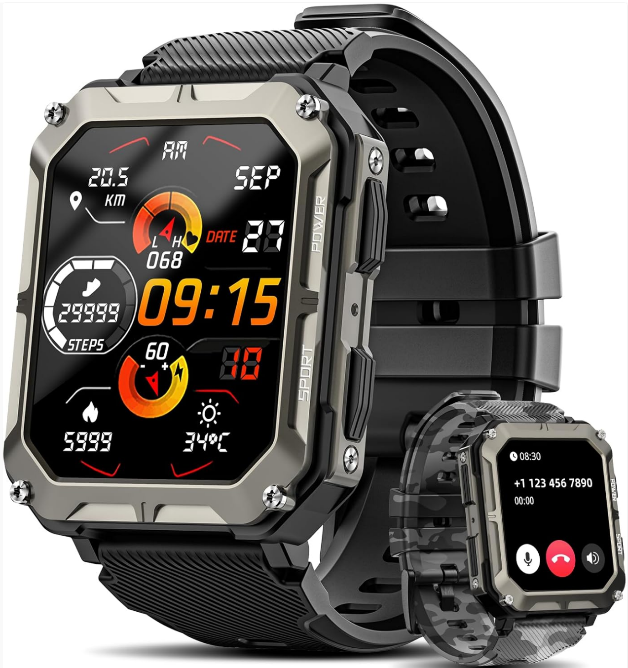
Image: The Rgthuhu Military Smart Watch, showcasing its robust design and digital display.