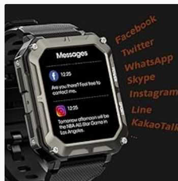
Image: The smartwatch screen showing message notifications from Facebook and Instagram, with icons for other social media apps.