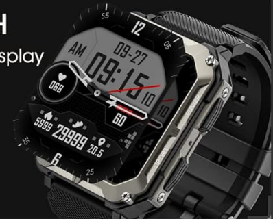
Image: A collage showing various smartwatch features: stopwatch, remote camera shutter, voice control, and details about the 380mAh battery and 1.9-inch HD LCD display.