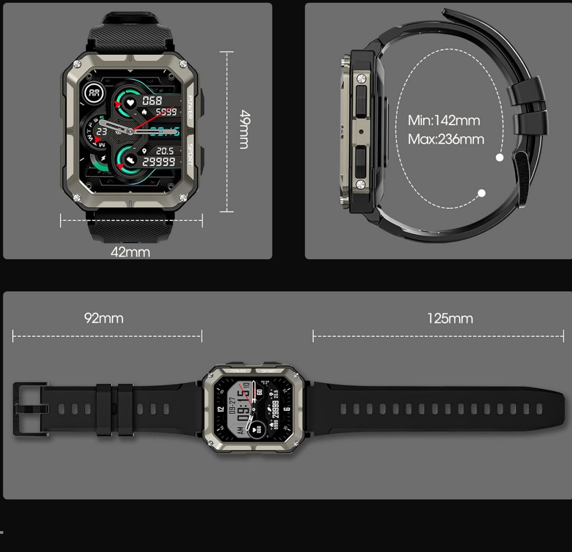
Image: Detailed product dimensions, including watch face width (42mm), height (49mm), and band length (min 142mm, max 236mm).