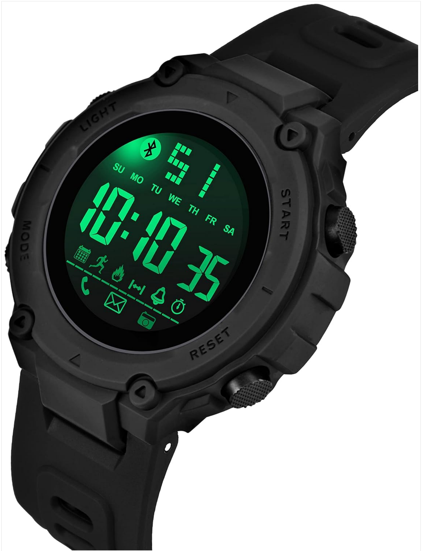
Figure 3.1: Side view illustrating the 'LIGHT' button and the watch's green illuminated display.