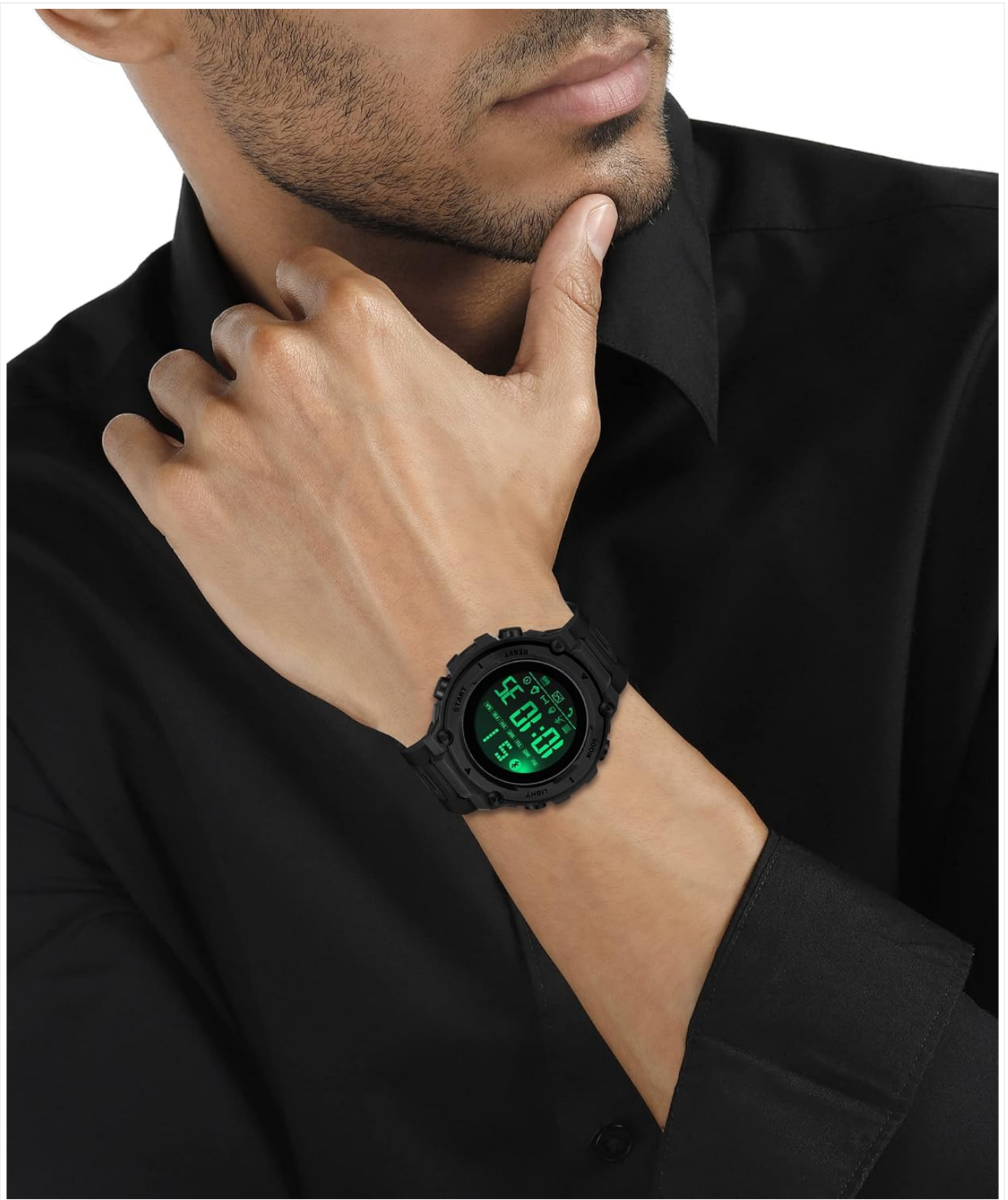
Figure 2.1: The watch comfortably worn on a wrist, displaying the illuminated green LED screen.