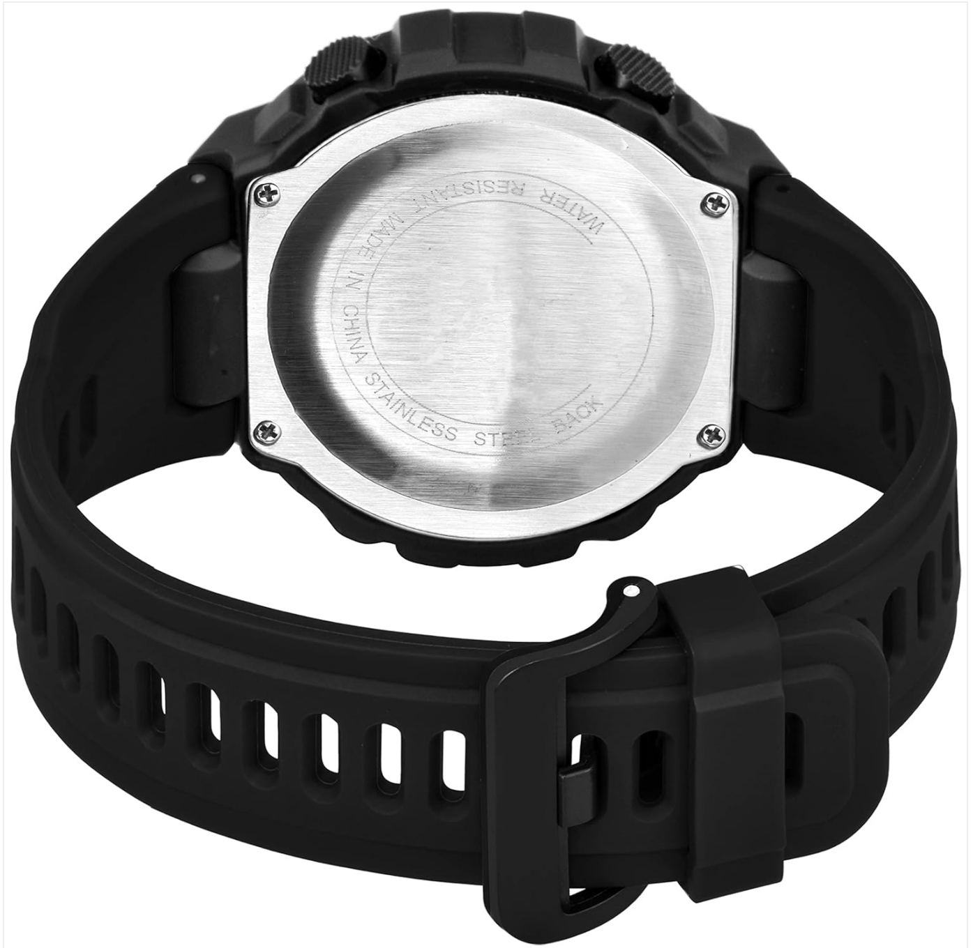
Figure 4.1: Rear view of the watch, indicating its water resistance.

The watch is marked as 'WATER RESISTANT' on its back plate. This typically means it can withstand splashes or brief immersion in water, such as during hand washing or light rain. It is not suitable for swimming, diving, or prolonged water exposure. Avoid operating buttons when the watch is wet.