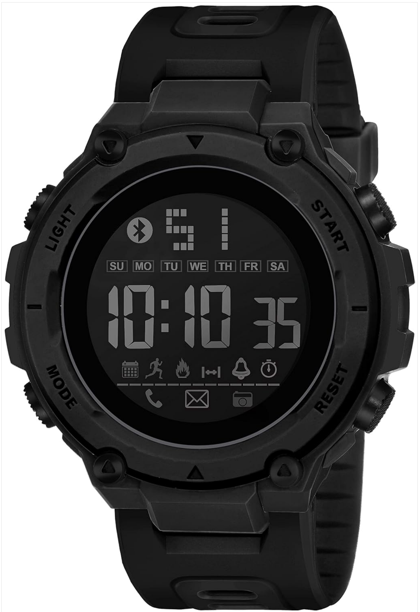
Figure 1.1: Front view of the Shockshop Digital Sports Watch, showcasing its black dial and clear digital LED display.