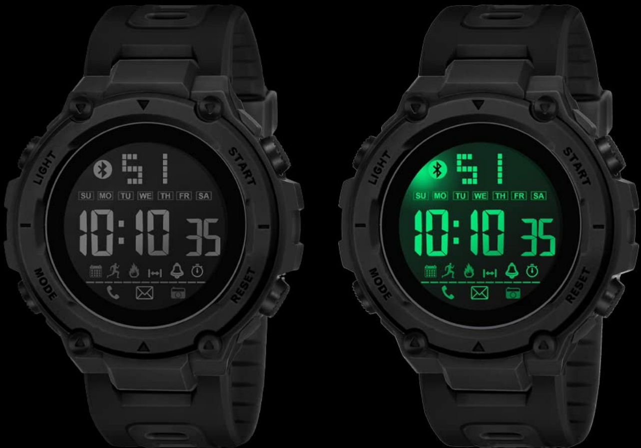
Normal Display Mode