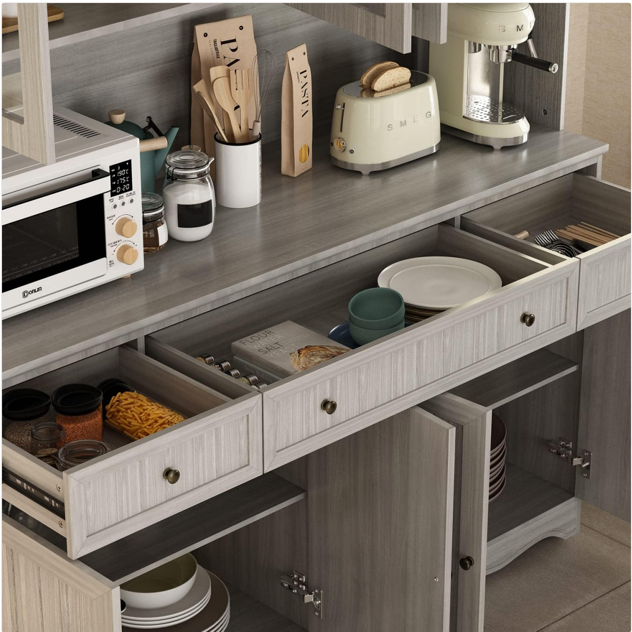
Image 6.2: A detailed view of the cabinet's drawers and lower solid doors, illustrating their capacity for organized storage of various kitchen essentials.