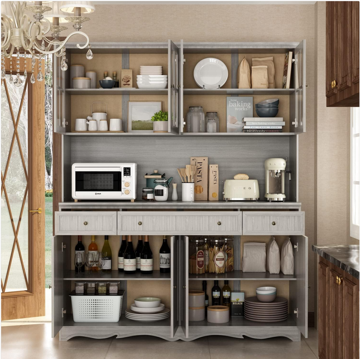
Image 3.2: Interior view of the cabinet, demonstrating its capacity for storing various kitchen items behind glass and solid doors, and within drawers.