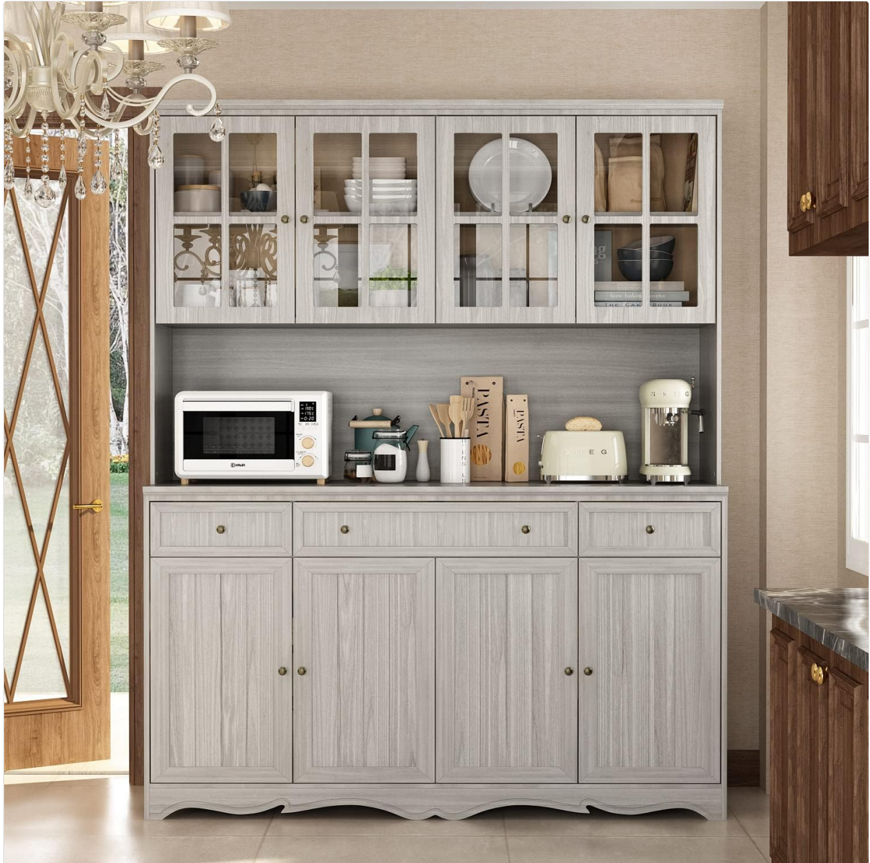
Image 3.1: The FUFU&GAGA KF390030 Tall Kitchen Pantry Cabinet, showcasing its overall design and integration into a kitchen environment.

The FUFU&GAGA KF390030 cabinet is a versatile storage solution featuring a multi-tiered design. It includes an upper section with glass doors, a central platform suitable for appliances, a drawer section, and a lower cabinet with solid doors.