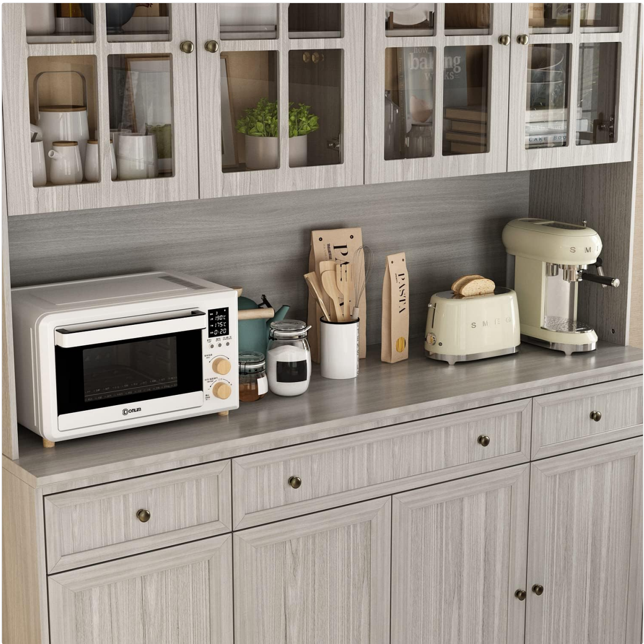
Image 6.1: A close-up view of the cabinet's central platform, demonstrating its use as a microwave stand and space for other small kitchen appliances like a toaster and coffee maker.