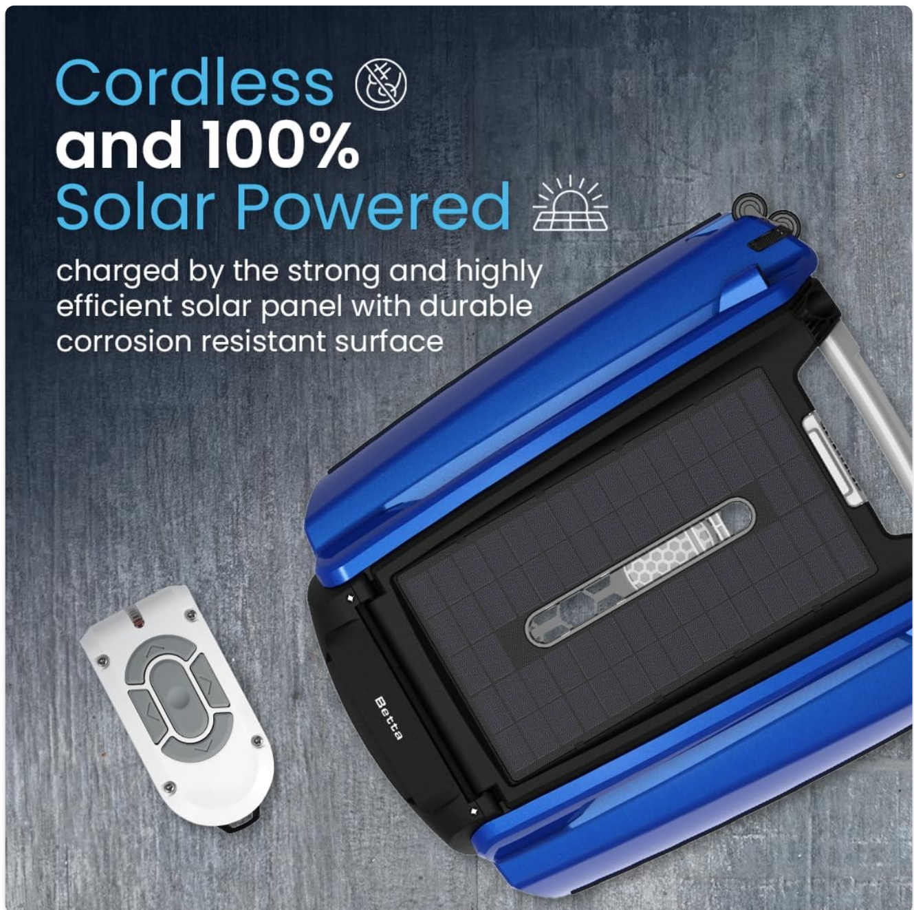
Figure 2: The Betta SE is 100% solar powered and cordless.