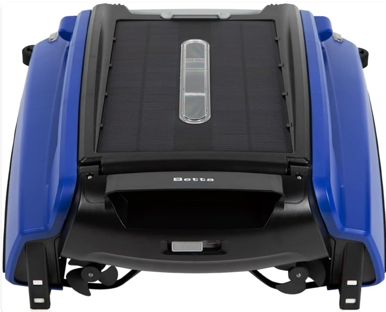
Figure 1: The Betta SE Robotic Pool Skimmer.