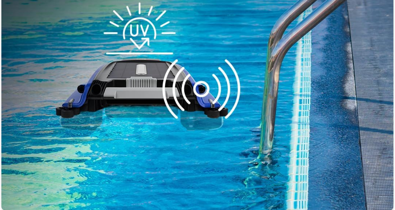
Figure 4: Ultrasonic radar sensors help the Betta SE detect and avoid obstacles.

Detect obstacles and guide Betta to efficiently clean your entire pool with the special UV resistant coating and material.