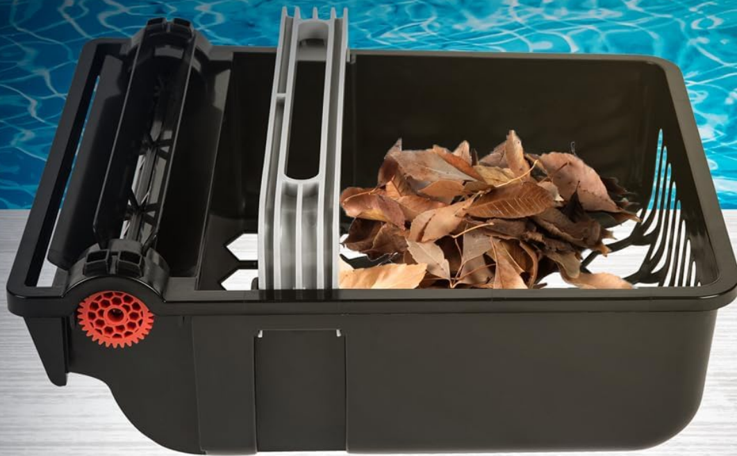
Figure 5: The large debris basket is easy to access and clean.

Simply dock it, open the cover and empty the debris basket