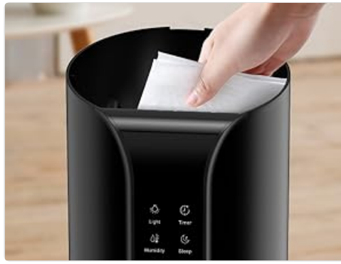
Image: A hand is shown pulling out the essential oil tray from the back of the humidifier and adding drops of essential oil onto the pad.