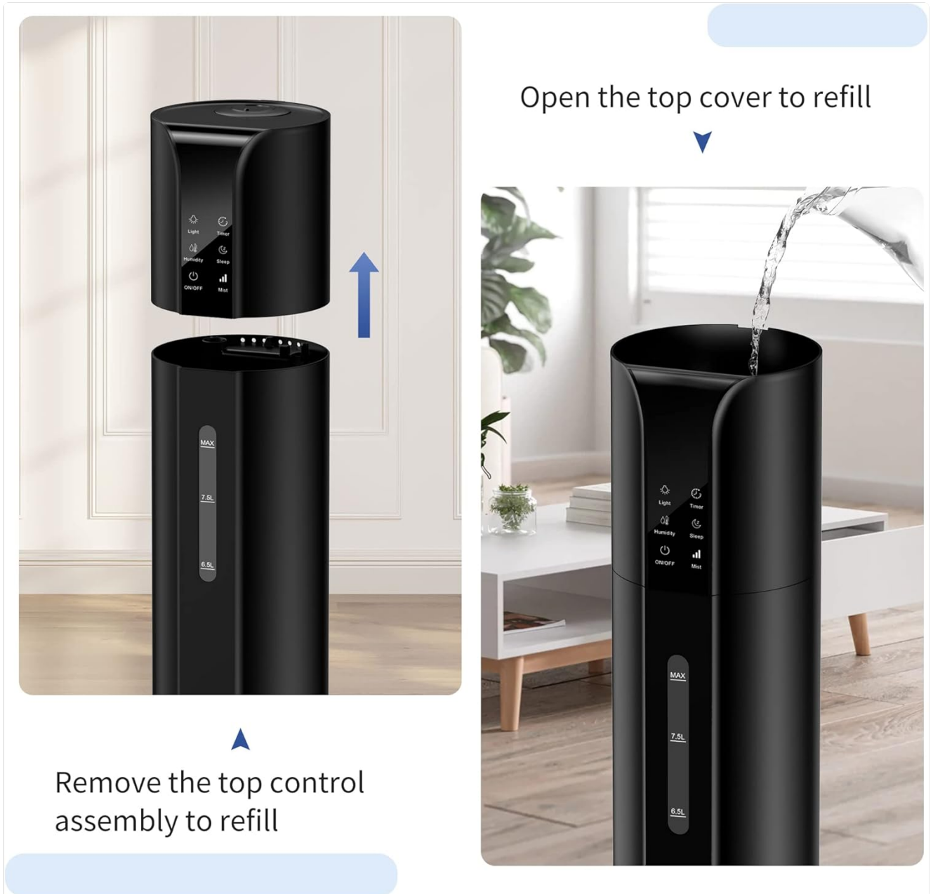
Image: A visual guide demonstrating how to refill the humidifier. It shows the top cover being removed and water being poured directly into the open water tank.