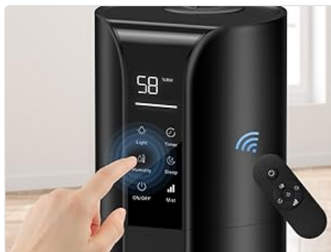
Image: A close-up view of the humidifier's digital control panel, showing the various touch buttons for light, timer, humidity, sleep, ON/OFF, and mist settings. The remote control is also visible next to the unit.