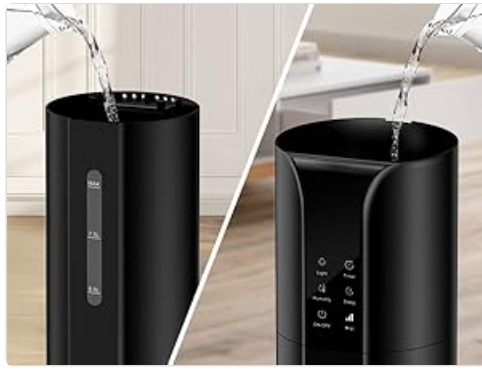
Image: Two comparative images illustrating the top-fill method, showing water being poured into the humidifier from different angles.