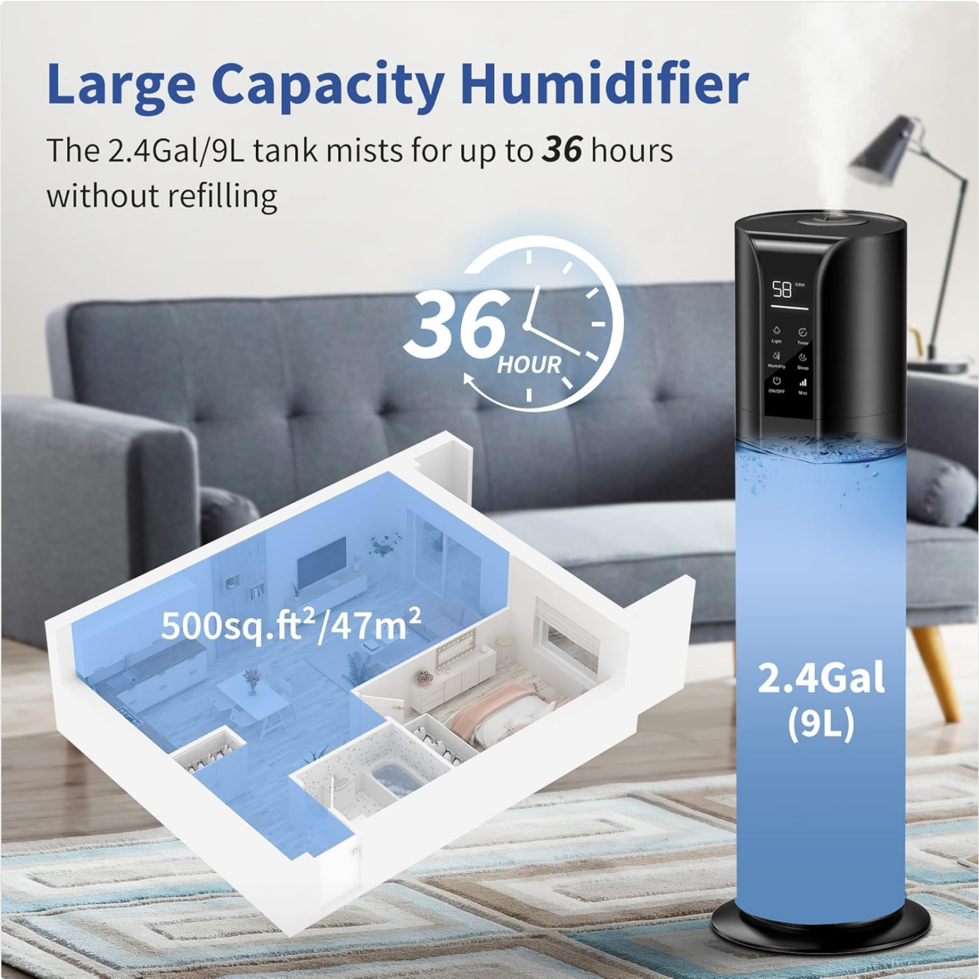
Image: A diagram illustrating the large capacity of the humidifier (2.4 Gallons / 9 Liters) and its ability to cover an area of 500 sq. ft. (47 m 2 ), with an impressive 36-hour runtime.