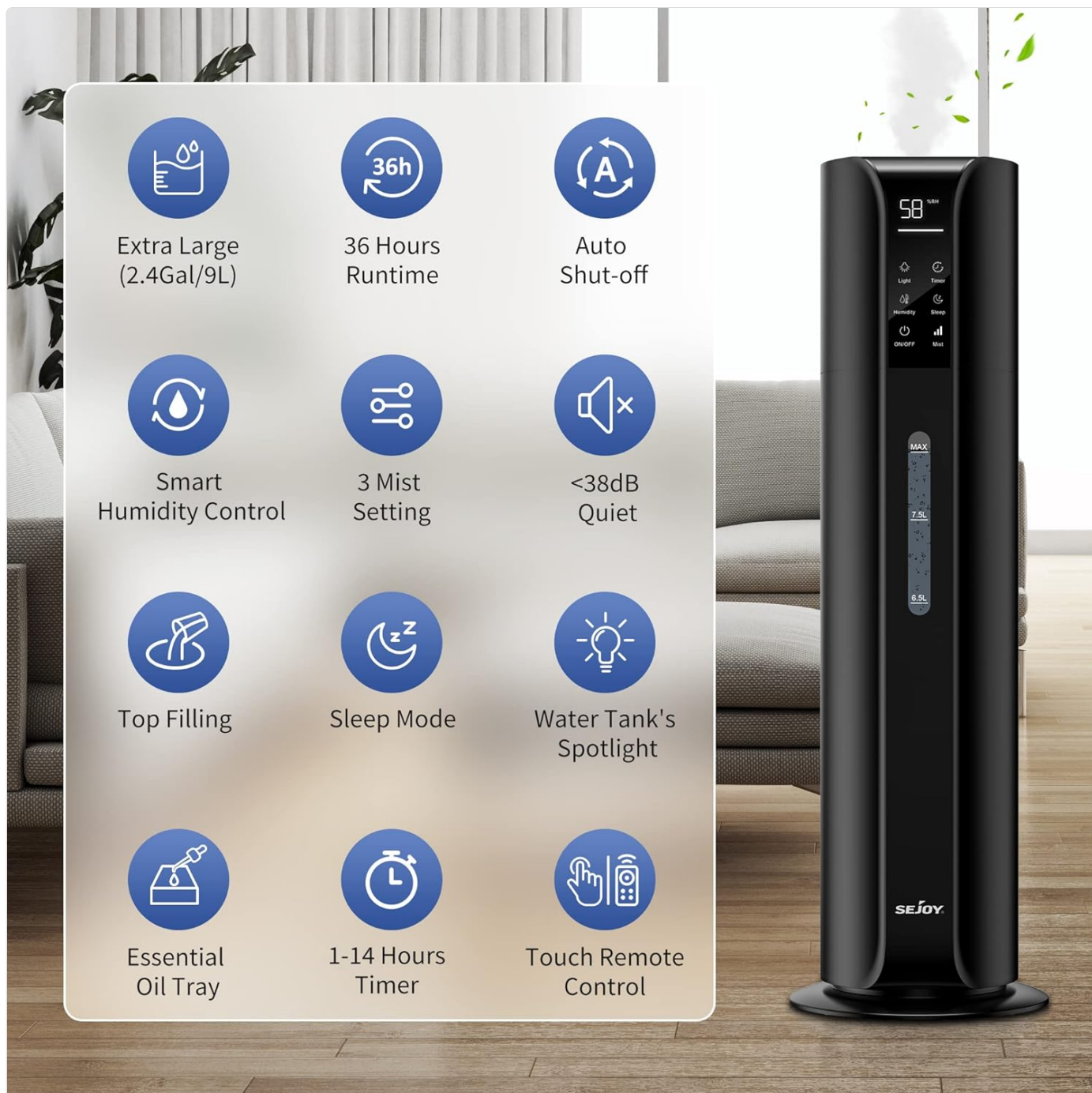
Image: An infographic highlighting the key features of the Sejoy Humidifier, including its extra-large 9L capacity, 36-hour runtime, auto shut-off, smart humidity control, three mist settings, quiet operation (less than 38dB), top-filling design, sleep mode, water tank spotlight, essential oil tray, 1-14 hour timer, and touch remote control.