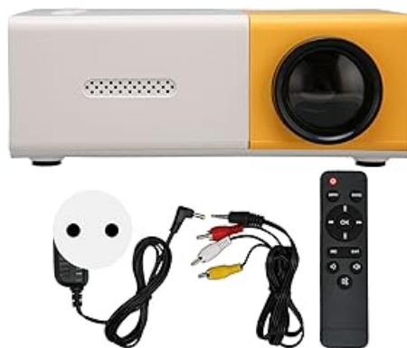
Image 3.1: Included accessories with the Goshyda Portable Projector.