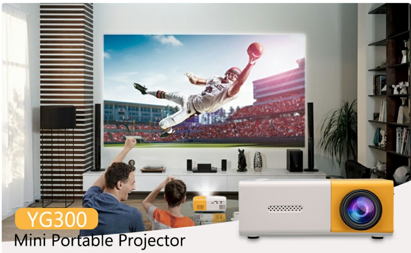
Image 1.1: The Goshyda YG300 Mini Portable Projector in a home entertainment setting.

Thank you for choosing the Goshyda Portable Multimedia 1080P Projector. This compact and versatile device is designed to provide a personal cinema experience, supporting various multimedia inputs for entertainment, presentations, and more. Please read this manual carefully before using the projector to ensure proper operation and to maximize its lifespan.