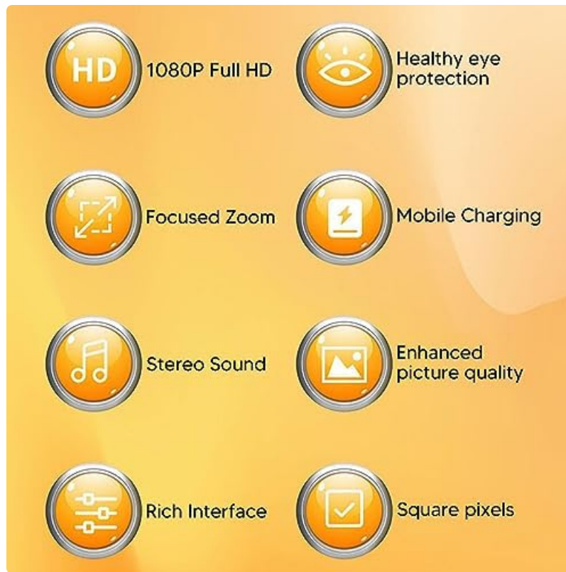
Image 4.1: Visual representation of the projector's main features.