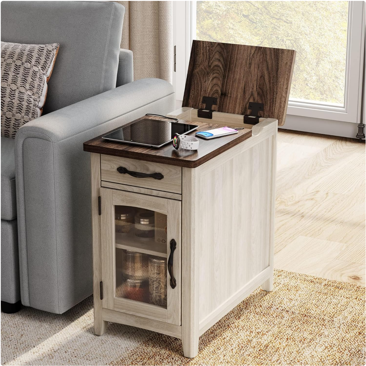
Image: An overhead view of the end table with the top panel slid open, revealing the hidden charging station with multiple outlets and USB ports. A tablet and smartphone are shown charging on the table surface.