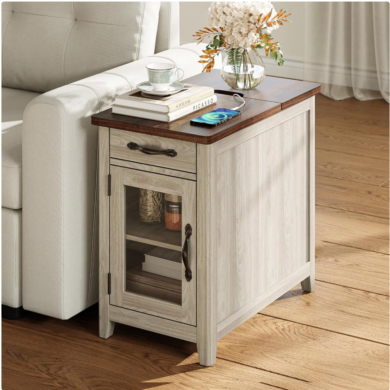
Image: The LINSY HOME Farmhouse End Table, featuring a washed grey and brown finish, positioned beside a light-colored sofa. The table top displays a vase with flowers, books, and a smartphone charging.