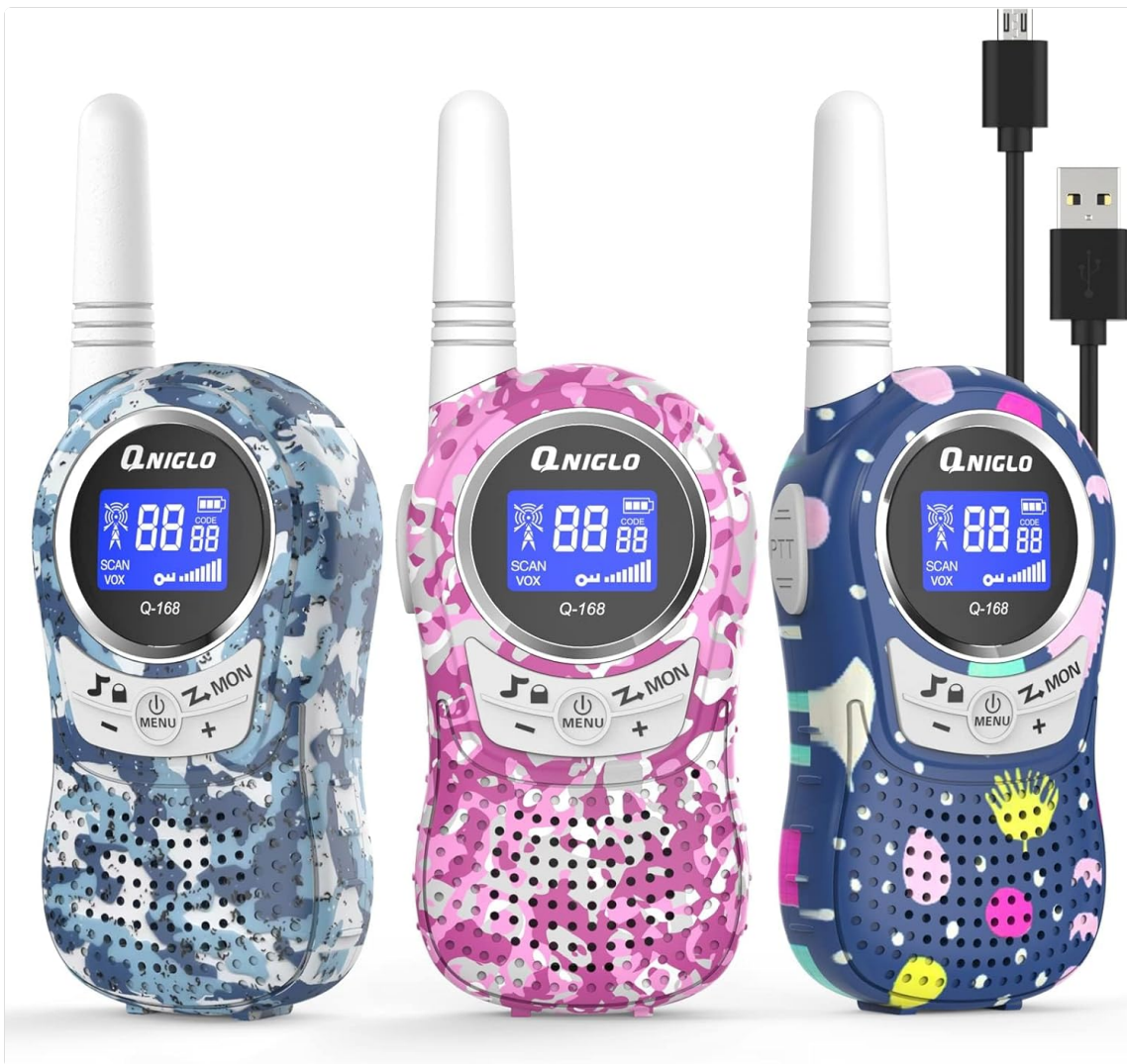
Image: The QNIGLO Q168Plus Walkie Talkie set, showcasing the three distinct color patterns and the included USB charging cables.