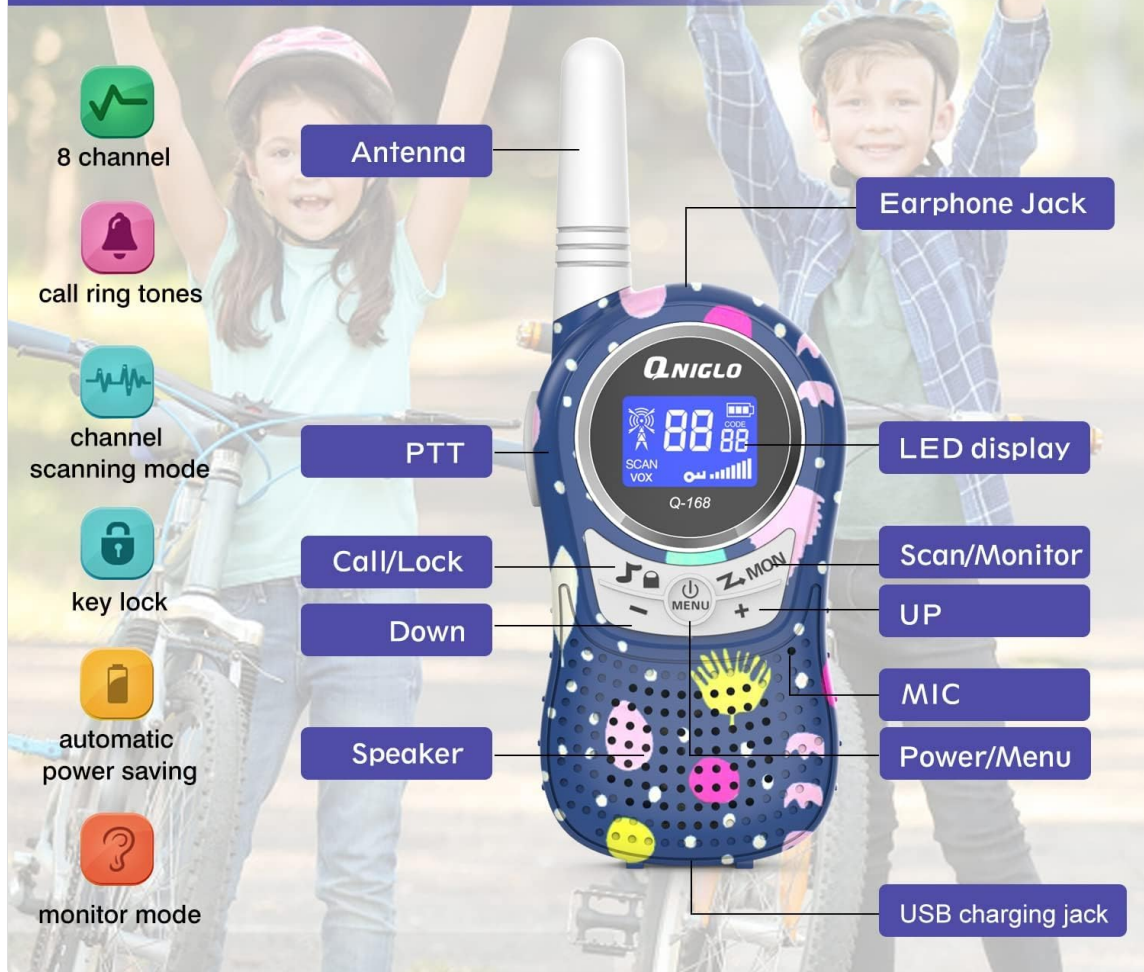
Image: Detailed diagram showing the various parts and functions of the QNIGLO Q168Plus Walkie Talkie.