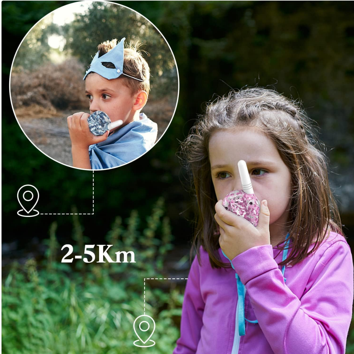
Image: Children demonstrating the use of the walkie-talkies for communication over a distance, highlighting the effective range.

To speak, press and hold the PTT (Push-to-Talk) button. Speak clearly into the microphone. Release the PTT button to listen for a response. Ensure you are on the same channel as the person you wish to communicate with.