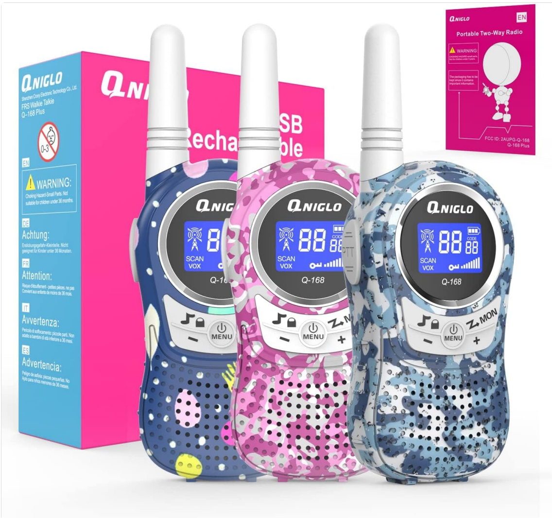
Image: The QNIGLO Q168Plus Walkie Talkie set with its packaging, illustrating the contents you will find upon unboxing.