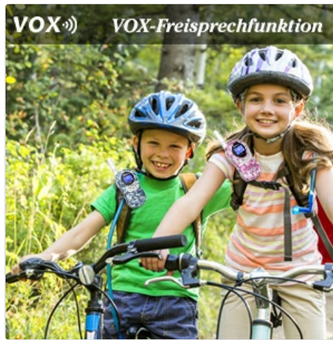
Image: Children using the walkie-talkies during outdoor activities, demonstrating the convenience of the VOX hands-free feature.