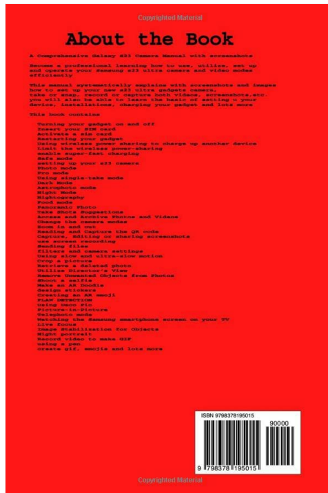
Figure 2: Back cover of the "SAMSUNG GALAXY S23 ULTRA CAMERA USER GUIDE" book. This image displays the ISBN barcode and additional publication details.