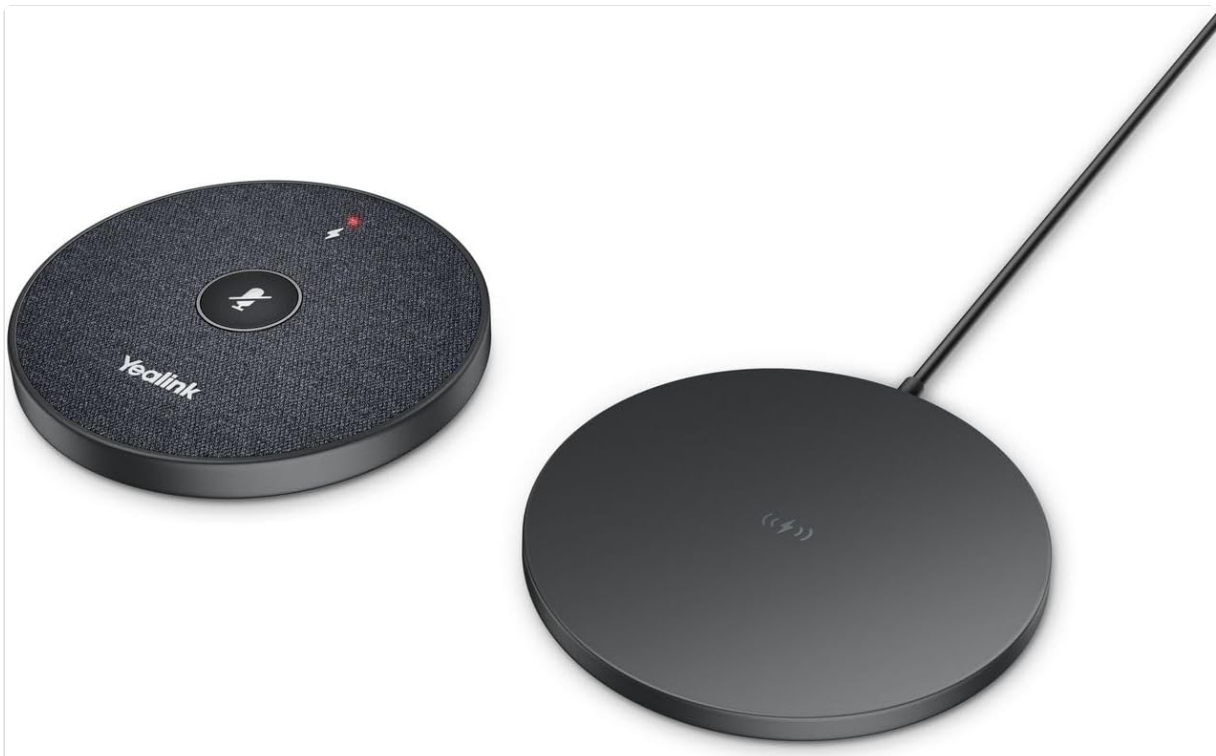
Figure 3.2: Yealink VCM36-W wireless microphone and its charging pad, illustrating the wireless nature of the device and its components.

The VCM36-W utilizes wireless transmission for seamless integration into your meeting room setup. To connect, simply pair the microphone with your compatible Yealink meeting room devices. This pairing process typically needs to be done only once. Refer to your main Yealink device's manual for specific pairing instructions. Once paired, the microphone can be freely placed within its operational range without the need for physical cables to the main unit.