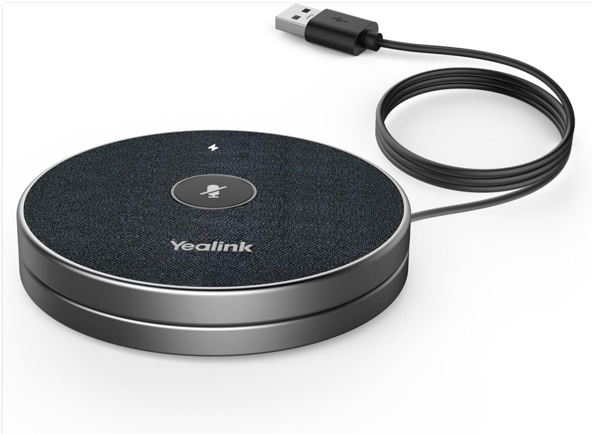
Figure 3.1: Yealink VCM36-W microphone connected to a USB cable for charging, showing the charging setup.