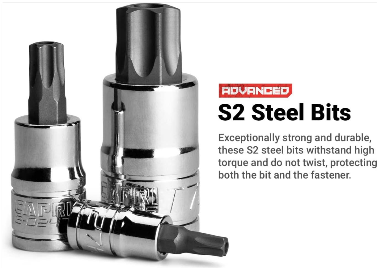
Image 2.1: Advanced S2 Steel Bits. This image shows several Capri Tools bit sockets, highlighting the S2 steel construction of the bits, emphasizing their strength and durability.