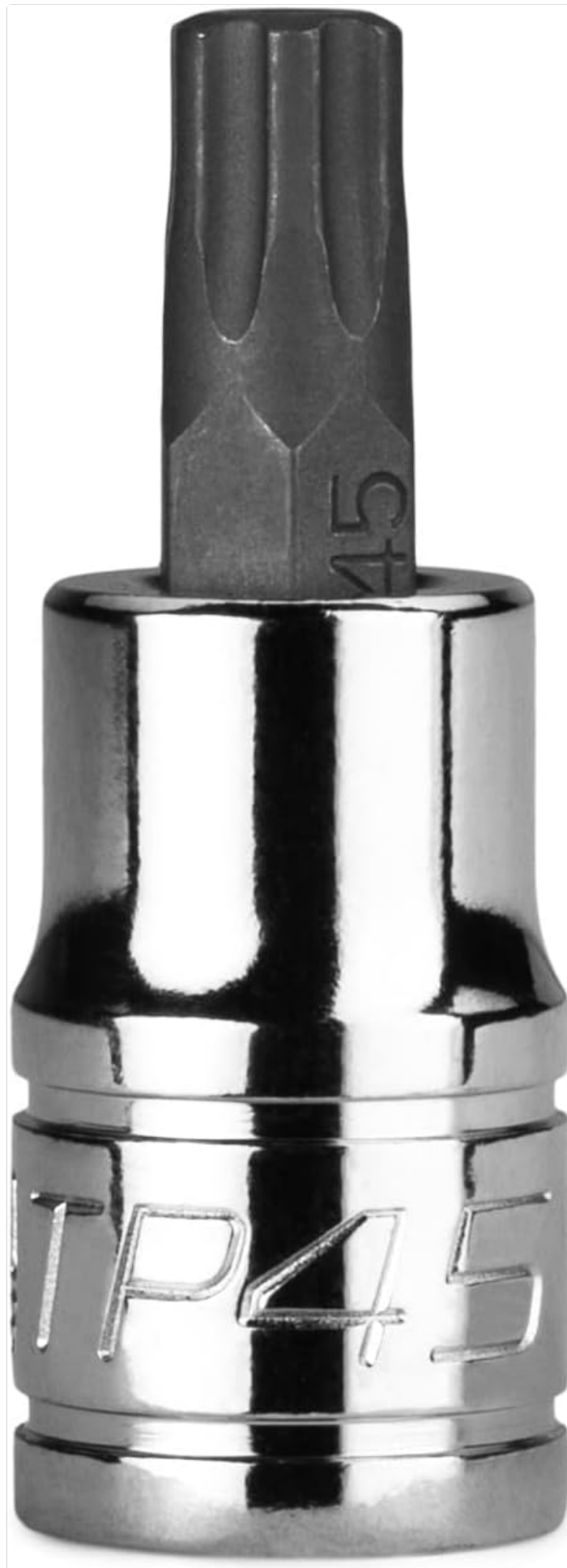
Image 1.1: Capri Tools TP45 Star Plus Bit Socket. This image displays the chrome-finished socket with the black S2 steel bit extending from it, clearly showing the TP45 marking.