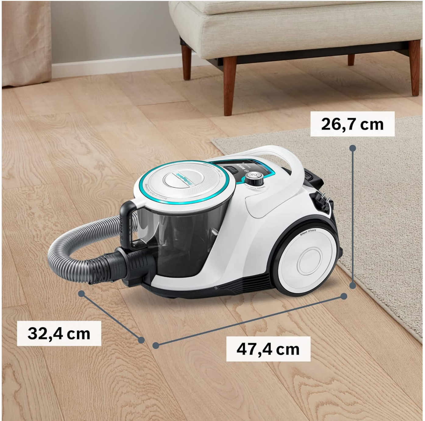
Image: Key dimensions of the Bosch Series 6 BGC41XHYG vacuum cleaner: 47.4 cm (length), 32.4 cm (width), 26.7 cm (height).