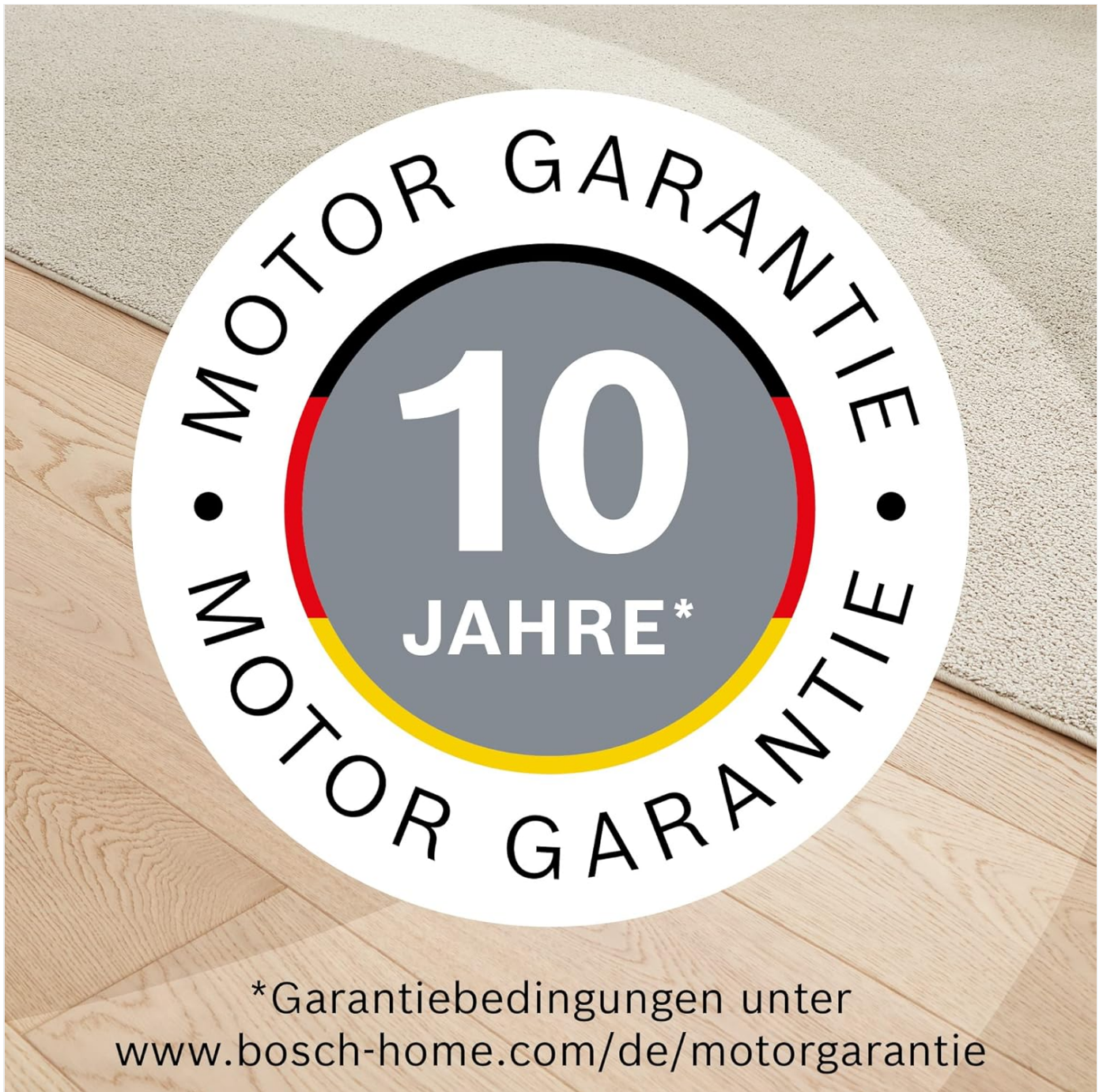
Image: Official badge indicating the 10-year motor warranty provided by Bosch.

For detailed warranty conditions, please visit the official Bosch website: bosch-home.com .