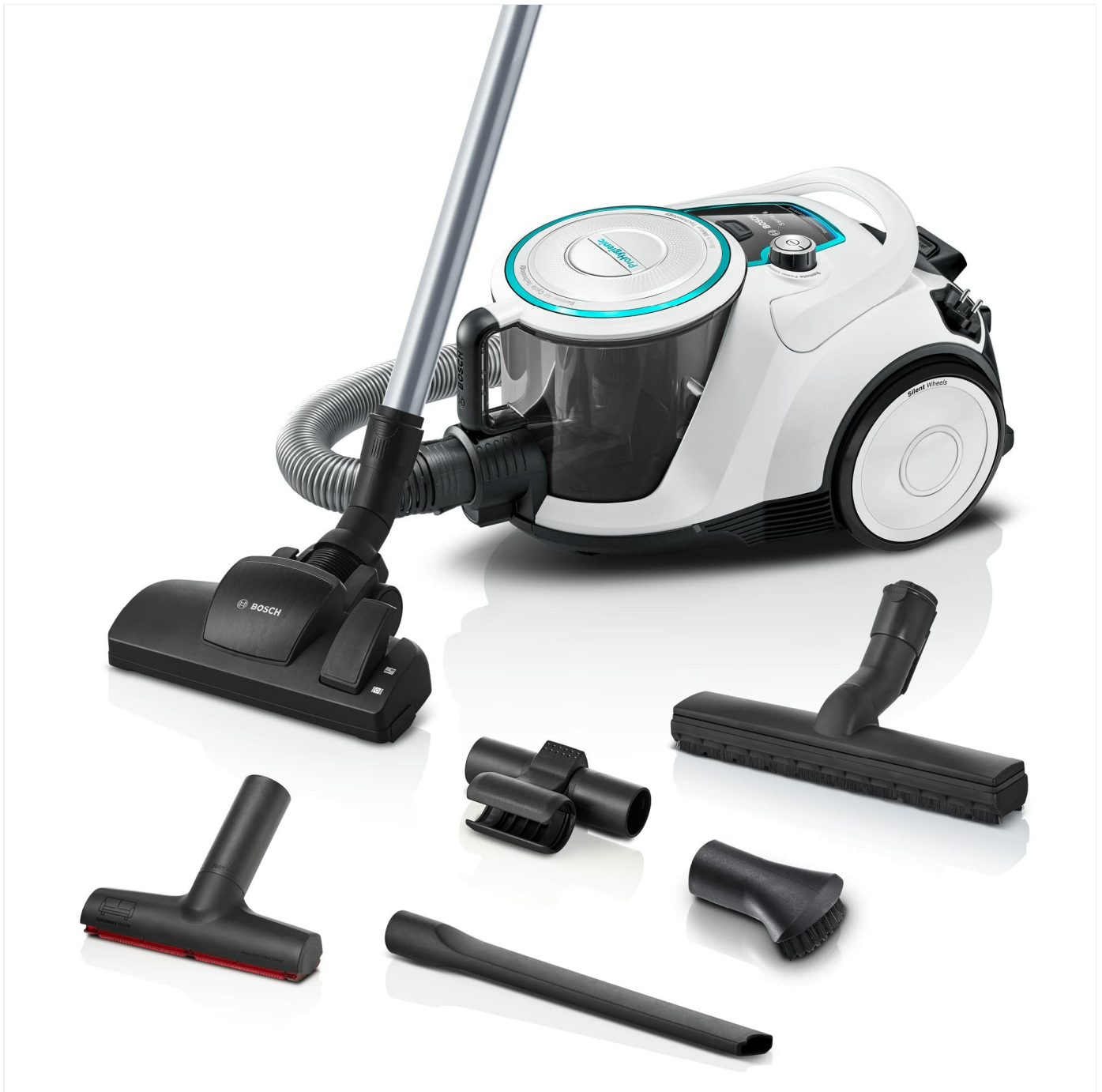
Image: The Bosch Series 6 BGC41XHYG bagless vacuum cleaner, a powerful and quiet appliance for thorough home cleaning.

The Bosch Series 6 BGC41XHYG is a powerful and quiet bagless vacuum cleaner designed for thorough cleaning. It features a ProHygienic system, SmartSensor Control for optimal performance, and an UltraAllergy filter, making it ideal for allergy sufferers. This model was recognized as a test winner by Stiftung Warentest (9/2024).