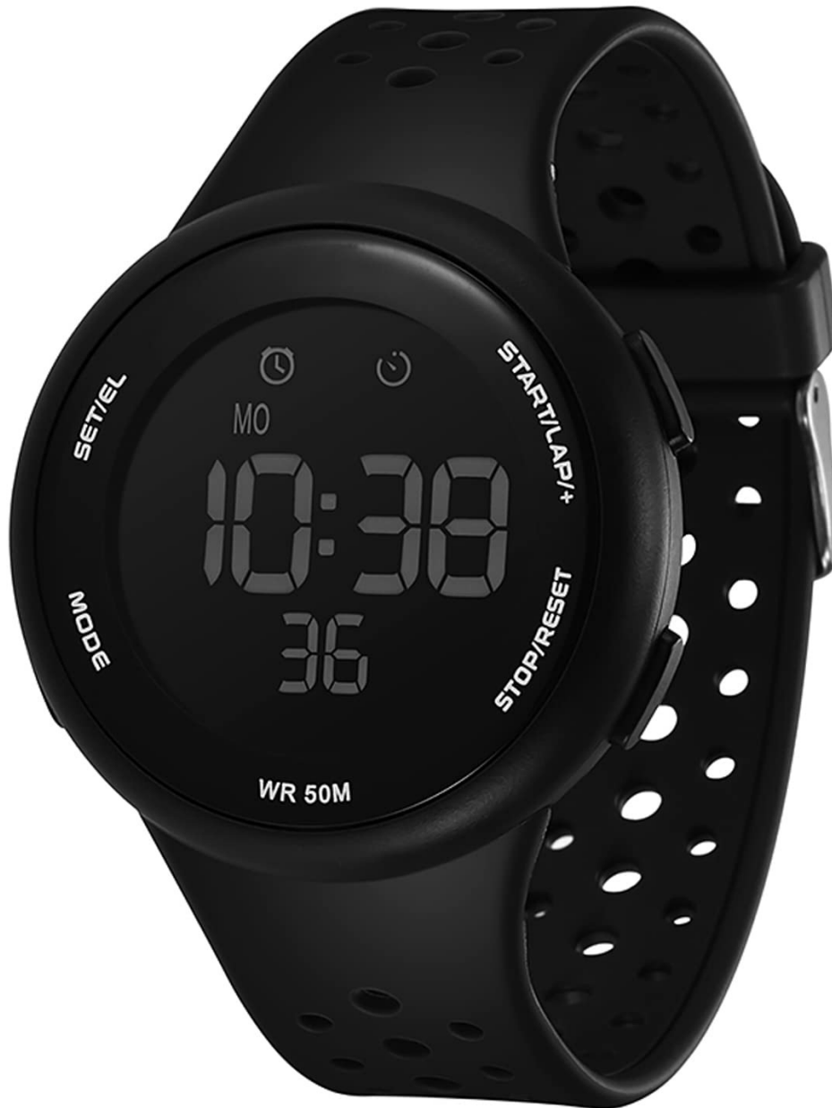
Figure 1: Front view of the Shocknshop Digital Sports Watch.