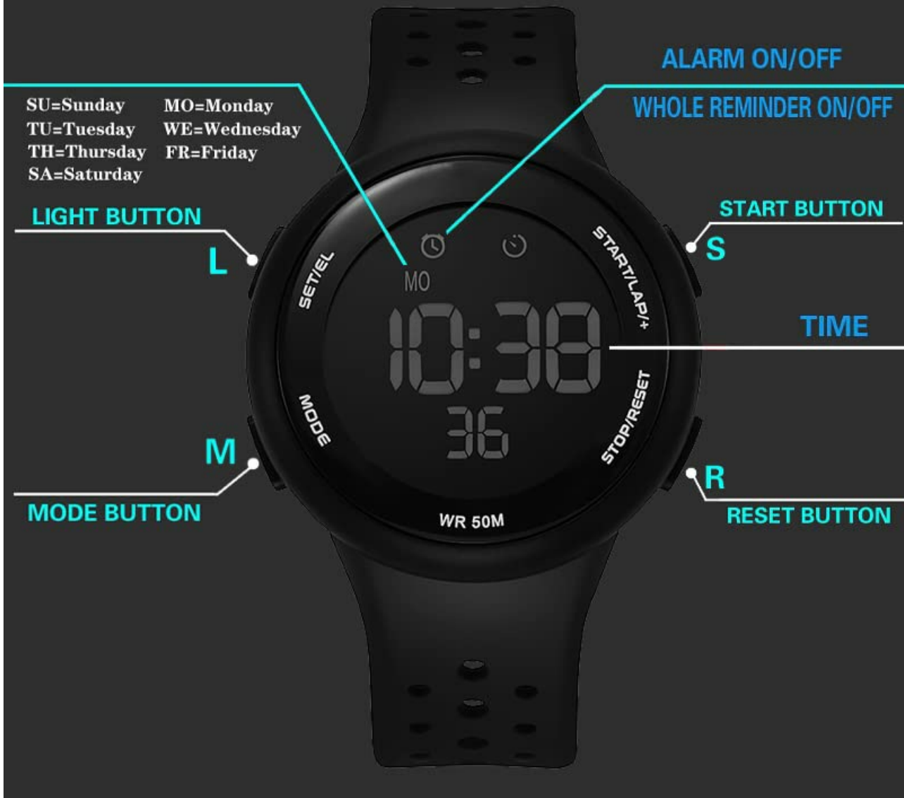
Figure 2: Watch button layout and functions.