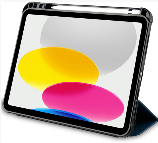
Image: iPad in React Folio Case in viewing stand position.