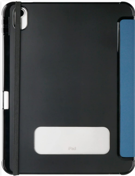
Image: Transparent back of the case.