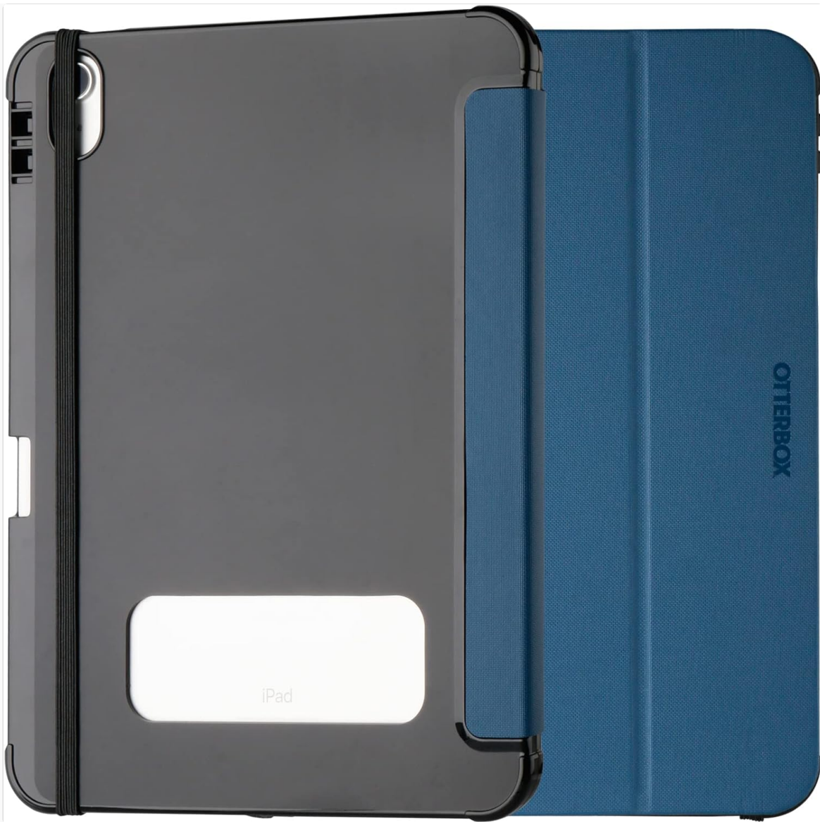
Image: OtterBox React Folio Case in blue, closed, showing the back with a clear window for the iPad logo and an elastic band.