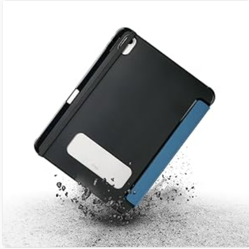
Image: Drop test illustration of the case.