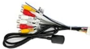
4G SIM cable (T10)