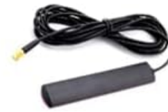
4G module (T10)