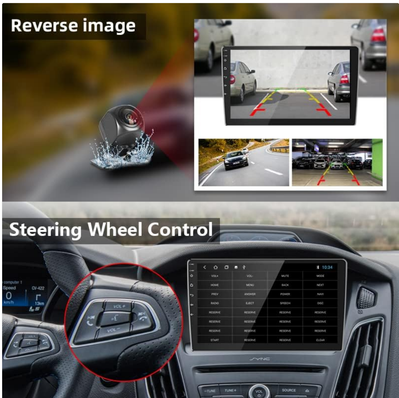
Figure 5.2: Steering wheel control integration and reverse camera display. The image highlights the ability to control the unit using existing steering wheel buttons and the automatic display of the reverse camera feed when backing up.