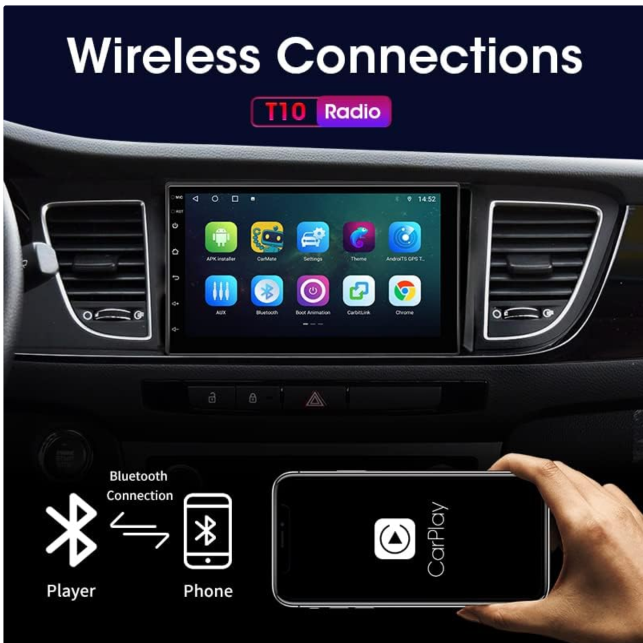
Figure 5.1: Wireless connection capabilities. The image shows the unit's interface with various apps and a visual representation of how a phone connects via Bluetooth and Carplay to the T10 radio.

The unit supports Bluetooth for hands-free calls and audio streaming, as well as wireless Carplay and Android Auto for seamless smartphone integration.