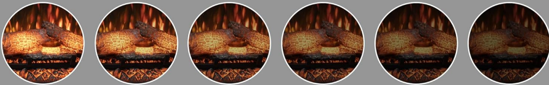
Figure 3: Flame and Heat Features. This graphic highlights the various flame brightness and speed options, along with heating capabilities and safety features.