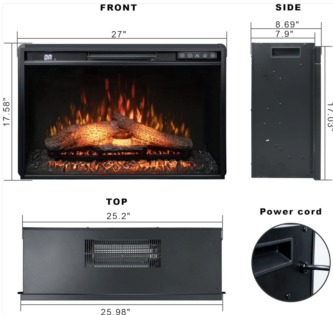
Figure 1: Product Dimensions. This image displays the front, side, and top dimensions of the 26-inch electric fireplace insert, crucial for proper installation.