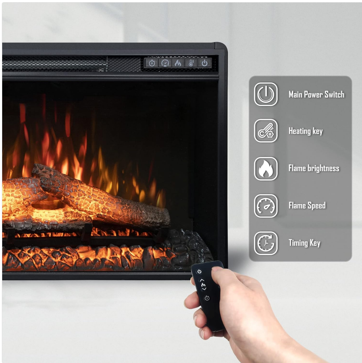
Figure 2: Control Panel and Remote. This image illustrates the various control buttons available on both the unit's panel and the remote control for easy operation.