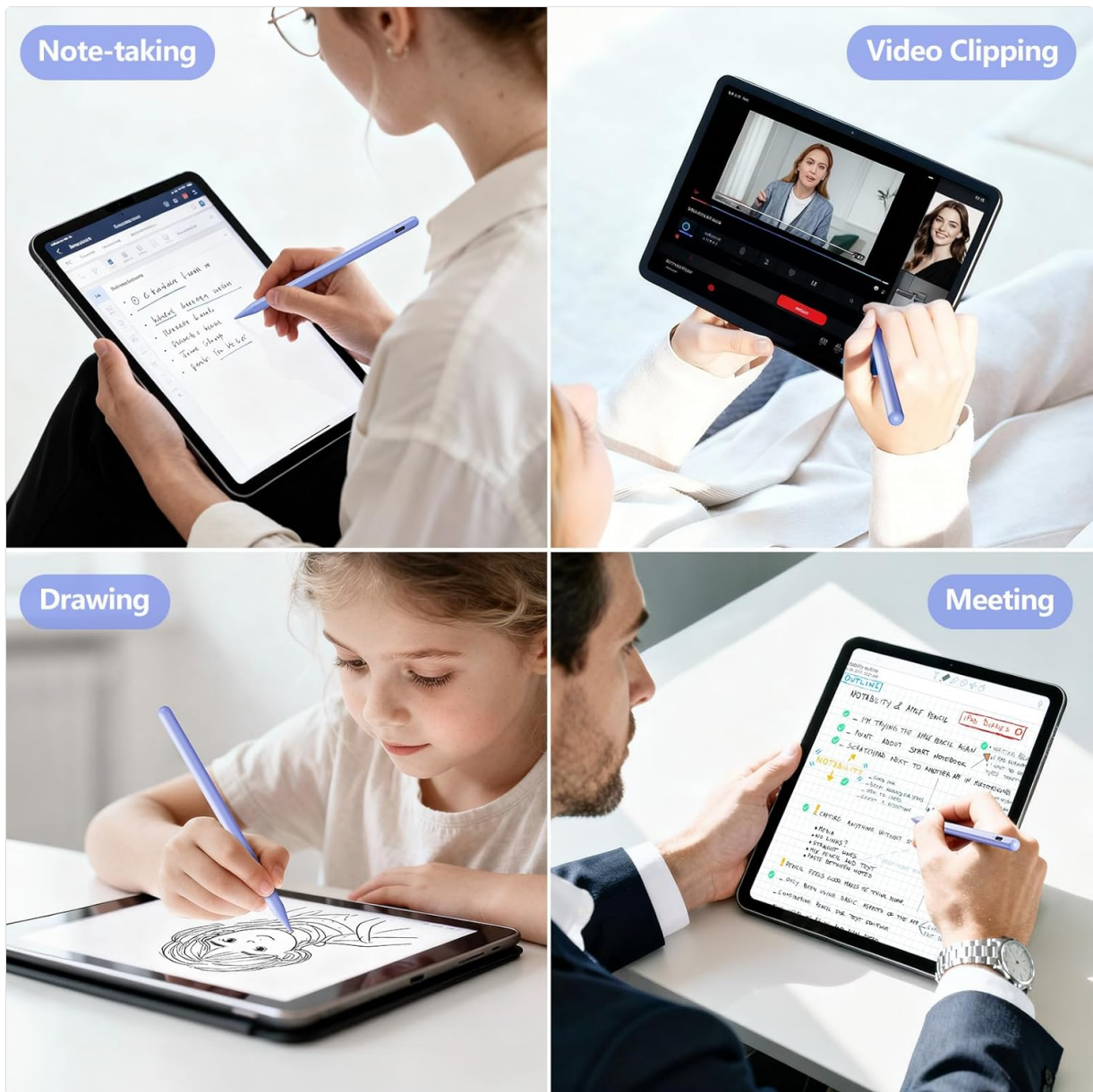
Figure 5: Versatile Applications of the Stylus Pen