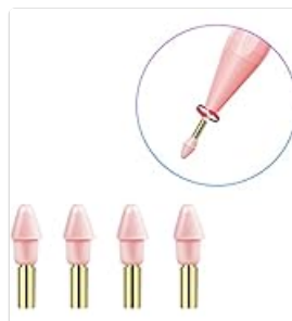
Figure 7: Stylus Pen Replacement Tips

The stylus pen comes with replacement tips. The pen tips are designed for easy installation and removal without the need for any special tools. If the pen tip becomes worn or damaged, simply twist it off and replace it with a new one.