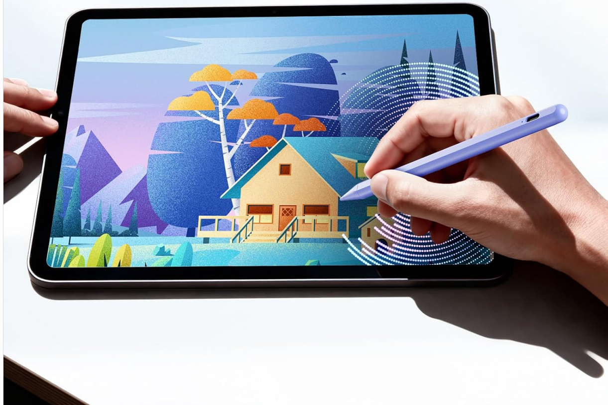
Figure 4: Palm Rejection in Action

Rests your hand comfortably on the screen while writing or drawing