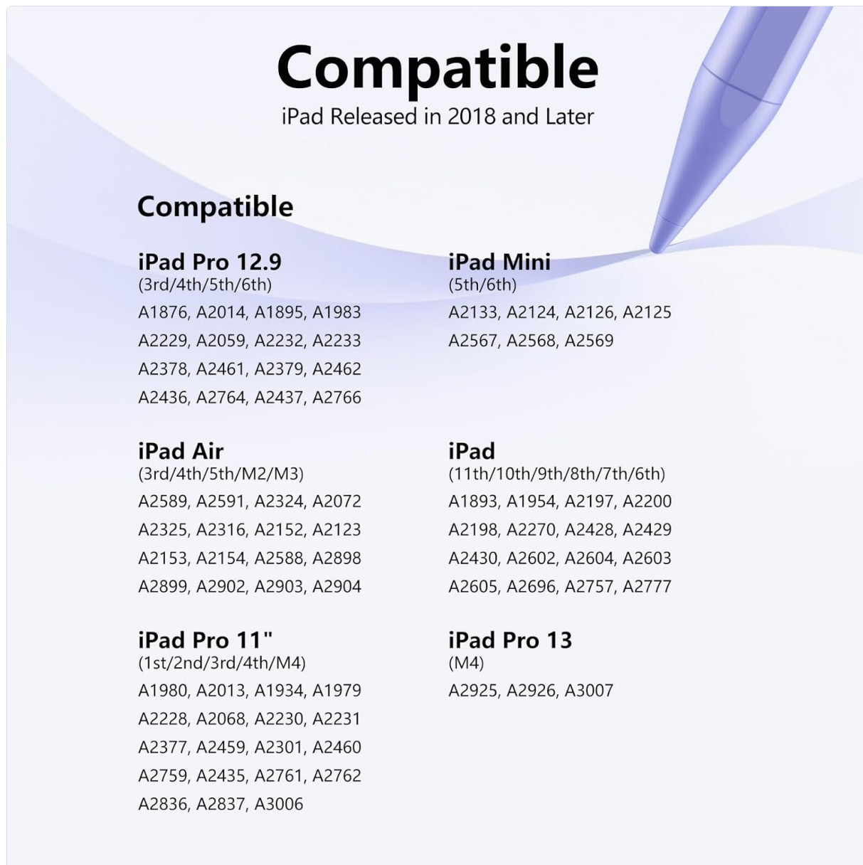
Figure 1: Stylus Pen Compatibility Overview