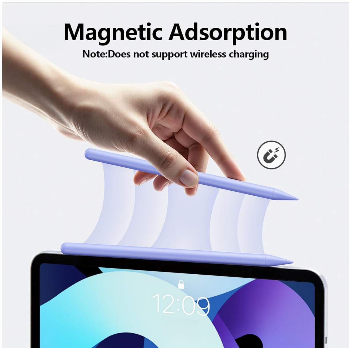
Figure 3: Magnetic Adsorption Feature

The stylus pen features magnetic adsorption, allowing it to attach to the side of compatible iPads for convenient storage. Please note that magnetic adsorption does not support wireless charging.