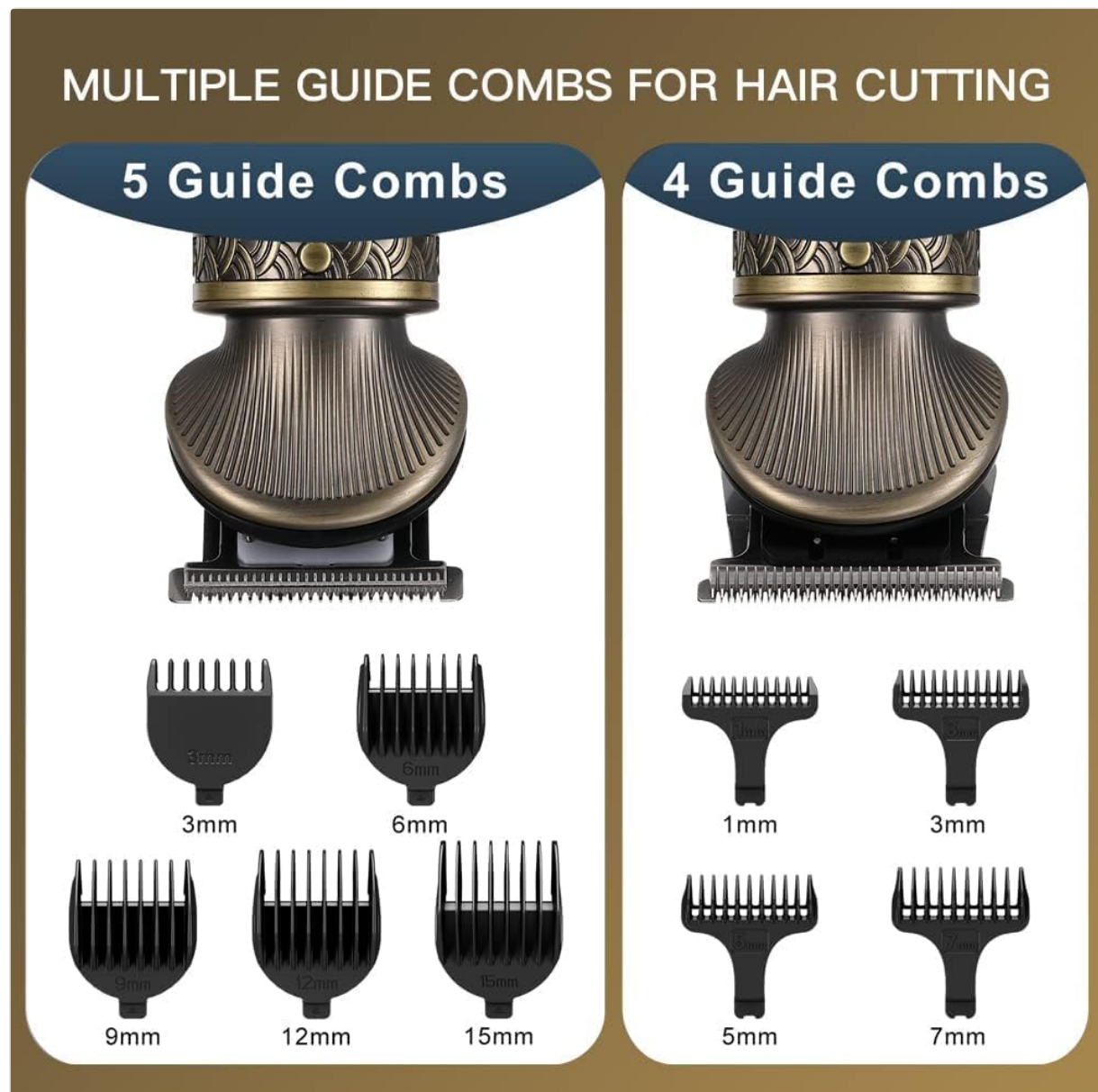
Image: Different guide combs for the hair clipper and T-blade trimmer, indicating various cutting lengths.