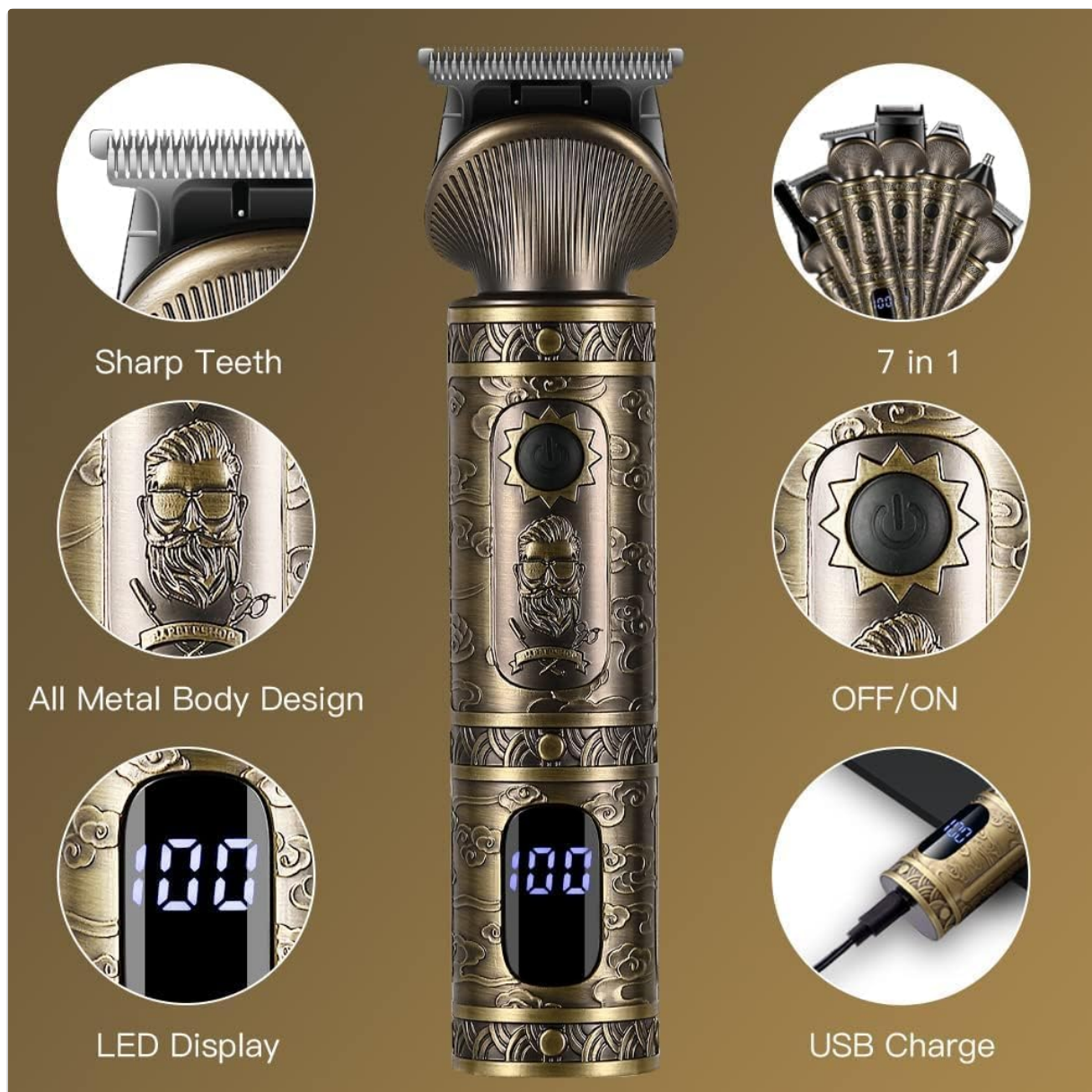
Image: Detailed view of the trimmer's features, including its sharp blades, metal construction, LED battery indicator, and USB charging capability.