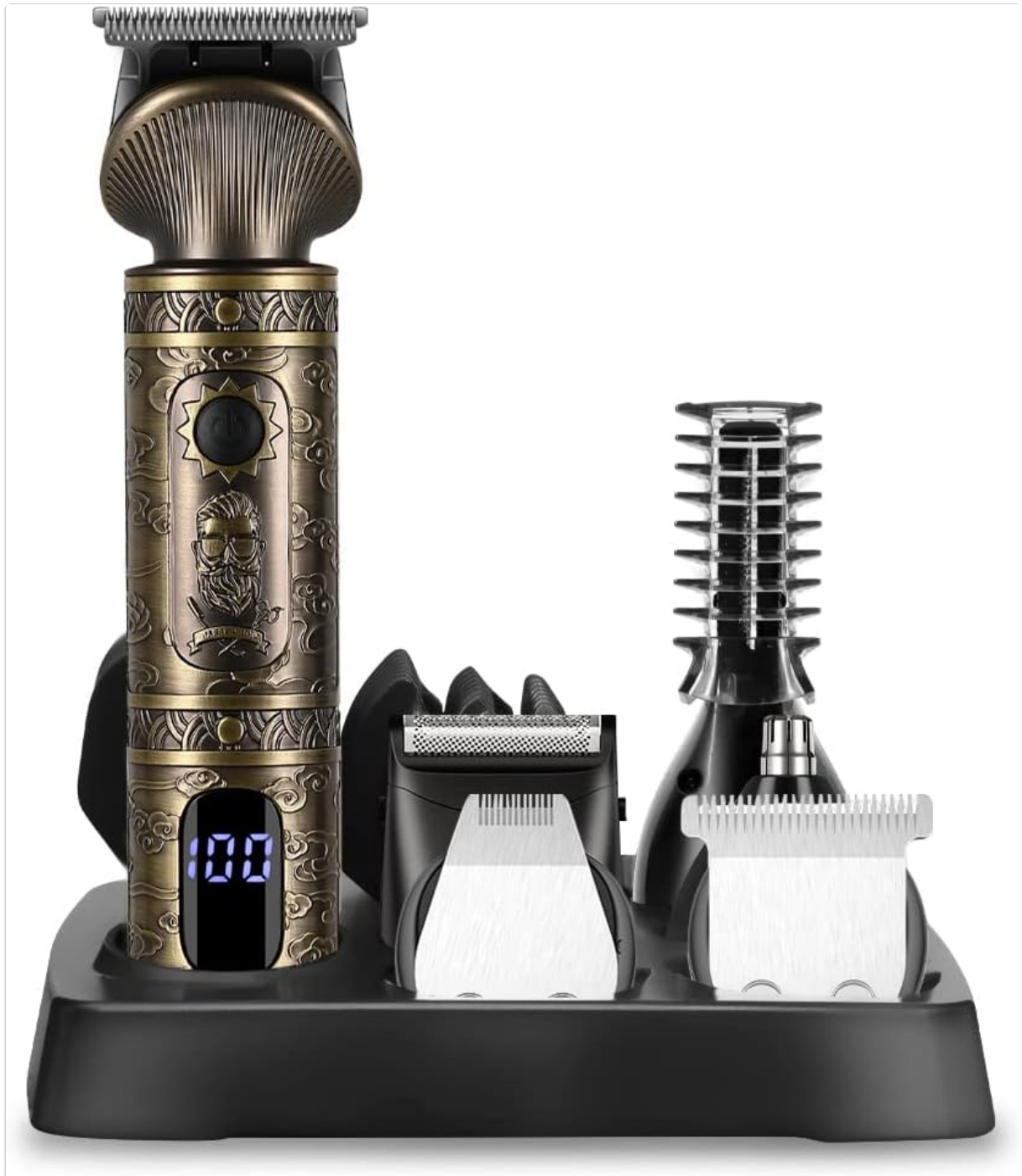
Image: The complete Surker 7-in-1 Grooming Kit, including the main unit, various interchangeable heads, guide combs, cleaning brush, and charging stand.