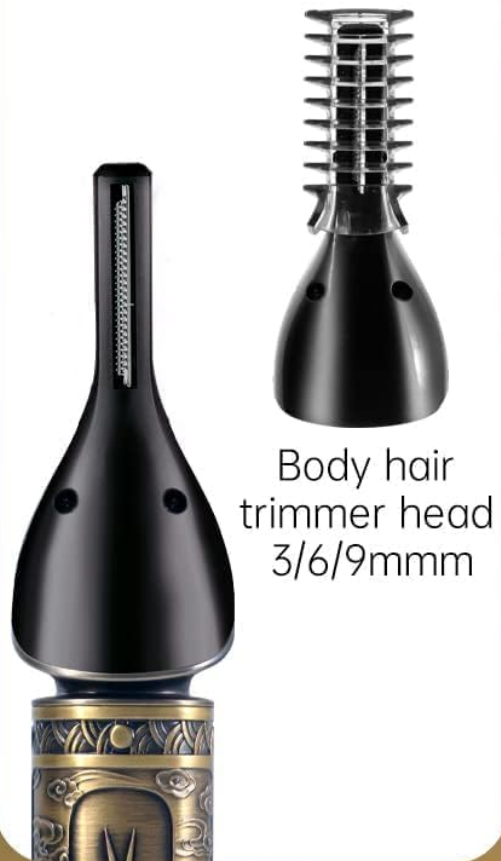
Image: The precision comb for detailed trimming and the body hair trimmer head with its specific comb.