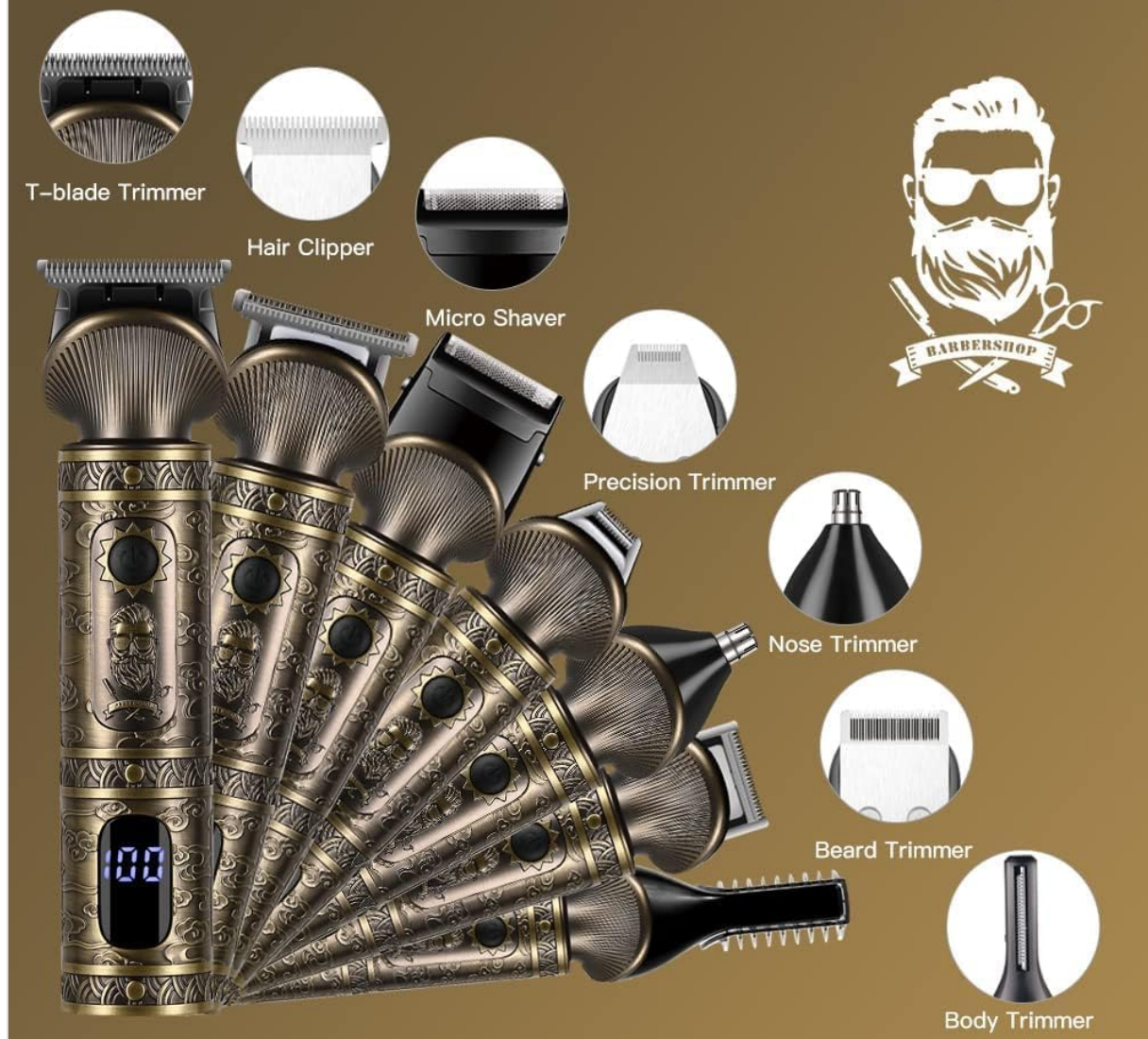
Image: Visual representation of the 7 interchangeable heads included in the grooming kit.