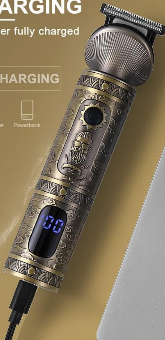
Image: The trimmer being charged via a USB connection, highlighting its fast charging time and long runtime.