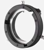
1 x Bowens Mount Adapter