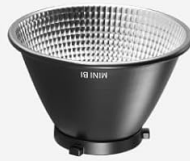
1 x Reflector