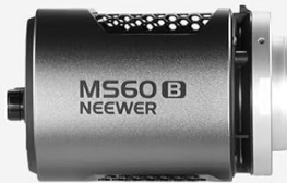
1 x LED Bi Color Light