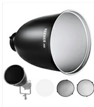
Image: Detailed view of the NEEWER mount with the Bowens mount adapter and umbrella hole, ready for light modifiers.

The MS60B features a proprietary NEEWER mount. To use Bowens mount accessories (softboxes, photography umbrellas, beauty dishes), attach the included Bowens mount adapter to the light. Then, mount your desired modifier onto the adapter.