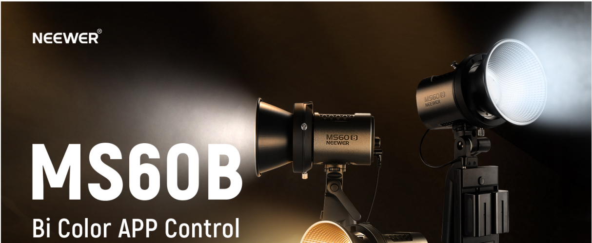
Image: Key specifications and performance metrics of the MS60B, highlighting its compact size and high output.