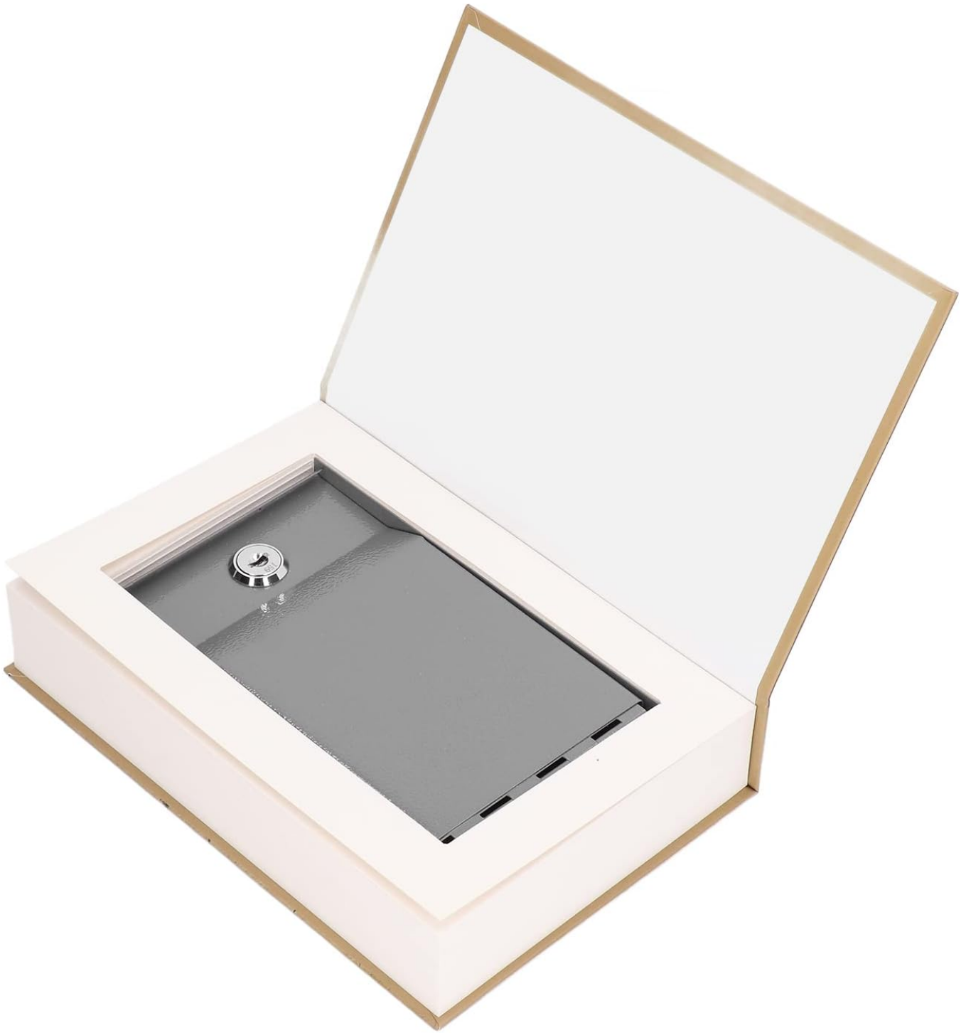
Figure 2: The book safe opened, revealing the internal metal lock box with its keyhole.