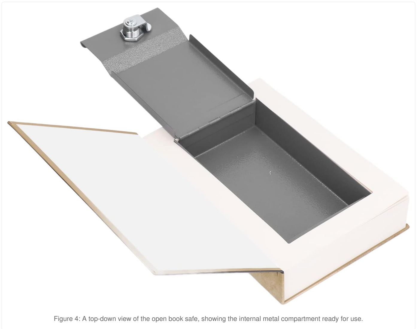
Figure 4: A top-down view of the open book safe, showing the internal metal compartment ready for use.