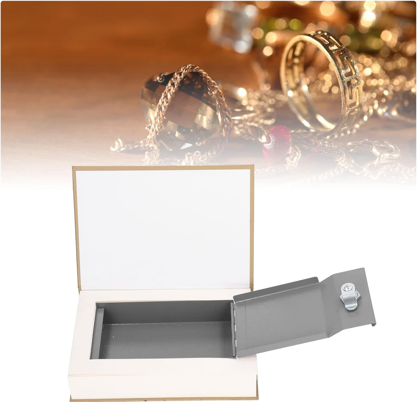
Figure 3: The book safe with its metal compartment lid open, ready for storing valuables like jewelry.