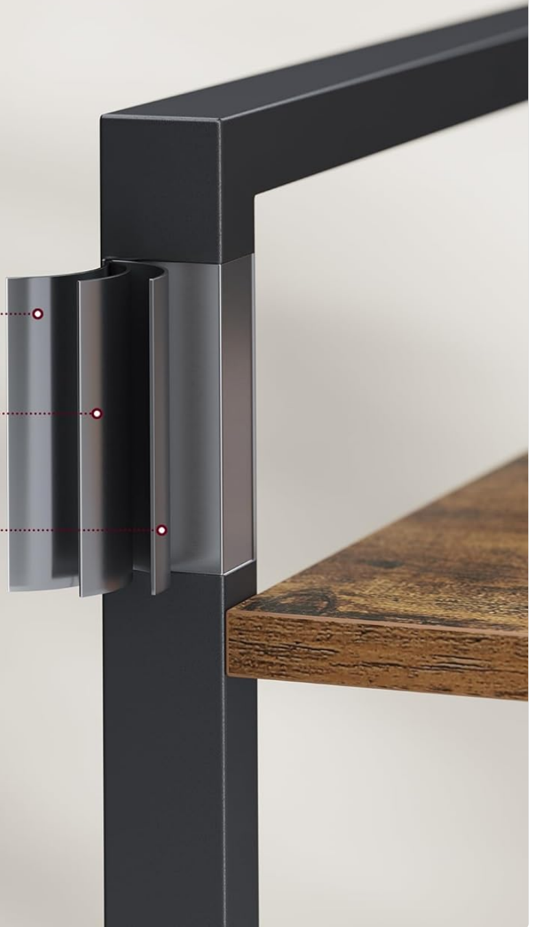
Figure 4: Construction details of the sturdy and durable steel frame.