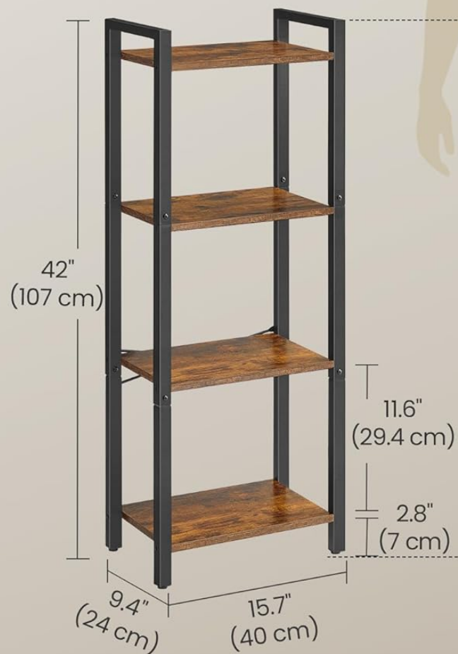
Figure 3: Detailed dimensions of the 4-Tier Bookshelf.