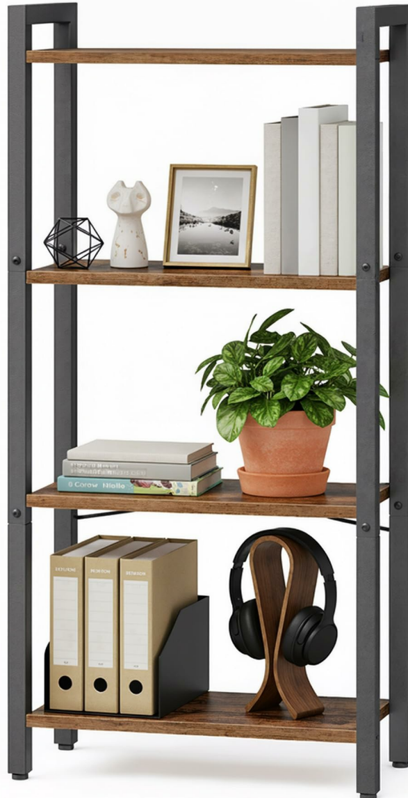
Figure 1: VASAGLE ULLS099B01 4-Tier Bookshelf in a home office environment.