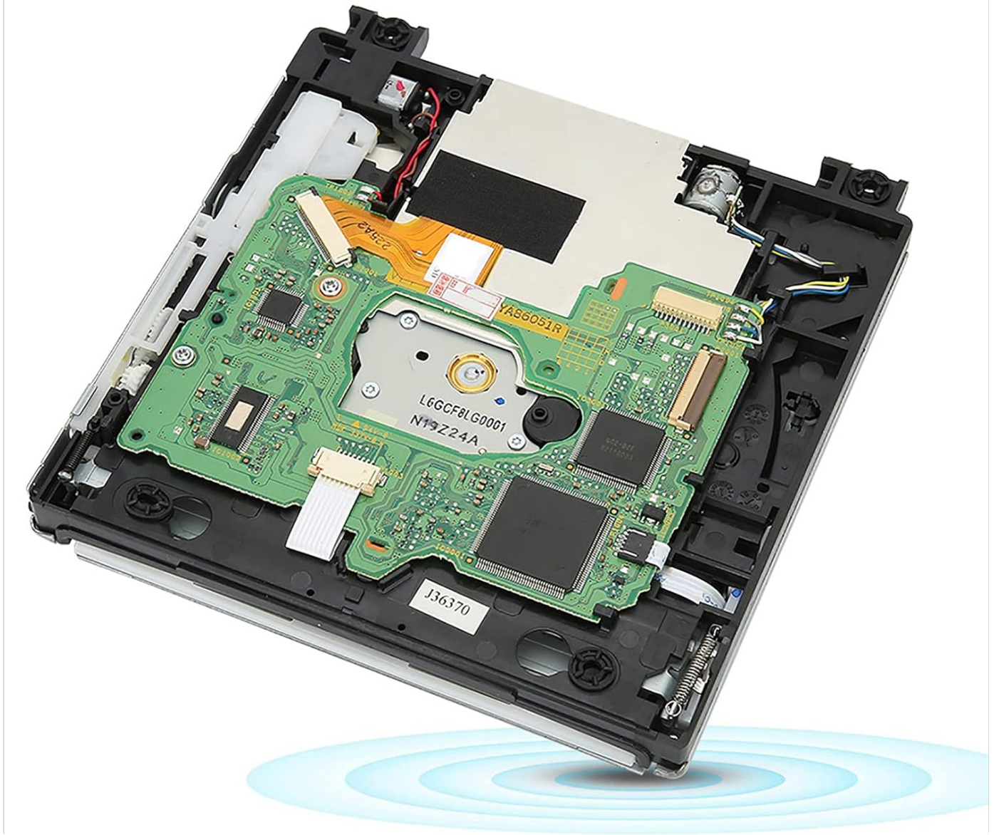
Image 4.1: The internal components and circuit board of the DVD drive, illustrating the connection points for installation.

Precise incisions and interfaces make sure perfect suitability for the installation location and ease of installation..