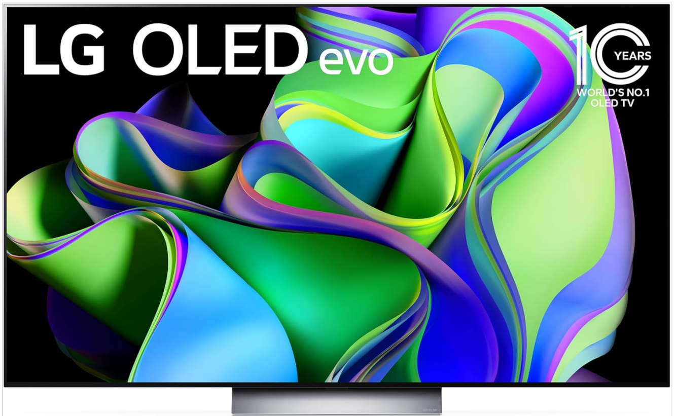
The LG C3 Series OLED evo 4K Smart TV, showcasing its sleek design.