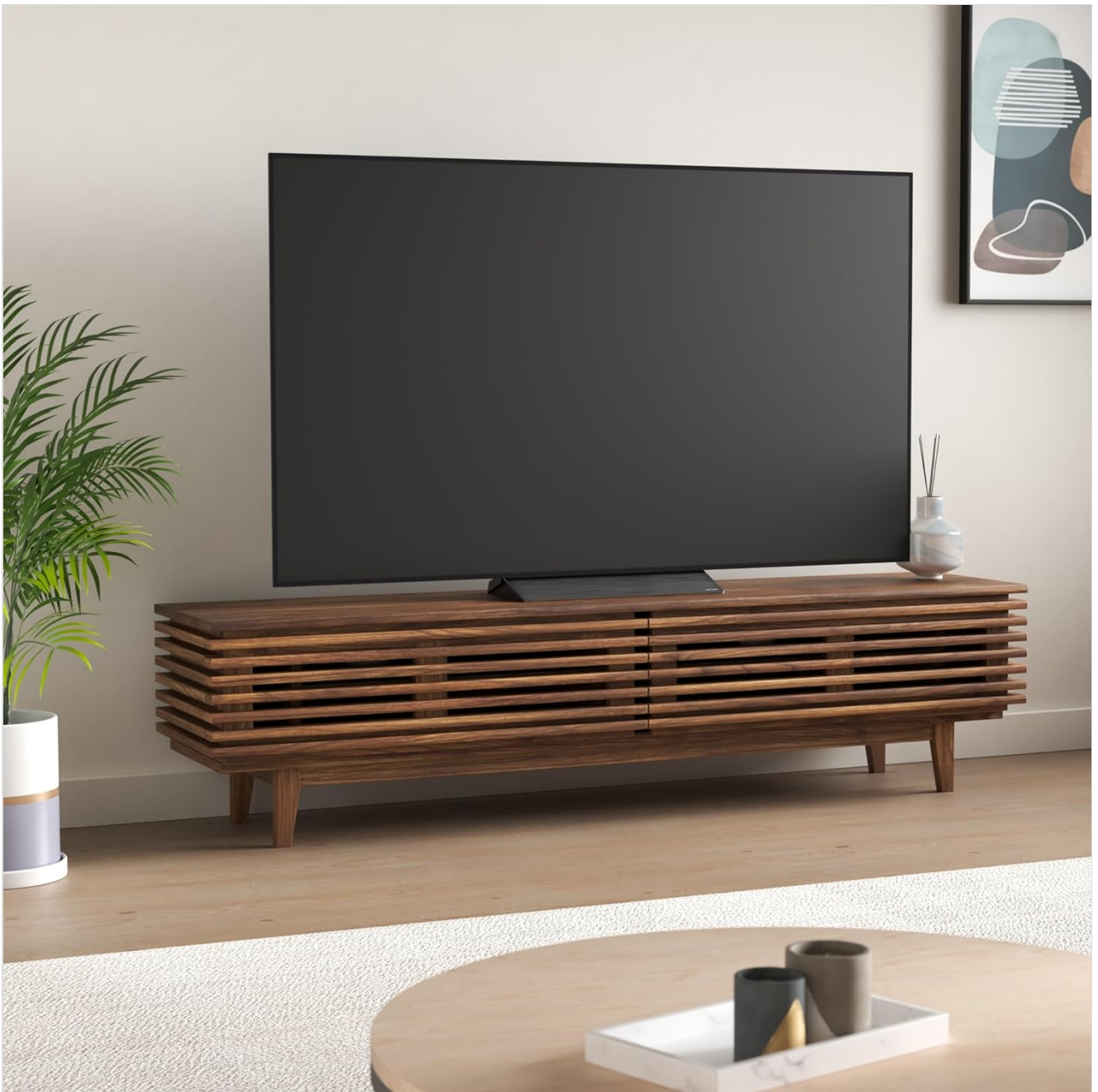
The LG C3 Series TV displayed on a media console, illustrating typical placement in a living room setting.