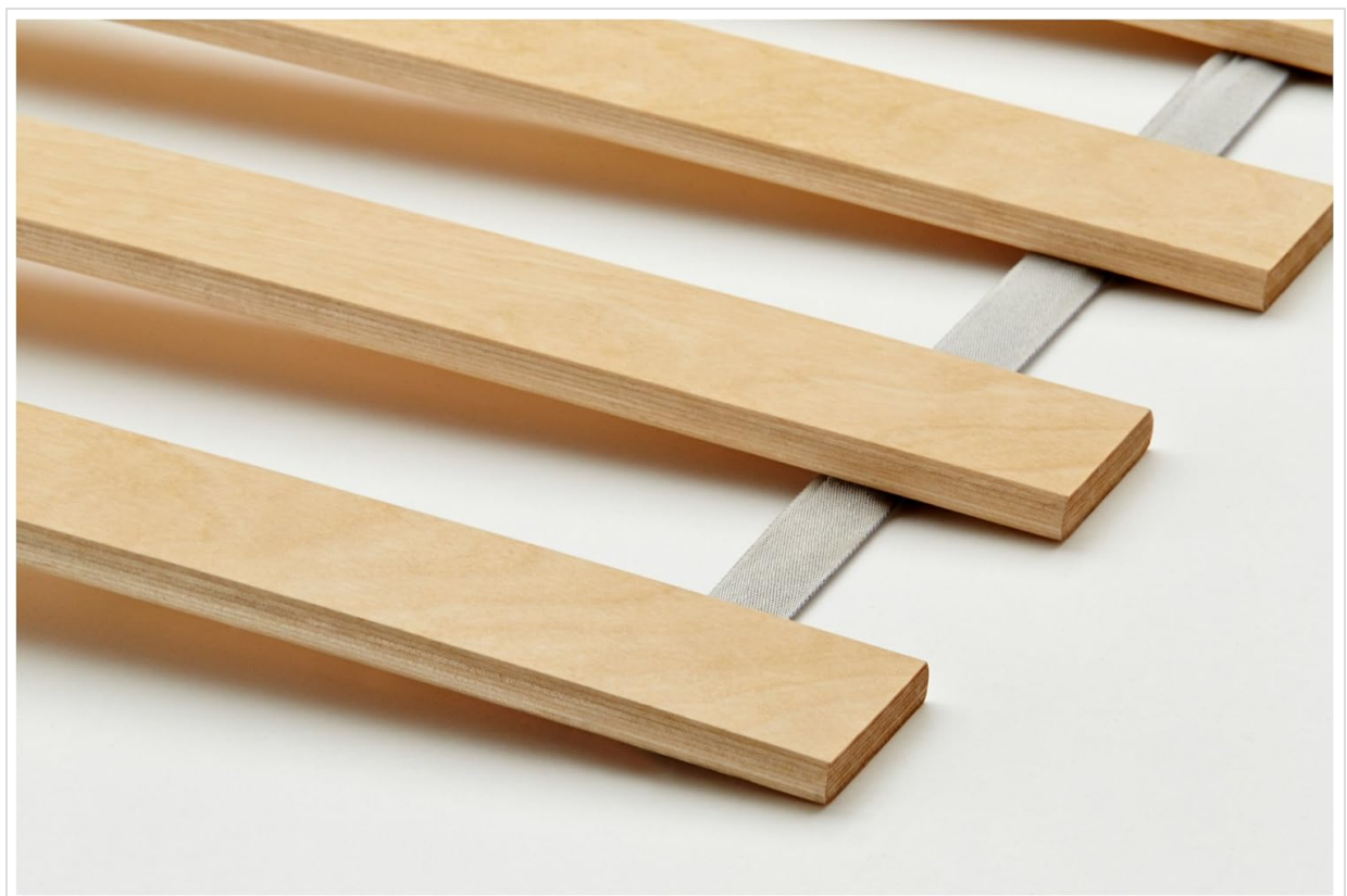
Image 2: Detail view of the LURÖY slats, highlighting the wood material and the connecting strap.