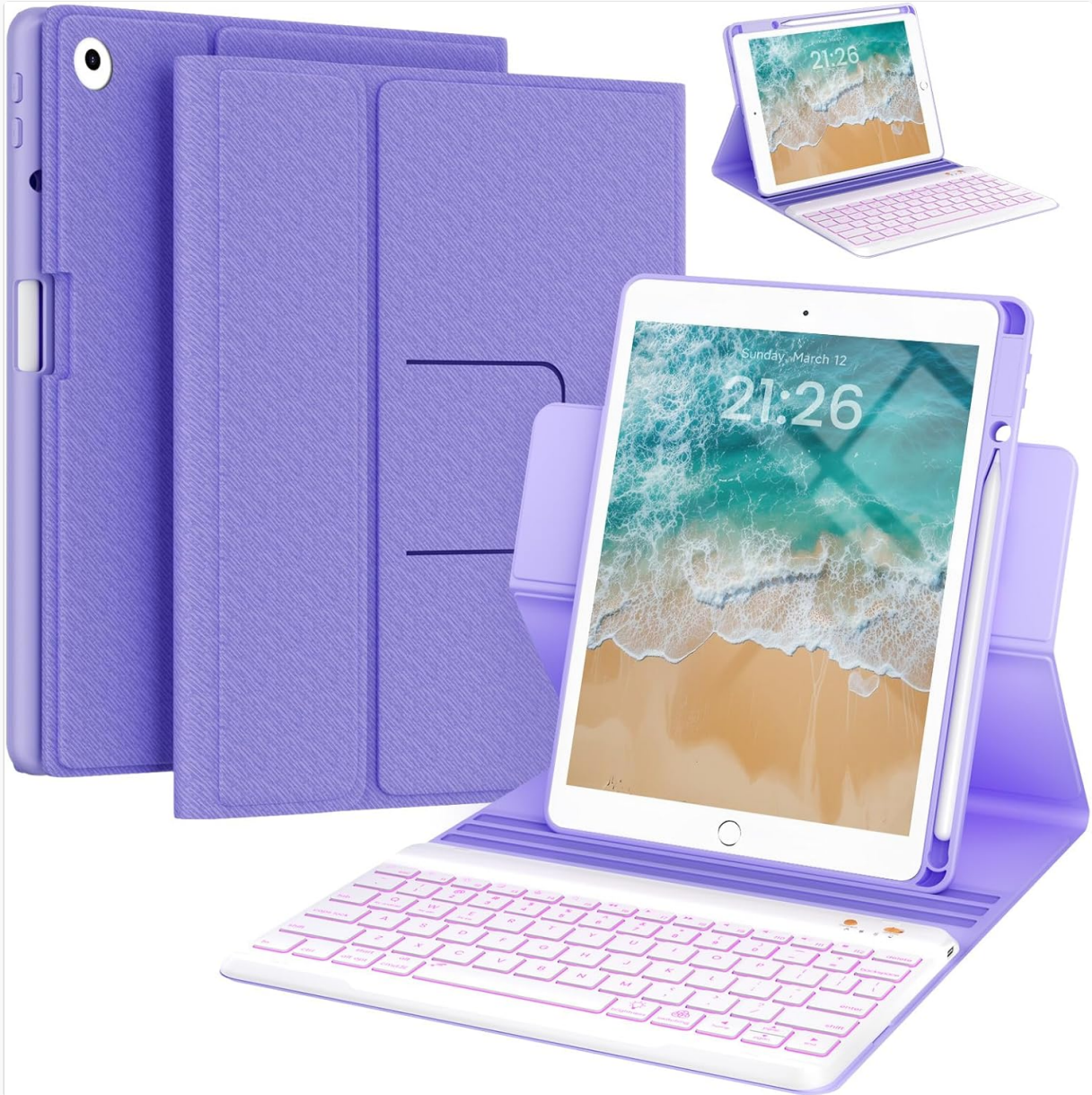
The BLUTLOTUS keyboard case in purple, showcasing its design with an iPad and the integrated keyboard.

Gently align your iPad with the case's frame and press it firmly into place until it is securely seated. Ensure all ports and buttons are accessible and not obstructed.