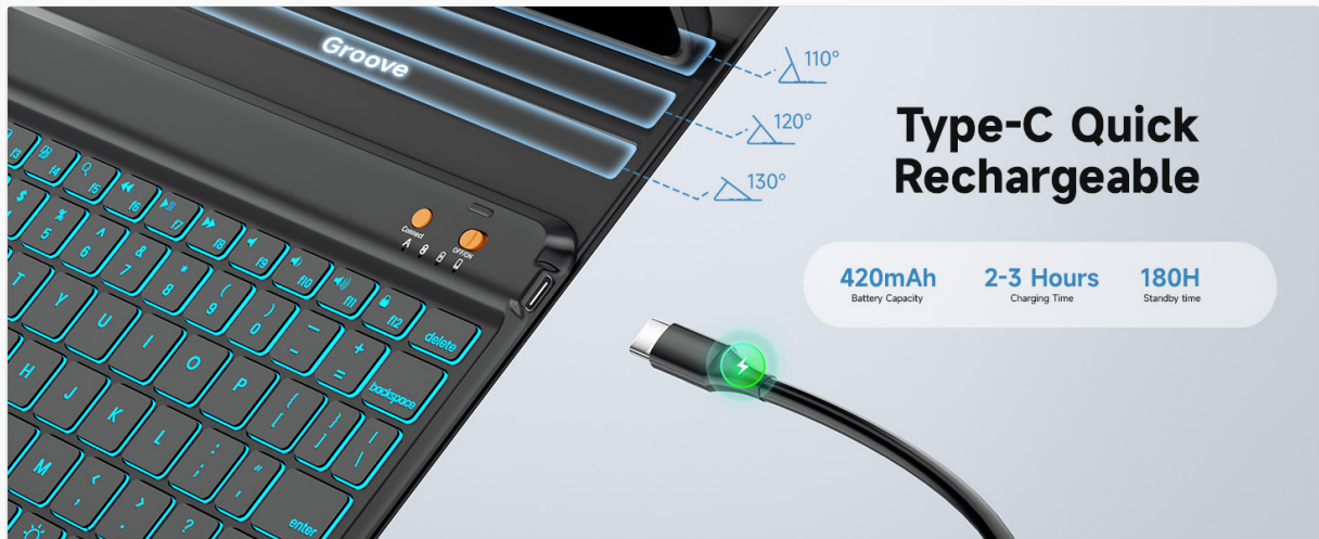
Illustration of the Type-C quick rechargeable feature, indicating battery capacity, charging time, and standby time.

Before first use, fully charge the keyboard. Connect the provided USB-C charging cable to the keyboard's charging port and the other end to a USB power adapter (not included).