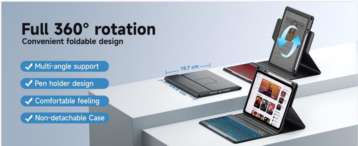
Illustration of the case's full 360-degree rotation capability and its convenient foldable design, offering multi-angle support.

The case features a 360-degree rotatable design, allowing you to switch between horizontal and vertical viewing orientations. The non-slip inner cloth and flexible hinge enable multiple viewing angles for typing, sketching, viewing, and reading.