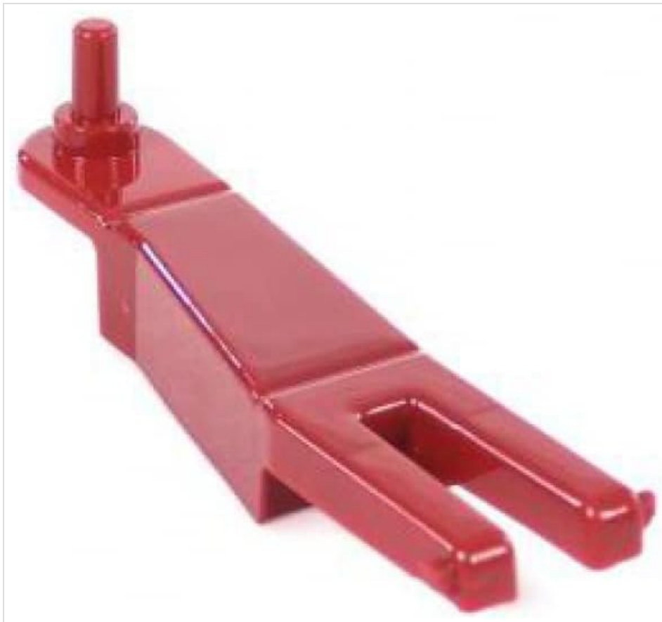
Figure 1: The Drip Tray Floater. This red plastic component is designed to float in the drip tray of compatible Philips coffee machines, signaling when the tray is full and requires emptying.

This document provides instructions for the Generic Drip Tray Floater, a replacement part designed for various Philips coffee machine models. This floater indicates when the drip tray needs to be emptied by rising as the tray fills with liquid.