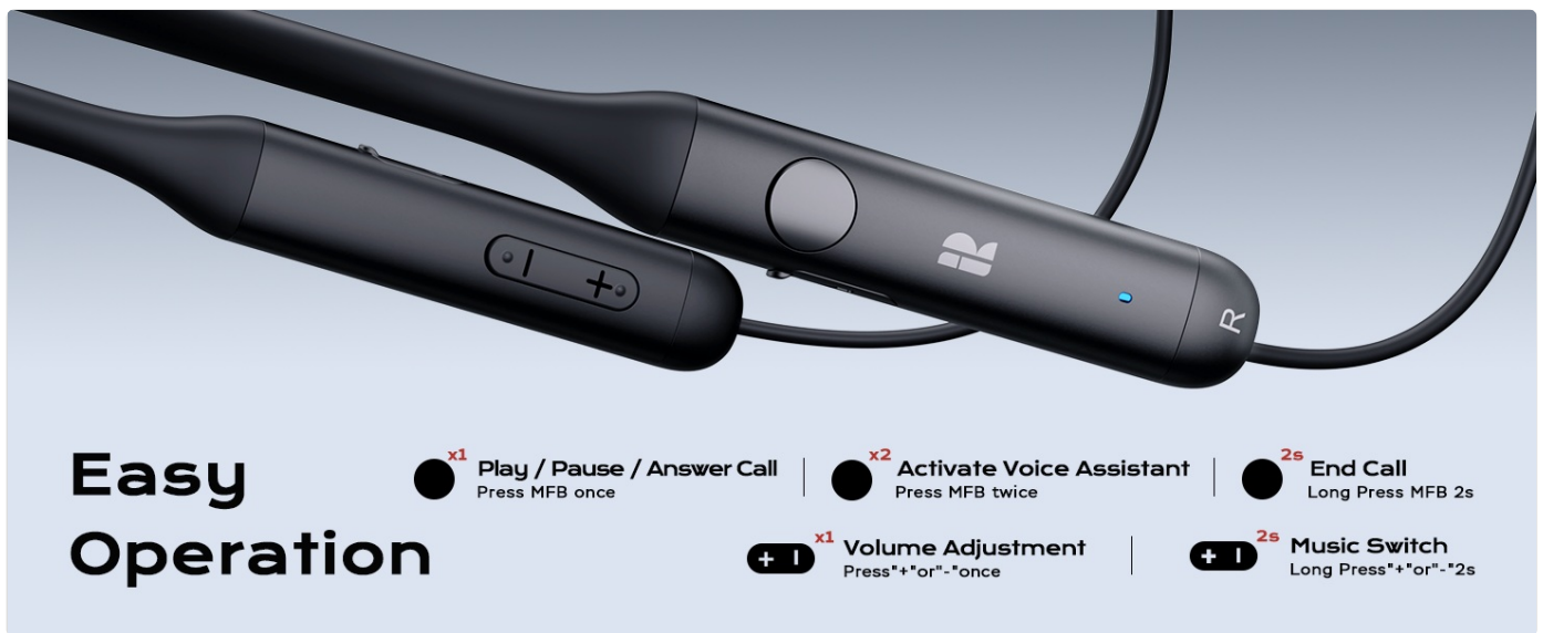
Image: A visual guide to the Rythflo WH02 headphone controls, detailing actions for play/pause, call management, volume adjustment, and voice assistant activation.