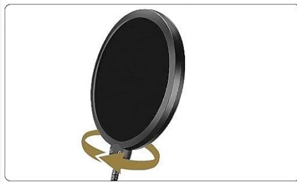
Flexible POP Filter