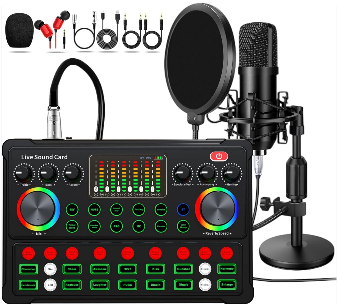
An overview of the complete CofeLife M300 Podcast Equipment Bundle, showcasing the main Live Sound Card, the 48V condenser microphone with its pop filter and desktop stand, and all accompanying cables and accessories.