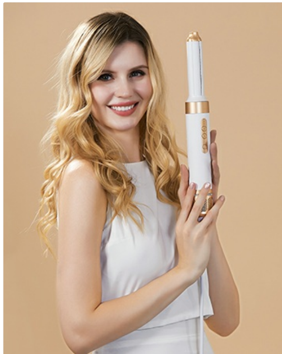
Image: Step-by-step guide for using the curling iron attachment.