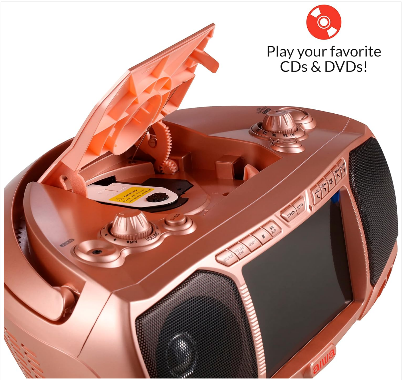
Figure 4: The top-loading disc compartment is open, revealing the CD/DVD player mechanism.