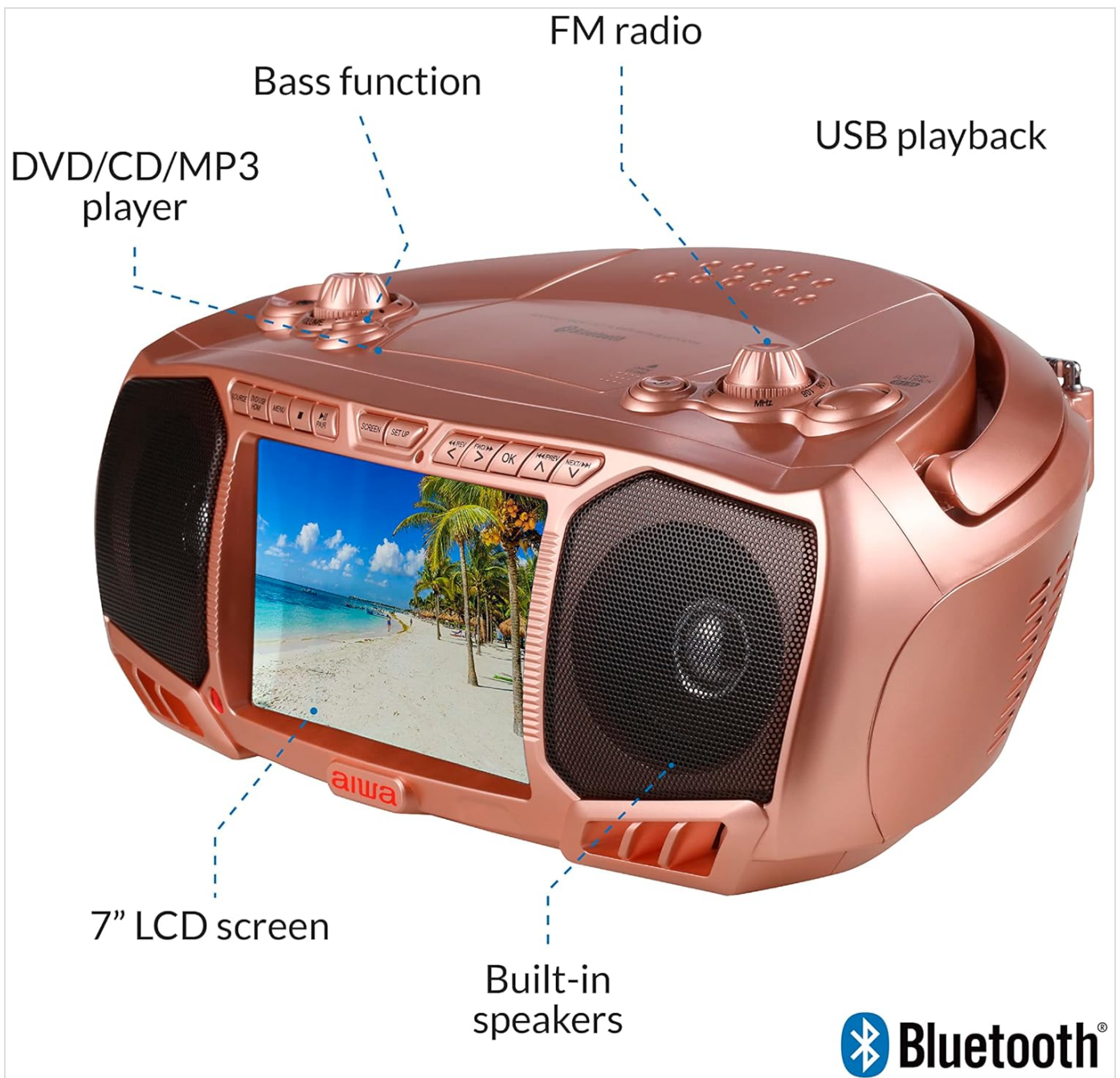
Figure 1: Aiwa Portable Boombox highlighting key features such as the 7-inch LCD screen, built-in speakers, DVD/CD/MP3 player, bass function, FM radio, and USB playback.