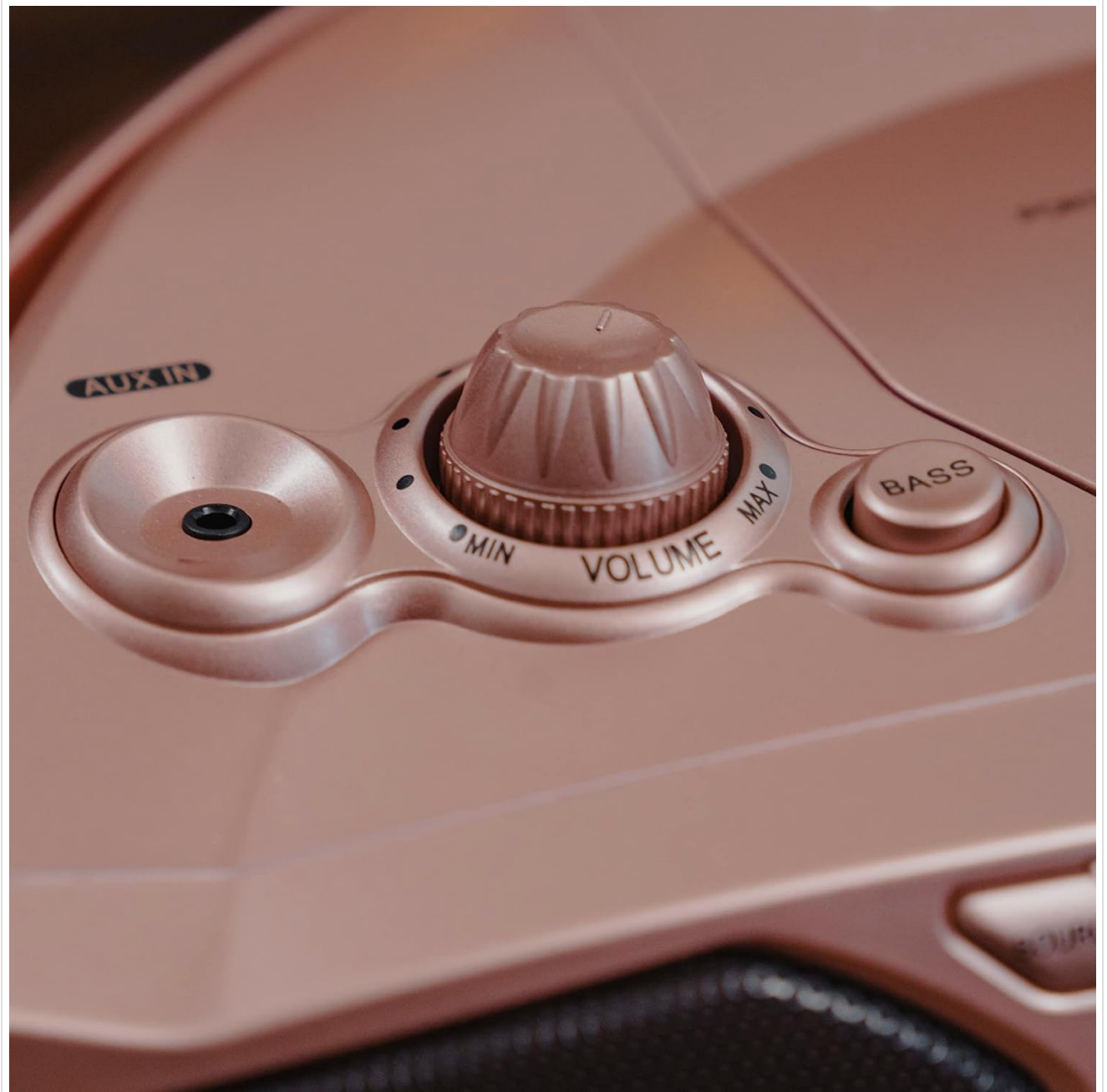
Figure 3: Detail of the volume and bass control knobs located on the top panel of the boombox.