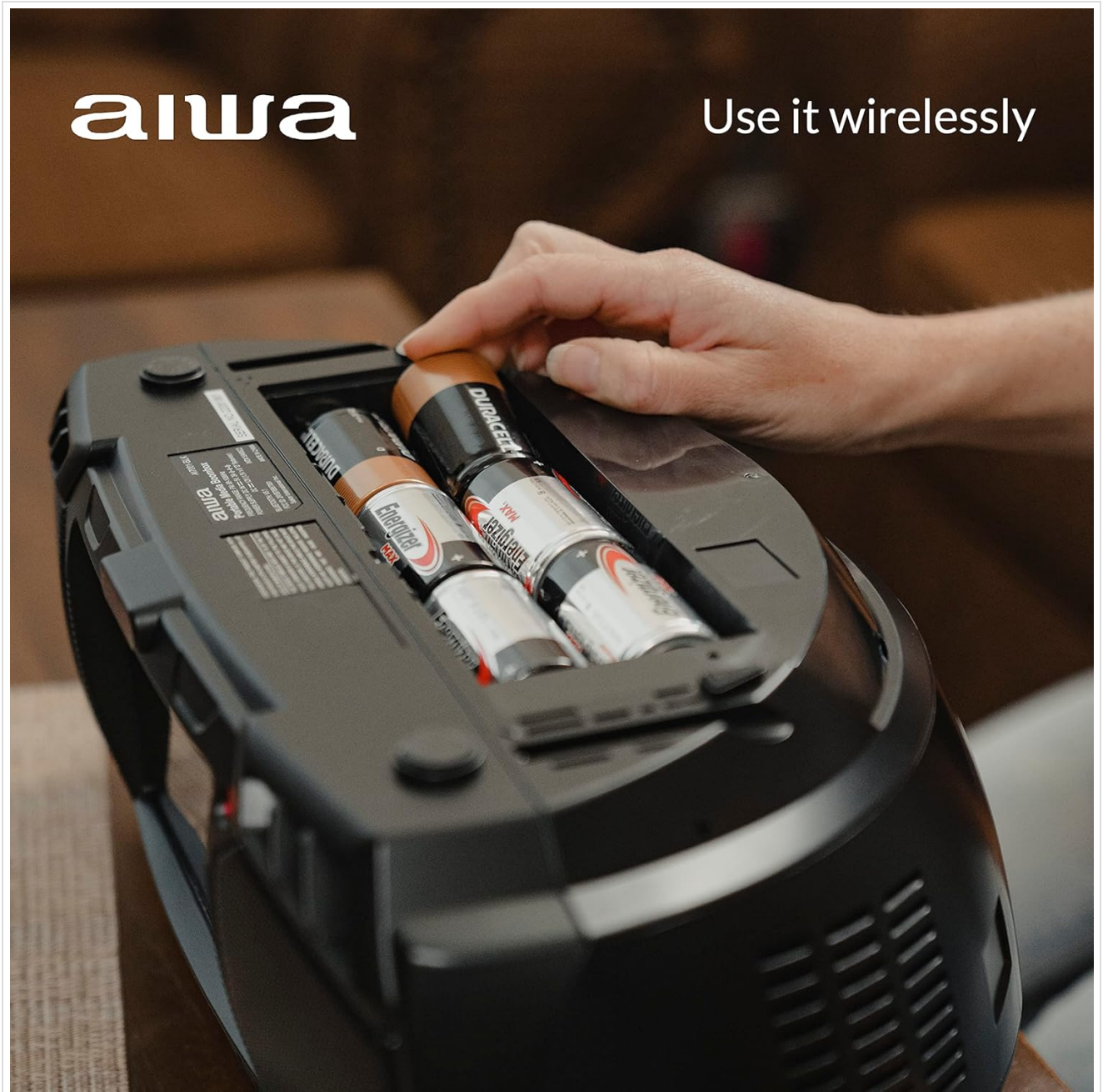
Figure 2: Inserting 8 D-cell batteries into the battery compartment located on the underside of the boombox.