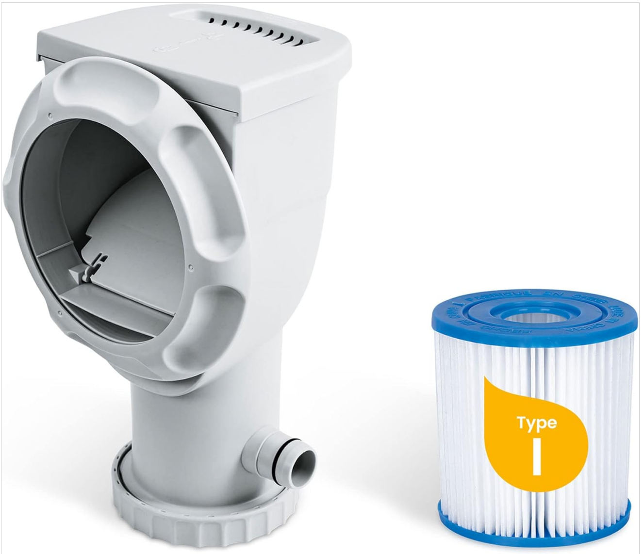
Image: The SkimmerPlus filter pump and a Type I replacement filter cartridge.