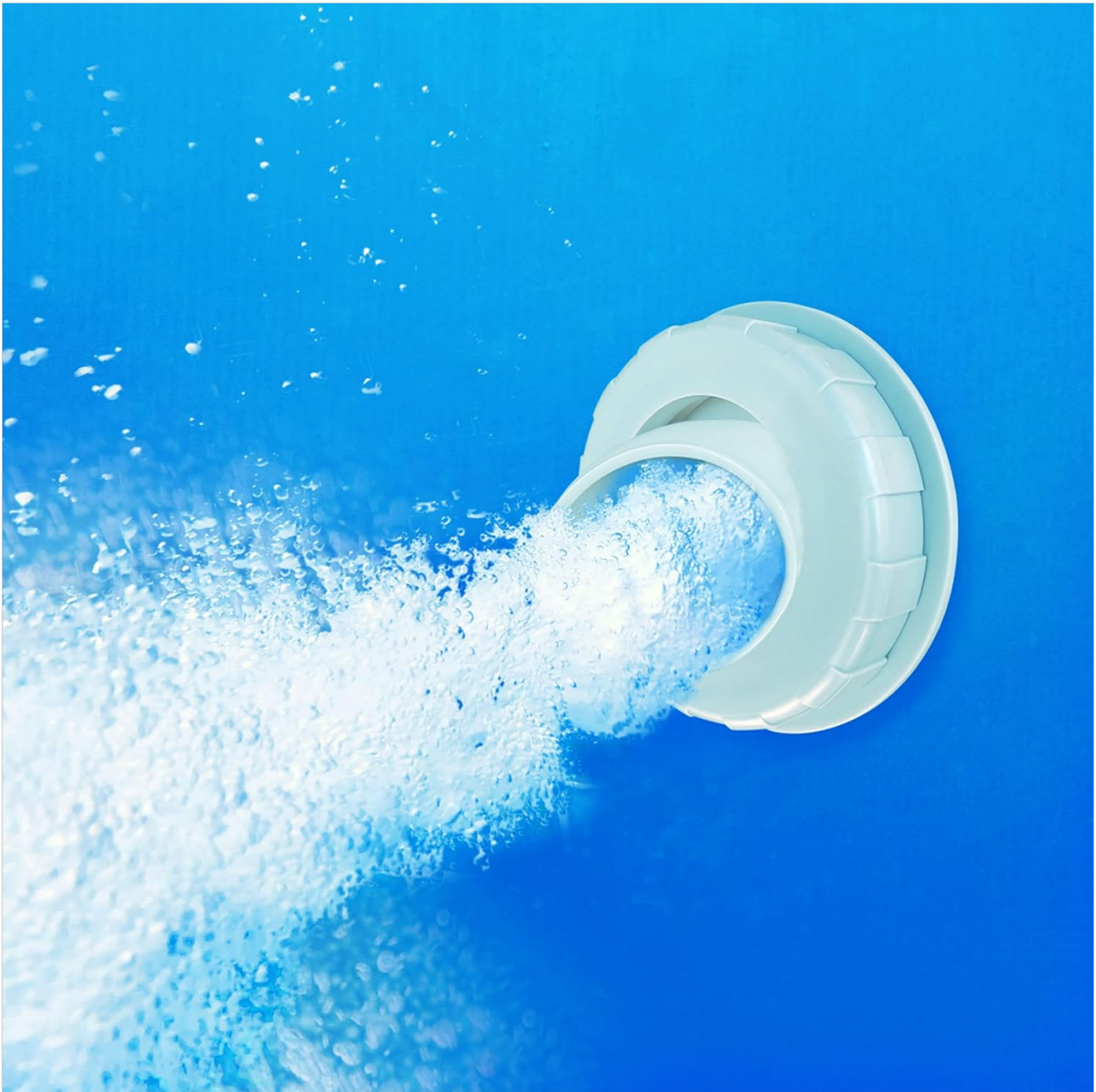
Image: Clean, filtered water returning to the pool.