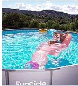
Image: Funsicle Customer Service contact details.