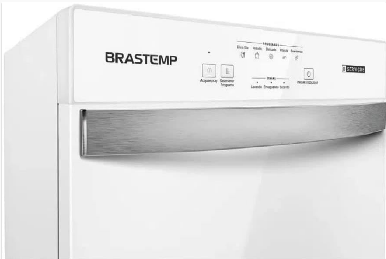
Figure 1: Front view of the Brastemp BLF08BB dishwasher, highlighting the control panel with program selection buttons and indicators.

The control panel provides access to various wash programs and functions. Refer to the image below for a visual guide to the controls.