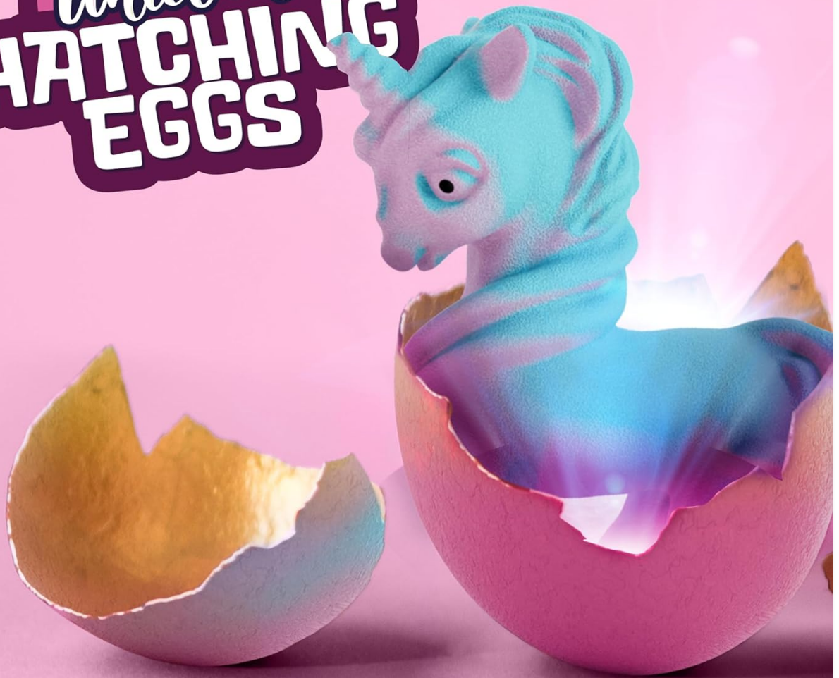
Image: A close-up view of a colorful unicorn figure partially emerged from its cracked eggshell, demonstrating the hatching stage.