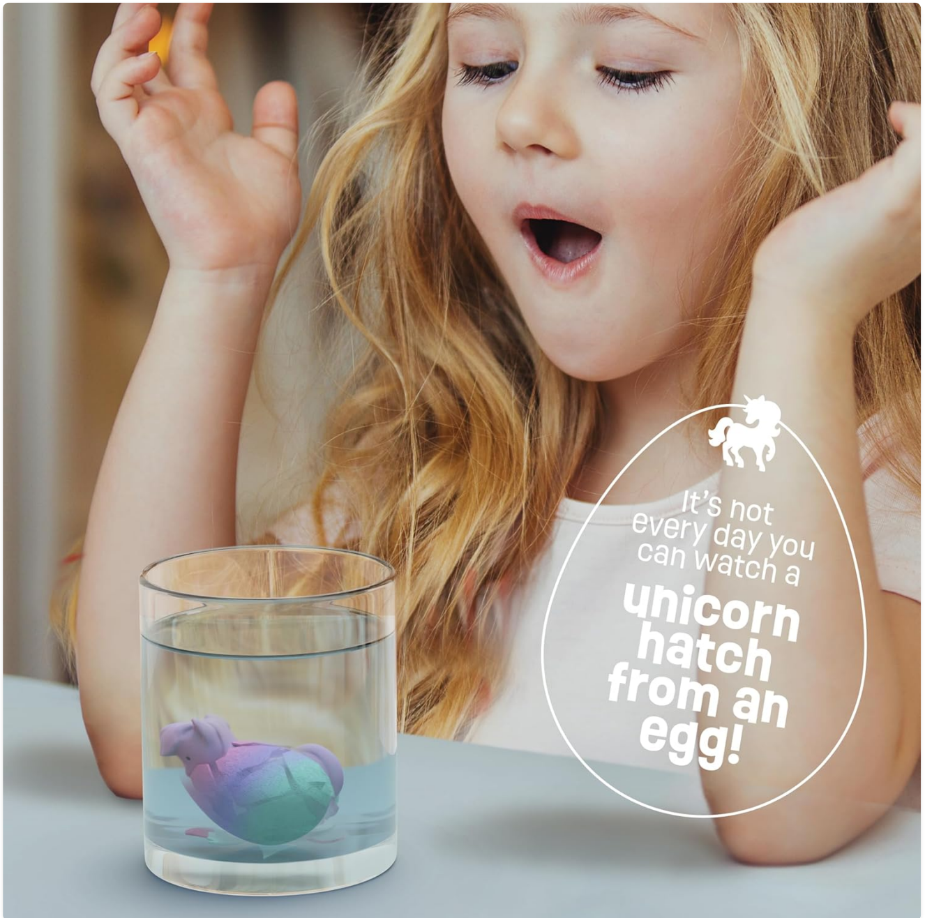
Image: A child observing a unicorn egg as it hatches in a glass of water, highlighting the engaging nature of the process.