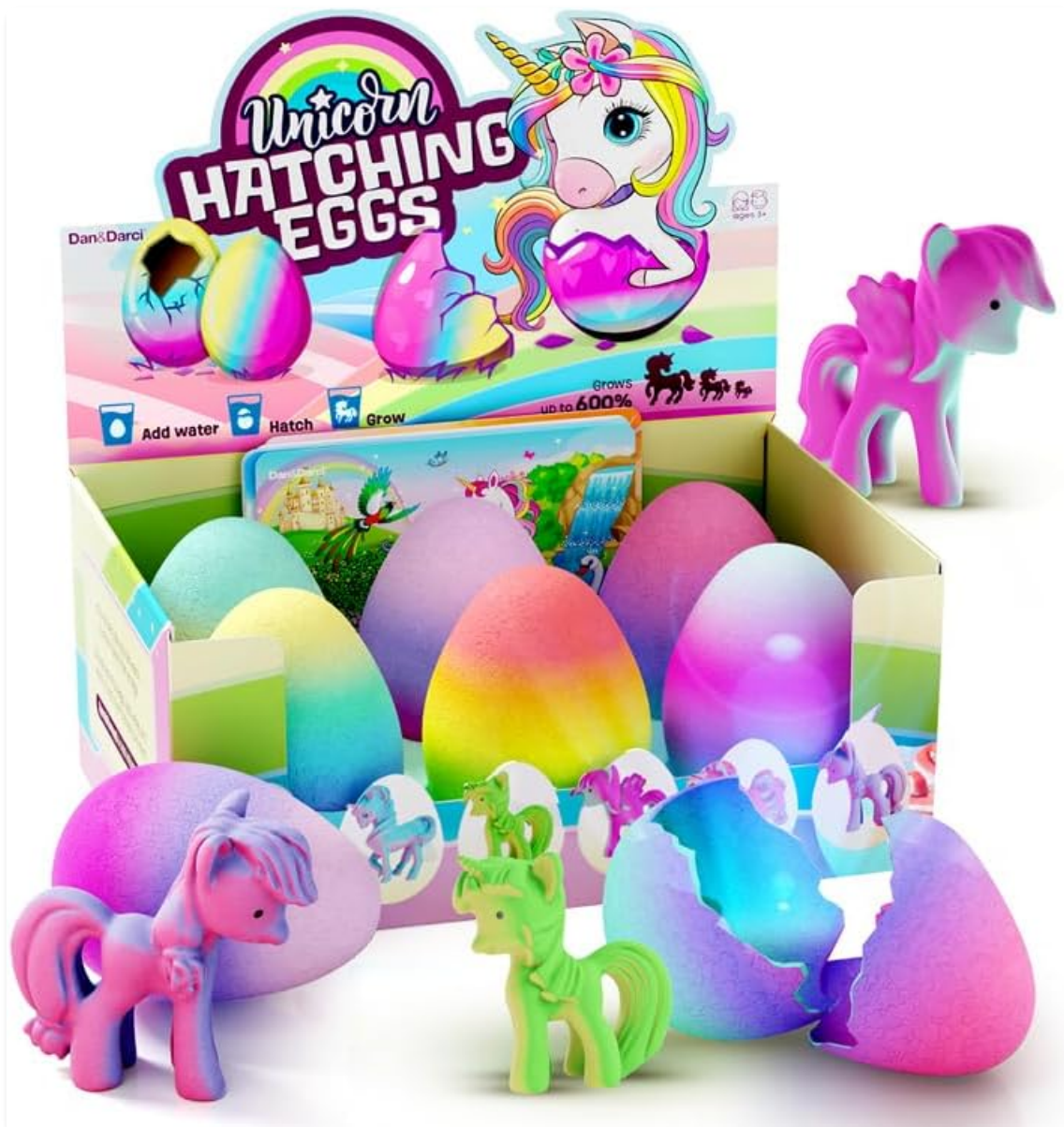
Image: The complete set of Dan&Darci Unicorn Hatching Eggs, showcasing the vibrant packaging, unhatched eggs, and several fully grown unicorn figures.