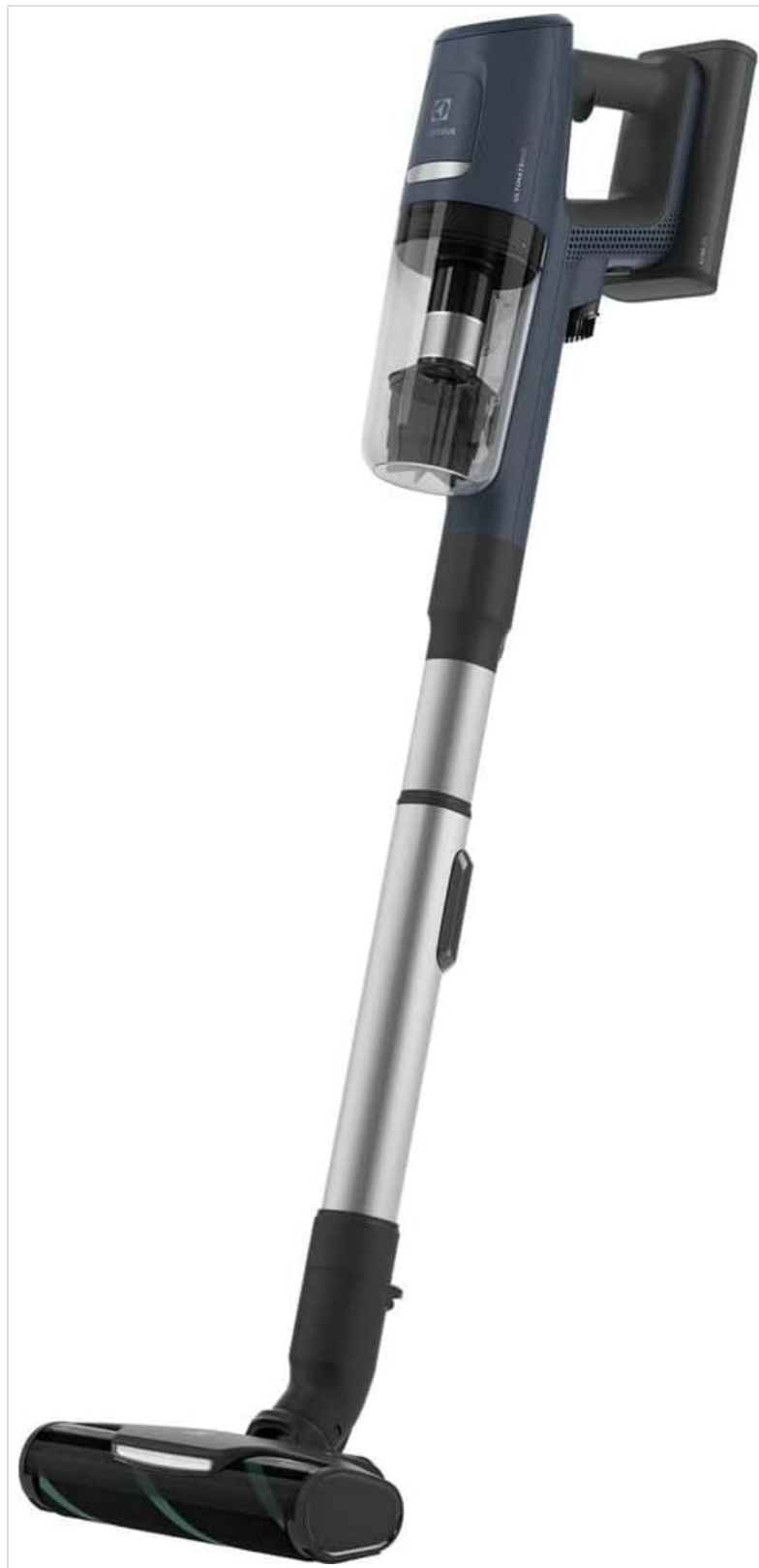
Figure 2: Angled view of the vacuum, highlighting the ergonomic handle and transparent dustbin.