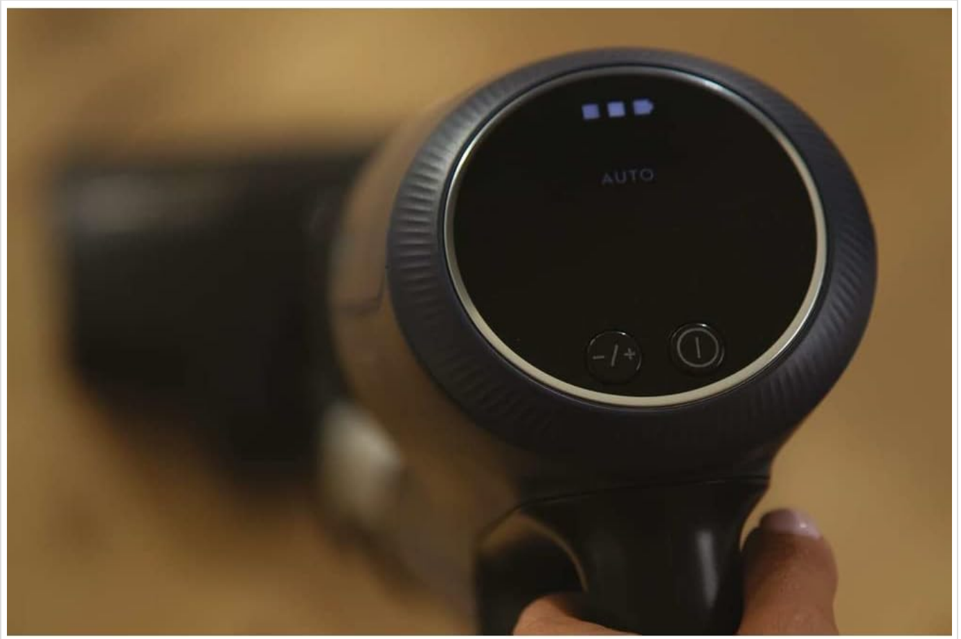
Figure 3: The LED Smart Display shows battery level and current power mode (e.g., Auto).