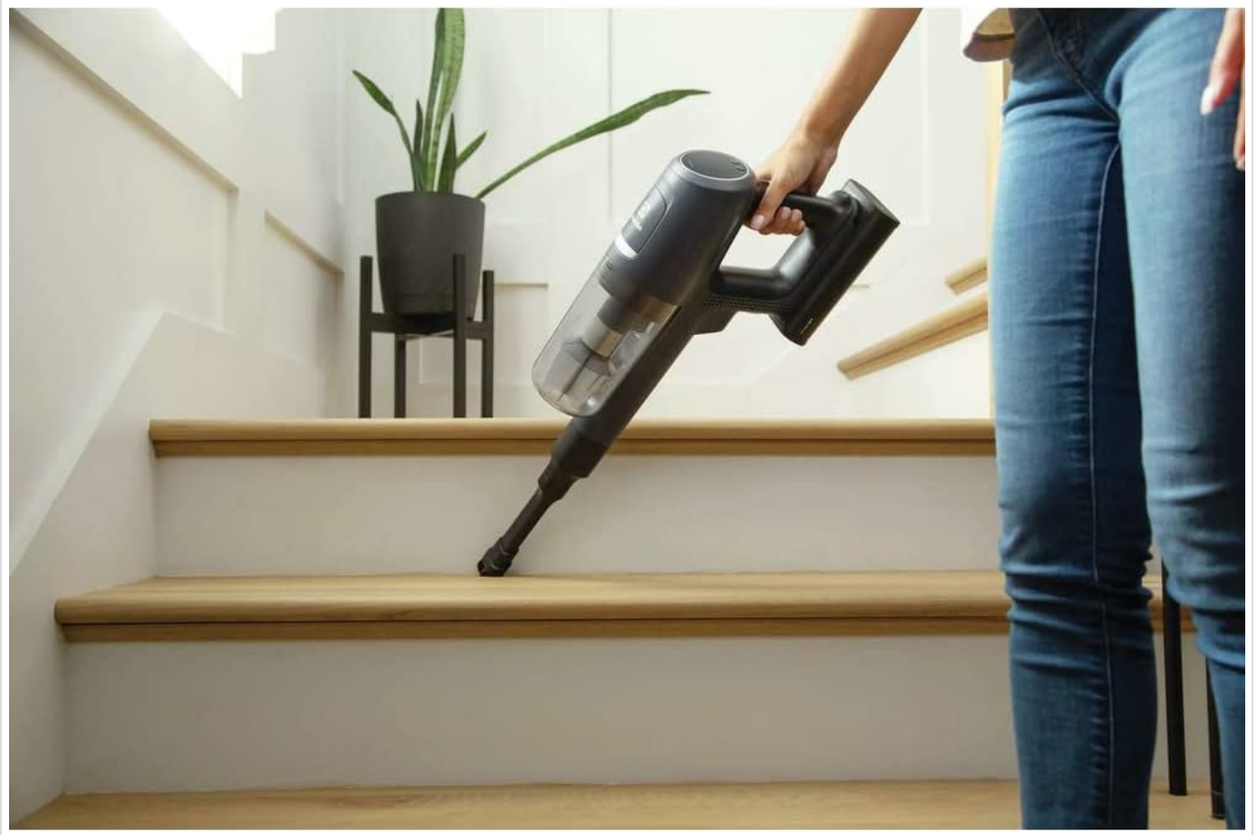
Figure 6: The handheld configuration is perfect for cleaning stairs and hard-to-reach areas.