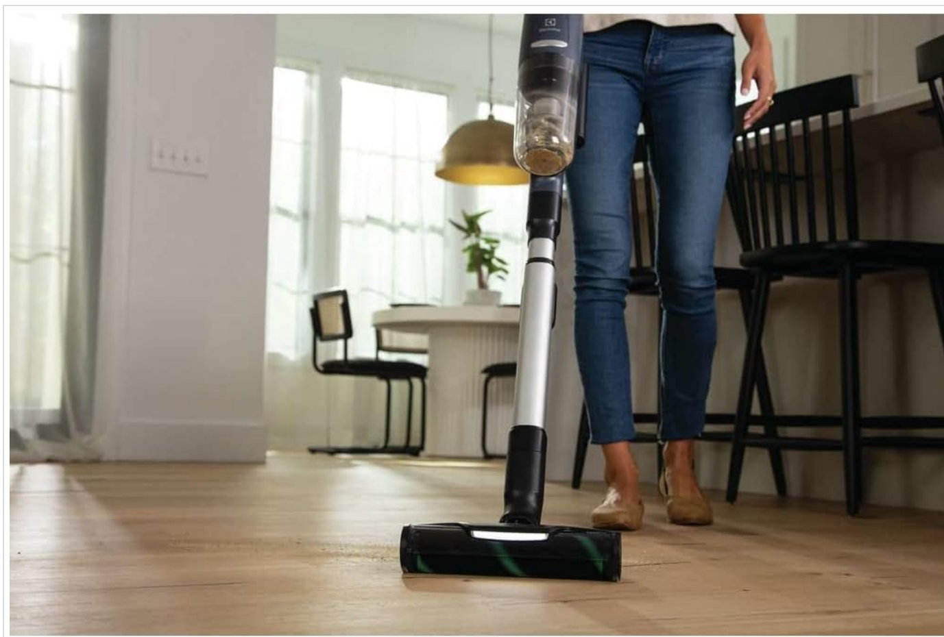
Figure 4: The PowerPro Hard Floor Nozzle effectively cleans debris from wooden floors.