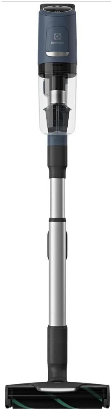
Figure 1: Fully assembled Electrolux Ultimate800 Cordless Stick Vacuum.