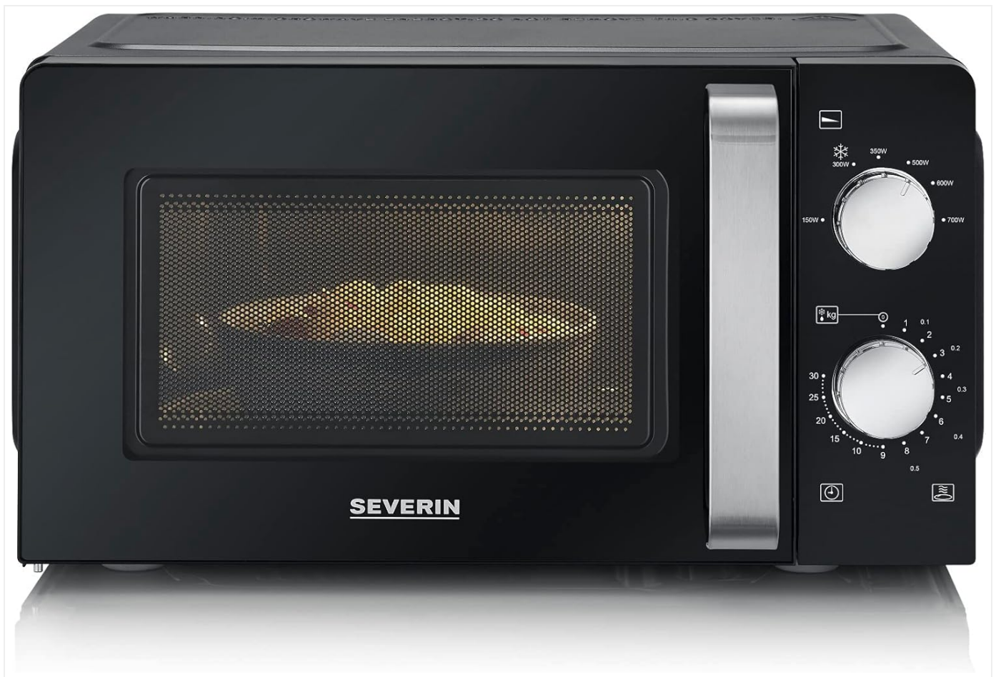
Front view of the SEVERIN MW 7886 Solo Microwave, showcasing its sleek black and stainless steel design.