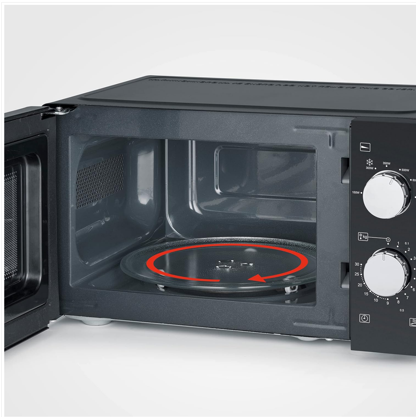
The interior of the microwave, showing the removable glass turntable for even heat distribution.