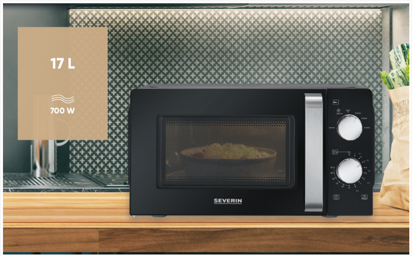
Visual representation of the microwave's capacity and power output.

Detailed technical specifications for the SEVERIN MW 7886 Solo Microwave.