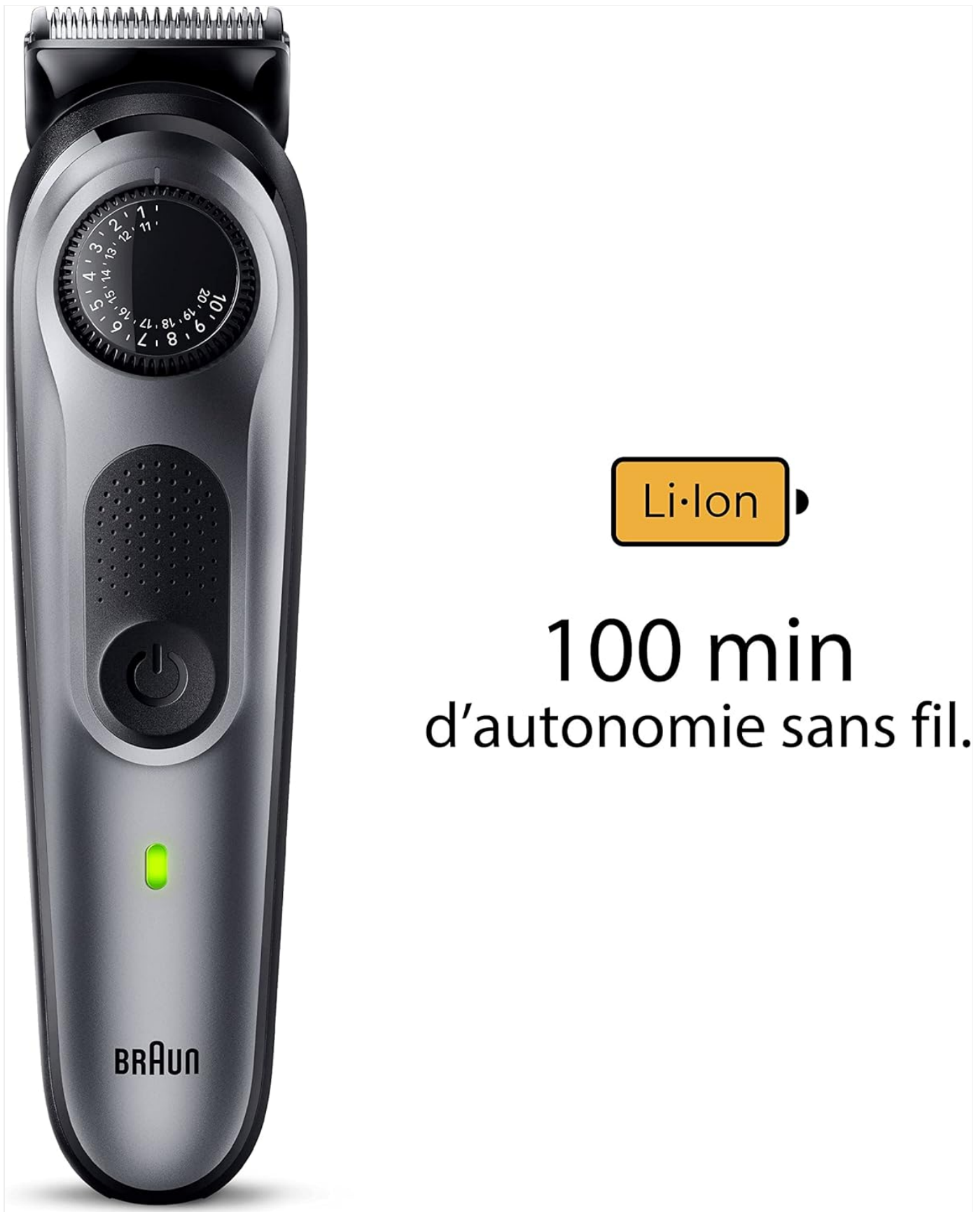
Image: The Braun Series 5 BT5440 trimmer displaying a green charging indicator light, emphasizing its 100 minutes of cordless operation powered by a Li-ion battery.