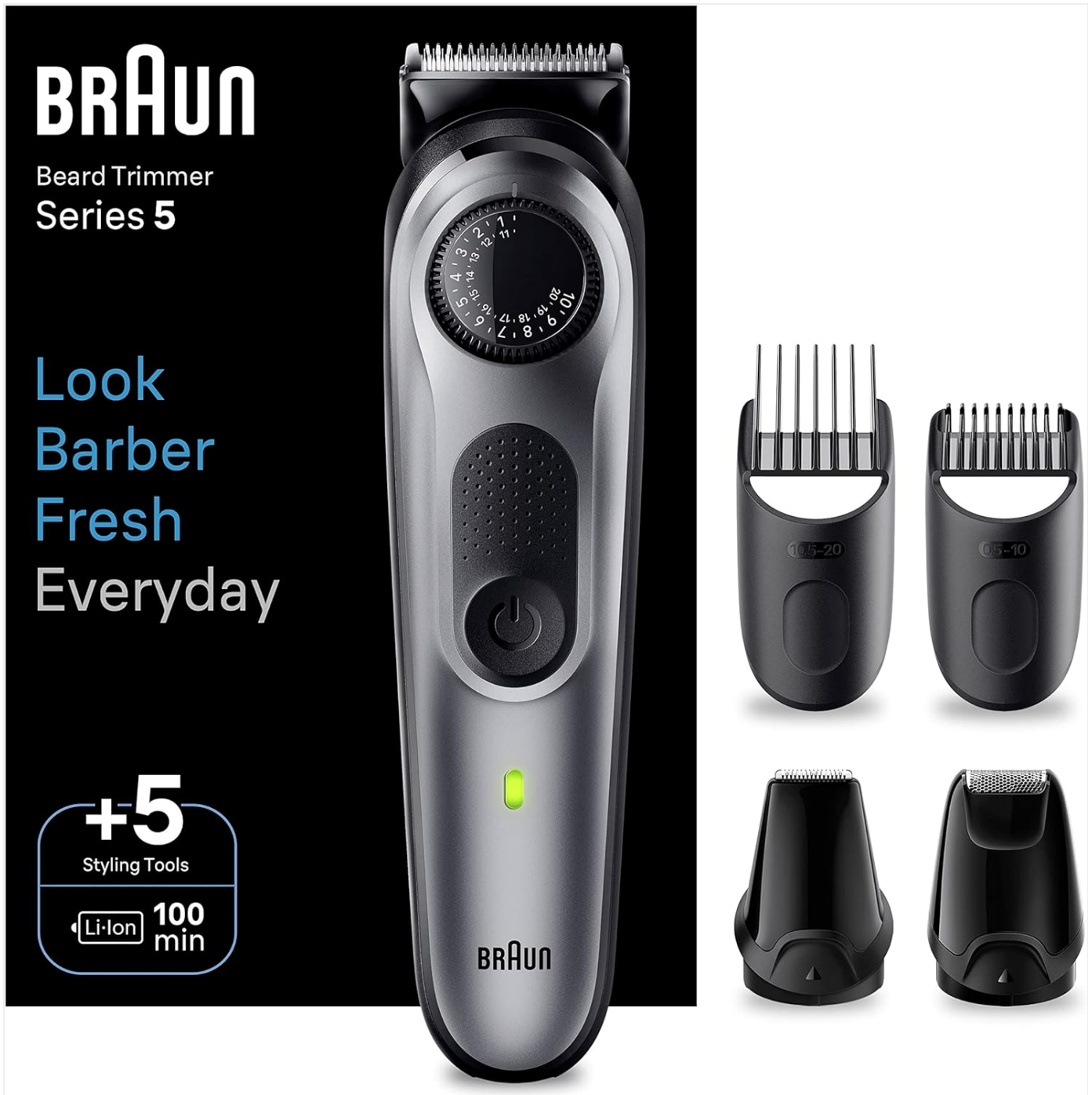
Image: The Braun Series 5 BT5440 Beard Trimmer shown with its various attachments, including two precision combs, a mini foil shaver, and a cleaning brush, all neatly arranged next to the main trimmer unit.