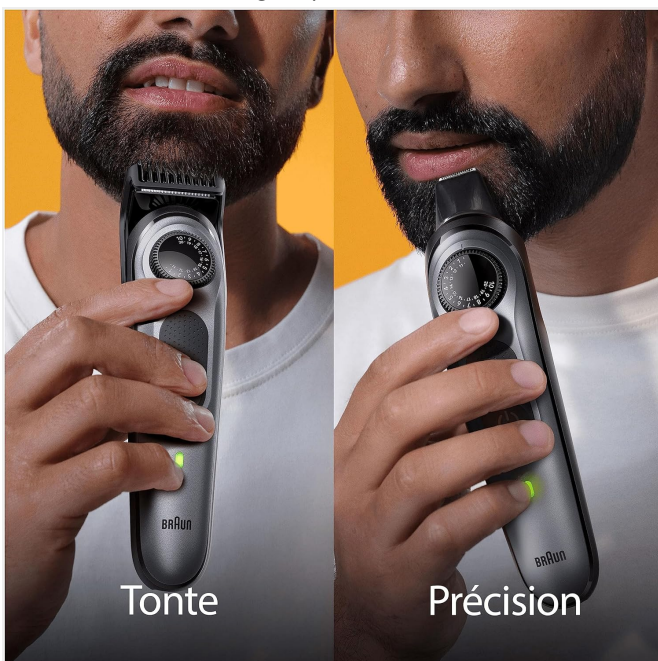
Image: Two views of the Braun Series 5 BT5440 in use, one for general trimming and the other for precise detailing around the mouth area.