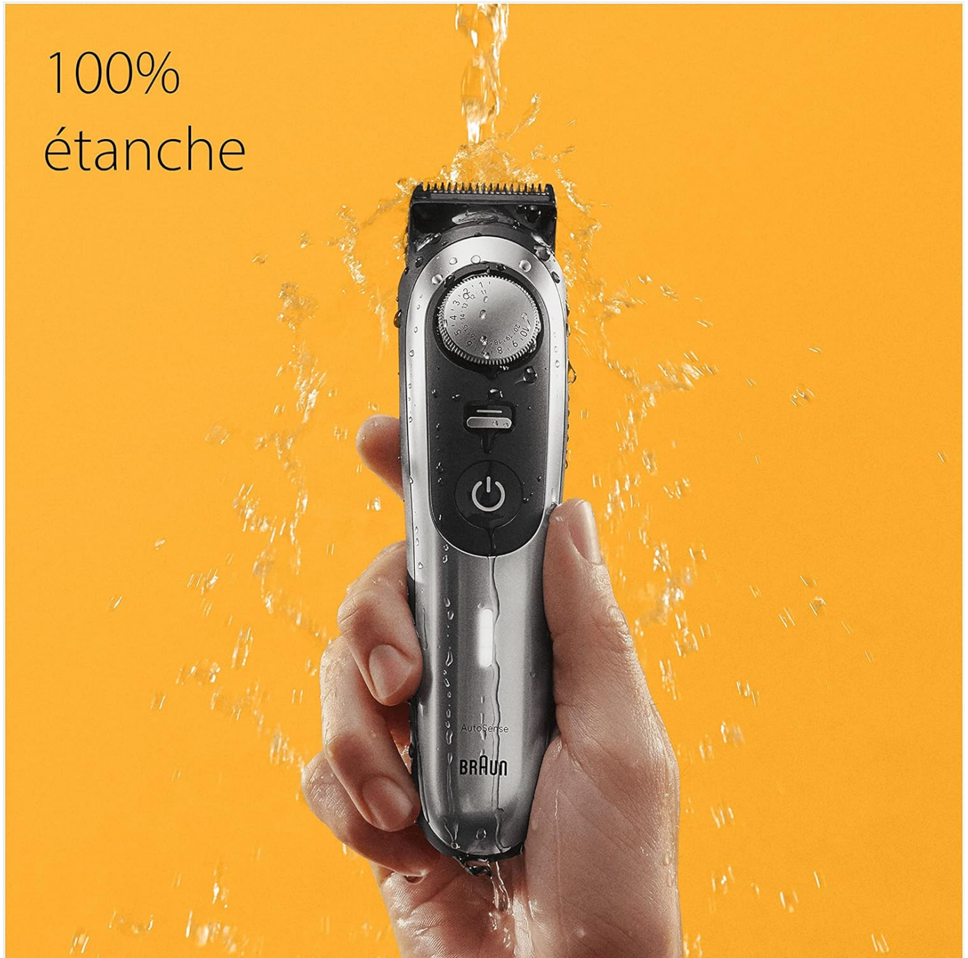
Image: A hand holding the Braun Series 5 BT5440 trimmer under running water, illustrating its fully washable and waterproof design for easy cleaning.