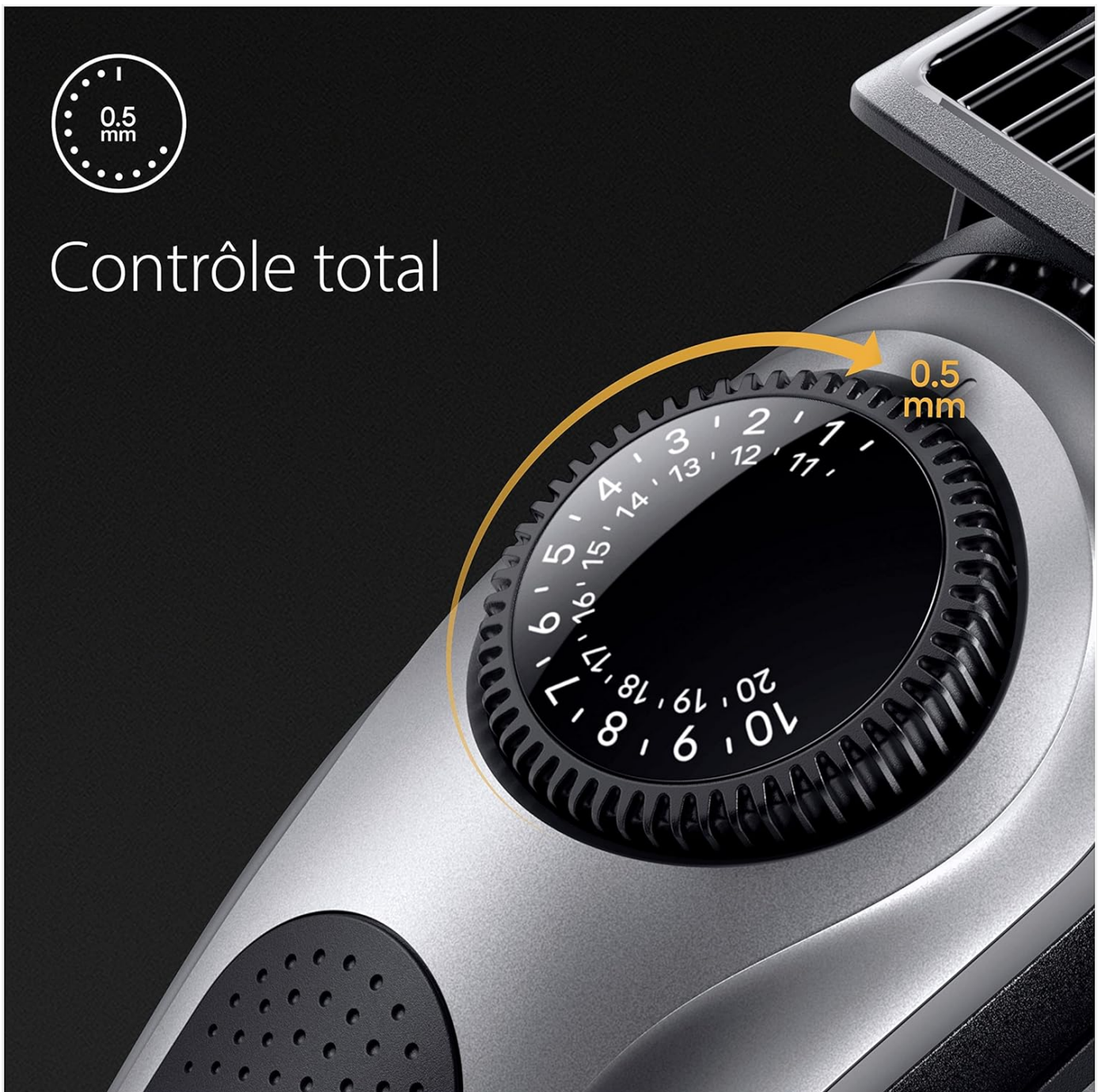
Image: A detailed view of the Braun Series 5 BT5440's Precision Wheel, highlighting the 0.5 mm increment markings for precise length control.